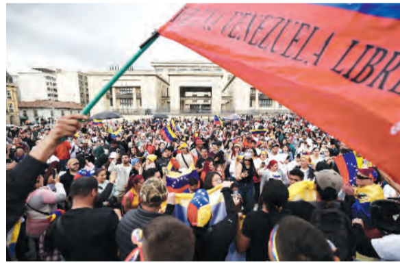
Venezuelans celebrate in Bogotá, Colombia on Saturday after US President Donald Trump announced that US forces had captured Venezuelan President Nicolás Maduro

For some Venezuelan natives, the military action — culminating months of stepped-up US pressure — brought their dreams of reuniting with loved ones closer to reality after years of heartbreaking separations. People gathered for a rally