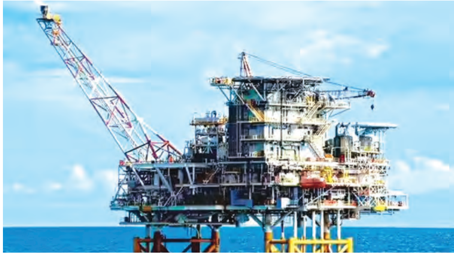
Gandhar oilfield in Gujarat

CO 2 will be captured from nearby industrial sources in the Dahej area as well as ONGC's own Hazira plant, transported to the Gandhar wells and injected underground to prevent it from entering the atmosphere. The project also aims to test using CO 2 to enhance oil recovery, turning a potentially harmful greenhouse gas into a productive resource, they said. ONGC had previously sourced CO 2