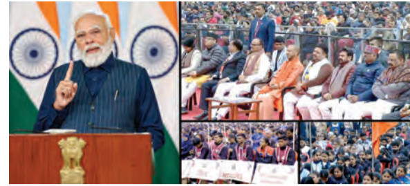
A split-screen shows Prime Minister Narendra Modi, left, addresses the inauguration of the 72nd National Volleyball Tournament in Varanasi via video conferencing from New Delhi

Noting that initiatives like the Target Olympic Podium Scheme (TOPS) were transforming the sports ecosystem in India, with efforts focused on building strong infrastructure, funding mechanisms, and providing young athletes with global exposure, he said that the country's growing clout in sport could be gauged from the fact that India had hosted 20 top-notch interna-