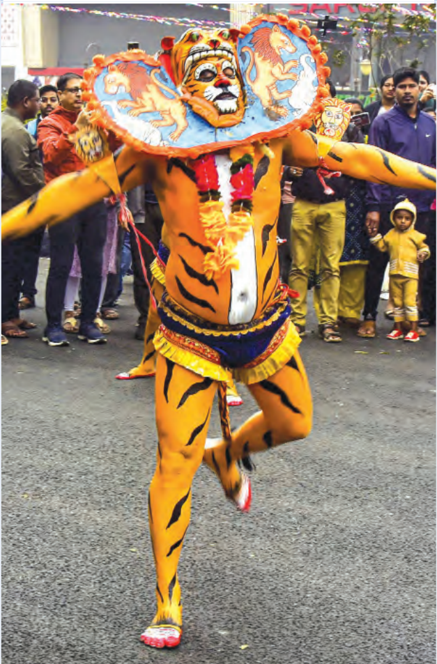
Artists perform traditional folk dance during Patha Utsav celebration, in Bhubaneswar Odisha PTT