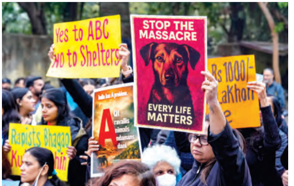
Animal rights activists and dog lovers hold placards during a protest against Supreme Court order on stray dog relocation at Jantar Mantar in New Delhi

On November 7, 2025, the Supreme Court ordered to remove all stray dogs from railway stations, schools, hospitals, bus stops and other public areas and relocate them to a "designated shelter" after due sterilisa-