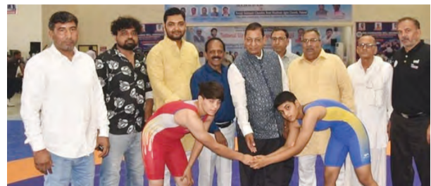
WFI bars technical officials from inter-university wrestling meet