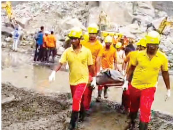
Rescue operation underway after rock collapse on Saturday at an unauthorised stone quarry in Odisha's Dhenkanal district.

"As per available information, only two persons were there, and two bodies were