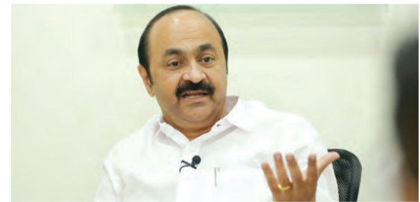
Leader of the Opposition in the State Assembly VD Satheesan

The report said GBP 22,500 (around ₹19.95 lakh) was collected from various individuals in the UK and transferred to the foundation's account.