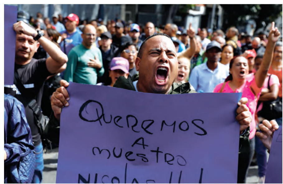
A supporter of Venezuelan President Nicolás Maduro displays a sign reading in Spanish "We want our Nicolás" during a rally in Caracas, Venezuela

ASSOCIATED PRESS ■ Washington Secretary of State Marco Rubio suggested Sunday that the United States would not take a day-to-day role in governing Venezuela other than enforcing an existing "oil quarantine" on the country, a turnaround after President Donald Trump announced a day earlier that the US would be running Venezuela following its ouster of leader Nicolás Maduro. Rubio's statements on TV talk shows seemed designed to temper concerns about whether the assertive American action to achieve regime change might again produce a prolonged foreign intervention or failed attempt at nation-building. They stood in contrast to Trump's broad but vague claims that the US would at least temporarily "run" the oil-rich nation, comments that suggested some sort of governing structure under which Caracas would be controlled by Washington. But Rubio offered a more nuanced take, saying the US would continue to enforce an oil quarantine that was already in place on sanctioned tankers before Maduro