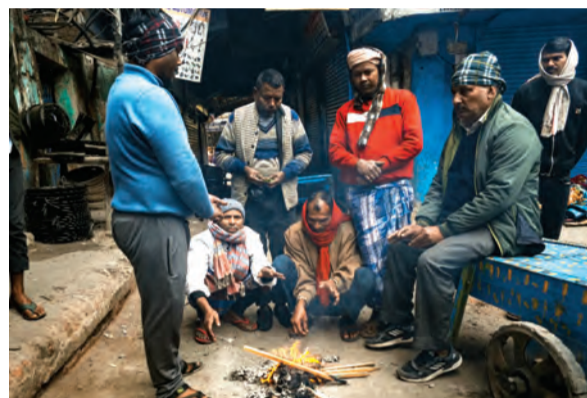
People warm themselves near a makeshift fire on a cold winter morning at Kashmere Gate area in New Delhi

Station-wise data on maximum temperatures