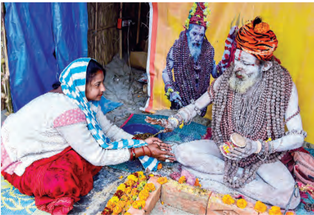
A woman takes blessings from a Naga sadhu of Niranjani Akhara during the ongoing Magh Mela festival at Sangam, in Prayagraj