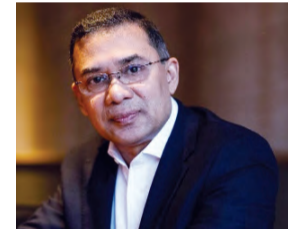
BNP acting chairman Tarique Rahman

Khaleda Zia, a three-time prime minister and the founding figure of the BNP, passed away on December 30 after a prolonged illness. Her death prompted tributes from leaders across South Asia, reflecting her long-standing influence on regional politics. In a personal letter addressed to her son and BNP acting chairman Tarique Rahman, Prime Minister Modi described Zia as a leader of "rare resolve and conviction" whose vision and legacy would