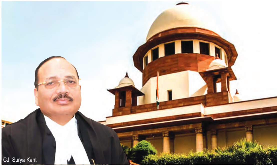
CJI Surya Kant

Further, the SOP is likely to encourage crispness in thought and articulation and move away from the practice of reading long passages from books or voluminous pleadings. Till now, self-regulation has been the model where counsel honestly estimate their time needs.