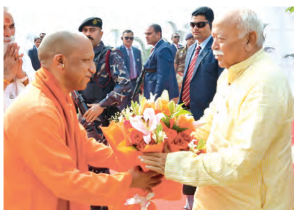
Uttar Pradesh Chief Minister Yogi Adityanath (right) interacting with a group of people during an event.

the strength of society and works with a spirit of service," Adityanath said. The CM added that the organisation serves every distressed person, irrespective of religion, language or region. "RSS teaches that the nation comes first, and anyone who can contribute to taking India to greater heights must be supported," he said. Adityanath also criticised those who, according to him, have turned service into a tool of deals and influence, claiming that they attempt to change India's demographic character through pressure and greed. Referring to the spiritual message of the Bhagavad Gita, the Chief Minister said it can provide guidance in challenging times.