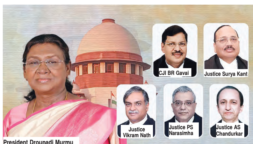
President Droupadi Murmu

The two-judge Bench prescribed a maximum of three months for the Governor to either withhold assent and return a Bill with a message or reserve it for the President's consideration, and a maximum of one month for the Governor to grant assent to a Bill re-enacted by the State Legislature.