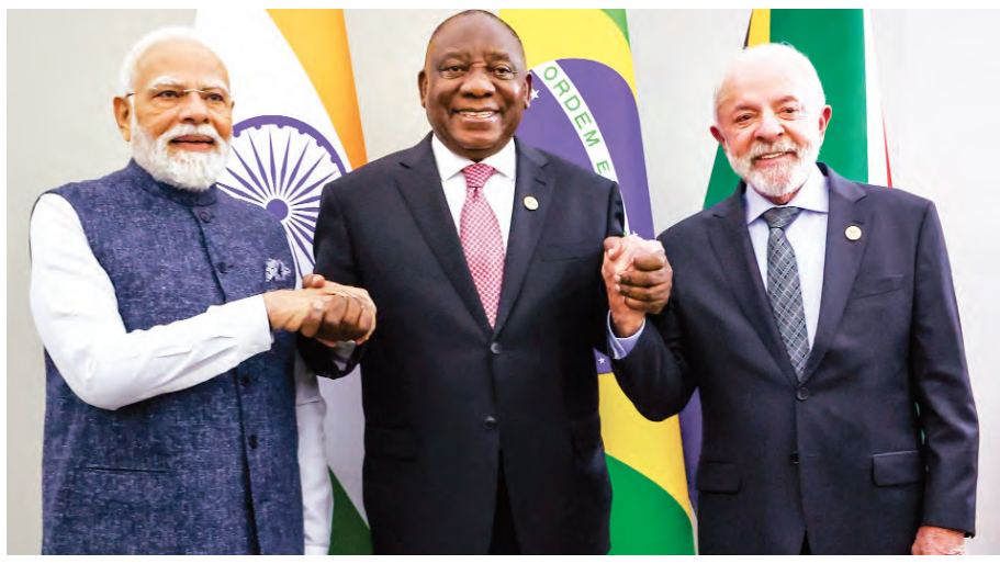
Prime Minister Narendra Modi with South African President Cyril Ramaphosa, centre, and Brazilian President Luiz Inacio Lula da Silva, right, during IBSA Leaders' meeting, on the sidelines of the G20 Summit in Johannesburg.

Prime Minister Narendra Modi on Saturday proposed a G20 initiative aimed at enhancing clean energy transitions by boosting recycling, easing supply chain pressures and advancing joint research on critical minerals, and suggested forging a partnership to make satellite data more accessible and interoperable. On the sidelines of the Summit, Modi met several world leaders, including his British counterpart Keir Starmer, French President Emmanuel Macron, South Korean President Lee Jae-myung, Brazilian President Lula da Silva and several other world leaders on the sidelines of the G20 Summit and discussed issues of bilateral and mutual interests. PM Modi also met his Japanese counterpart Sanae Takaichi on the sidelines