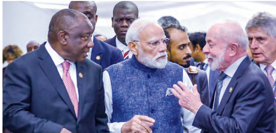
Prime Minister Narendra Modi with South African President Cyril Ramaphosa and Brazilian President Luiz Inacio Lula da Silva during G20 Summit in Johannesburg

Thanking the G20 members for their attendance, Ramaphosa said their top of form commitment had been vital in reaffirming the G20 as the premier forum for international economic