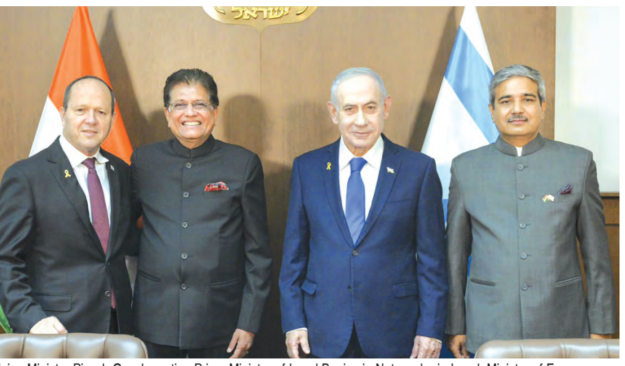
Union Minister Piyush Goyal meeting Prime Minister of Israel Benjamin Netanyahu in Israel. Minister of Economy and Industry of Israel Nir Barkat and others are also present

sooner," Goyal said here. The minister is in Israel to meet leaders and businesses to discuss ways to boost bilateral trade and investments. He is leading a 60-member business delegation. Goyal said that he and Israeli Economy and Industry Minister Nir Barkat have agreed that they will first focus on low-hanging fruit in the FTA. They have also decided not to touch the sensitive issues on both sides. The two countries, he said, may look at "how innovative and R&D can drive greater investments in each other's countries, work on joint projects where we can leverage on their skill sets and they can leverage on the economies of scale in a large market like India". "It is quite possible that we may come out with the first phase on an FTA, so that we can kickstart the benefits faster," Goyal said. On a big metro project in Israel, the minister said Israel has just come out with pre-qualifica-