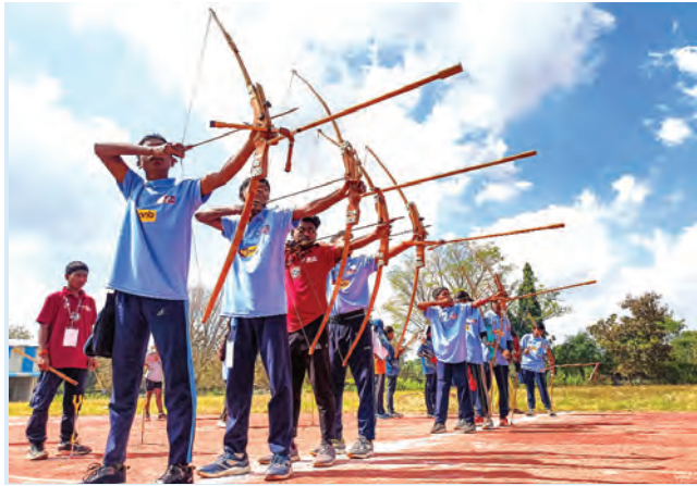
Players in action during an archery match organised by the Sports and Youth Welfare Department of the state, in Jagdalpur