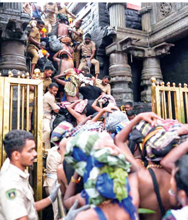
People move in a queue to offer prayers to Lord Ayyappa at the Sabarimala Temple in Pathanamthitta district in Kerala