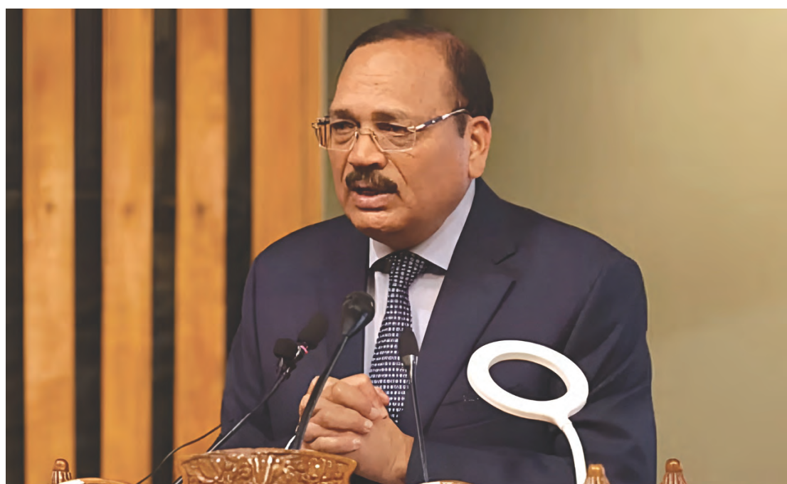
Justice Surya Kant

would be to focus on the higher judiciary, especially the High Courts and the Supreme Court. Quite remarkably, the outgoing Chief Justice of India, Justice GR Gavai, poignantly observed on his last working day at a farewell hosted by women lawyers of the Supreme Court at the Women's Bar Room, "...I have a regret that I could not get a woman member to the Supreme Court ... but in so far as High Courts are concerned we had recommended 16 women Judges... among them are women lawyers of Supreme Court. So, my collegium always believed in wide representative to women members..."