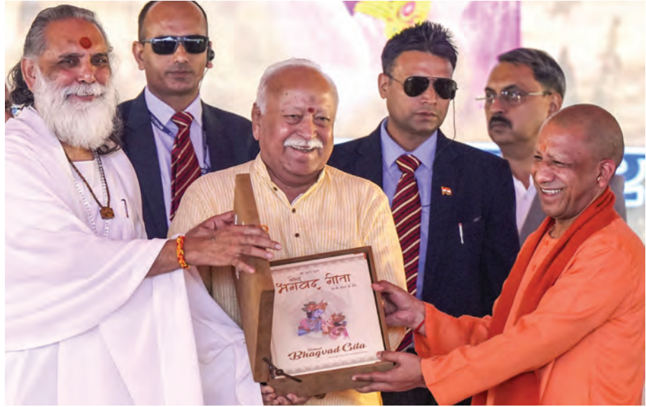
Uttar Pradesh Chief Minister Yogi Adityanath and RSS chief Mohan Bhagwat hold a copy of the 'Bhagavad Gita' during the 'Divya Geeta Prerna Utsav' programme, in Lucknow, on Sunday.

Bhagwat said India's ancient wisdom once guided the world for thousands of years, and the Gita is the distilled essence of that knowledge. "Just as Krishna removed Arjuna's confusion,