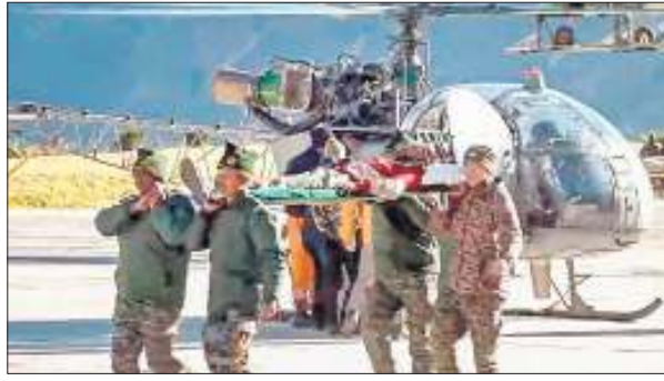
One person is still missing for whom the search is in progress, they said. The bodies have been brought to Jyotirmath by helicopter where the post-mortem was being done at the Community Health Centre.