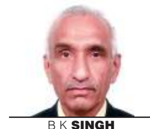
B K SINGH

Despite its noble intent to secure the livelihoods of tribals, the Forest Rights Act has inadvertently opened the door to rampant deforestation and widespread encroachment