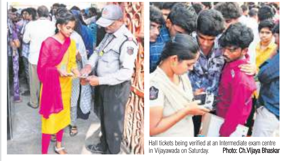
Hall tickets being verified at an Intermediate exam centre in Vijayawada on Saturday.

Traffic congestion from Ramavarappadu to Gudavalli, where several corporate colleges are located, further compounded the issue. With buses, cars, and two-wheelers parked