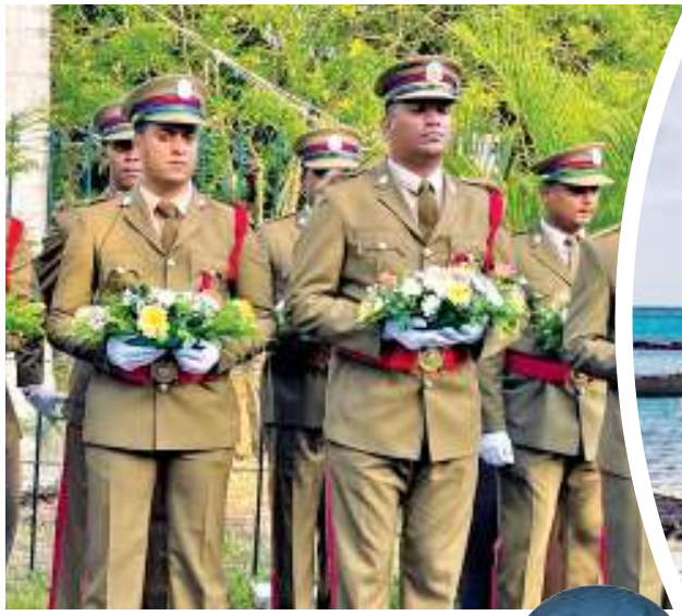
Despite its beauty, Mauritius honours its painful history of slavery annually on Abolition Day