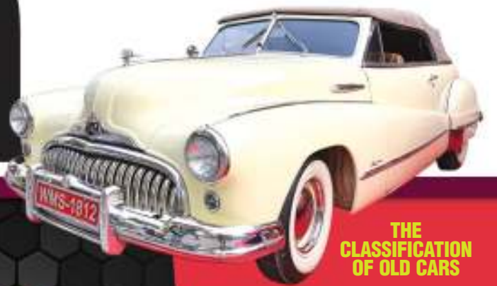
THE CLASSIFICATION OF OLD CARS

Contrary to popular perception not all cars are vintage cars. Old cars are classified into different categories based on the era of their manufacture, reflecting historical and technological advancements in automobile design. Here's a rundown of the key classifications: