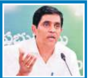
He criticised the TDP government for omitting debt details from Volume 6 (Budget in Brief) in this year's budget, alleging a deliberate attempt to conceal facts and sustain false propaganda against the YSRCP. He expressed confidence that the truth would eventually emerge through the Comptroller and Auditor General (CAG) report.

Rajendranath further noted that during Naidu's previous