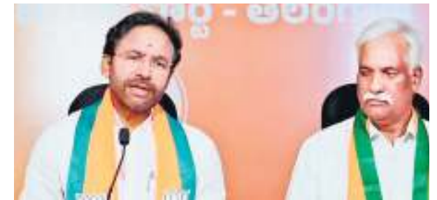
Telangana BJP president G Kishan Reddy addressing the media at State BJP office on Saturday

CM restless. I am condemning the CM's false statements. I am threatening anyone in politics. However, the CM is stooping low and hurling false allegations against me," he said. He said that he has never blocked any development project in Telangana. Revealing the letters addressed by him to Union Ministers and Chief Minister Revanth Reddy, Kishan said that the Centre will not give huge funds to any state. It is also not possible to give sanctions within three months.