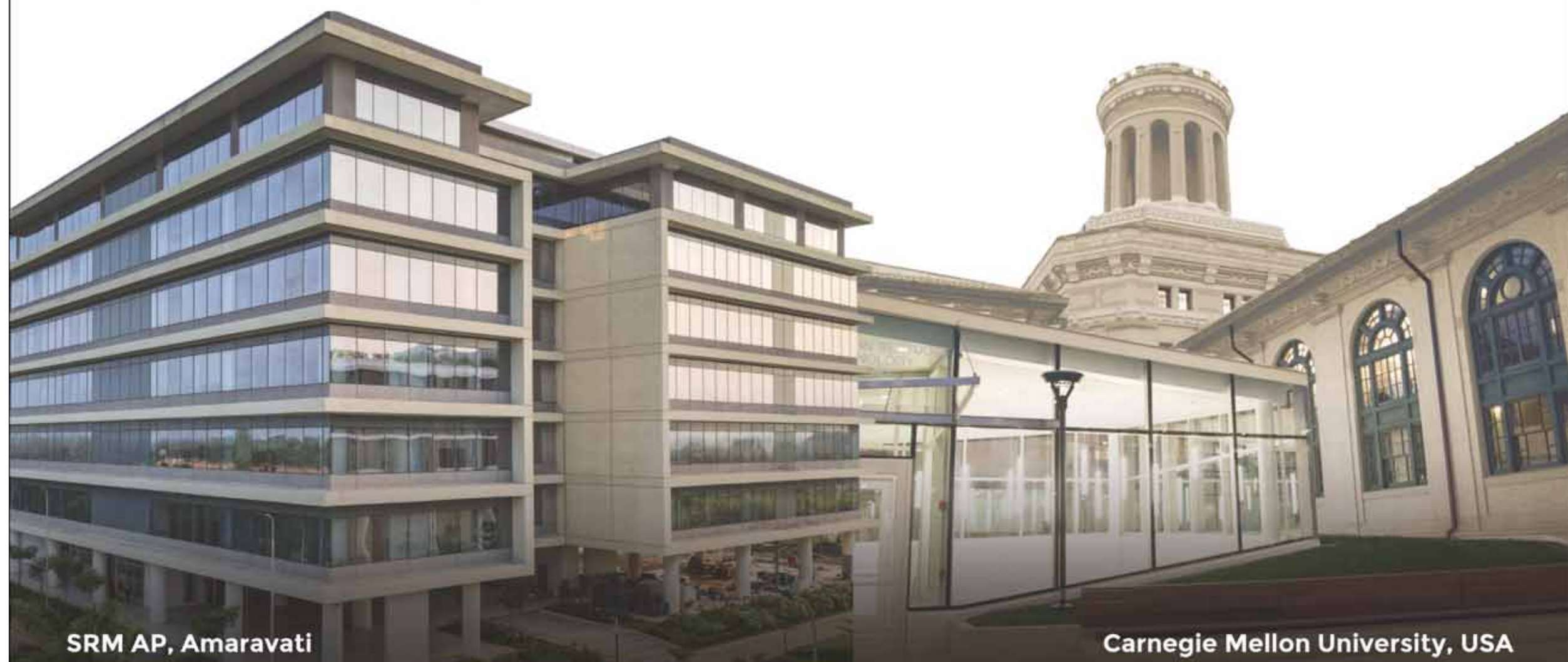
SRM AP, Amaravati

A collaboration to drive novel AI research, innovation and education to shape future AI leaders and redefine the technological landscape