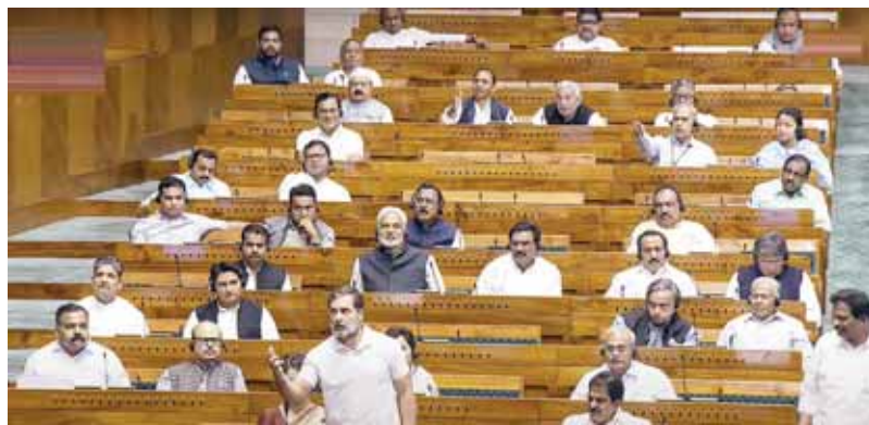
LoP in the Lok Sabha and Congress MP Rahul Gandhi speaks in the House during the Budget session of Parliament, in New Delhi, Monday

sition MPs giving notices under Rule 267 despite elaborate ruling by the chair a “vicious design to demean the institution of Parliament”. “They are not interested in debate. They want to give an impression that the government does not want to answer queries or enter into a debate.”