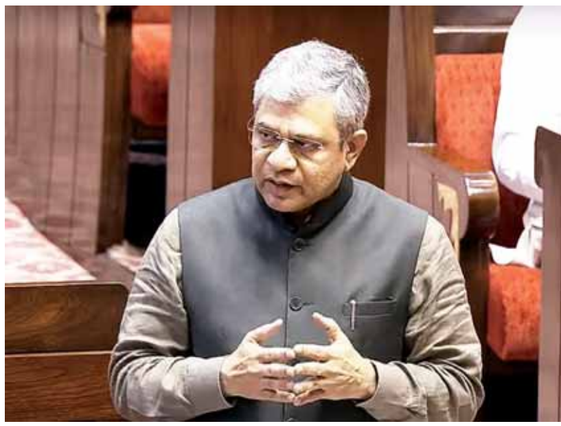
Railways Minister Ashwini Vaishnaw speaks in the Rajya Sabha during the Budget session of Parliament, in New Delhi on Monday

Alleging that under the proposed legislation there is no liberty and sovereignty of the Railway Board, he said, “The very freedom of the Railway Board is lost