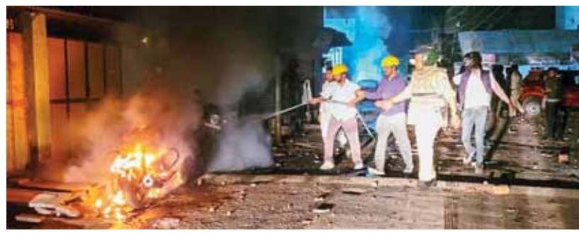
Police personnel try to douse a fire after clashes that broke out during a rally celebrating the Indian team's victory in the Champions Trophy final in Mhow in Madhya Pradesh on Sunday