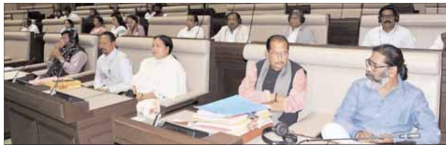
Chief Minister Hemant Soren along with his Cabinet Ministers and MLAs attending ongoing Budget Session of State Assembly in Ranchi on Monday.

Few days back, a 42-year-old NTPC official was shot dead by two motorcy-