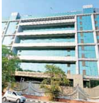
A day earlier in a massive crackdown the CBI arrested 26 railway officials, including a senior divisional electrical engineer of East Central Railway for allegedly leaking papers of a departmental examination and seized ₹1.17 crore cash during its raids. The railway officials were arrested on Monday night for allegedly leaking papers of

DEEPAK KUMAR JHA ■ NEW DELHI After several rail officials were nabbed in a Central Bureau of Investigation (CBI) trap pertaining to cases related to jobs, promotions in the Indian Railway networks, the Railway Board in a high level meeting on Wednesday decided that all departmental promotion examinations for the 13 Lakh rail employees will be done by the Railway Recruitment Board (RRB) via centralised examination through Computer Based Test (CBT) aptitude. Sources in the railways said all zonal railways will have to prepare a calendar for the examination and all examinations will be conducted on the basis of a calendar only. "This has been decided after a long experience of transparent, fair, and highly appreciated examinations conducted by RRB in recent years," sources said.