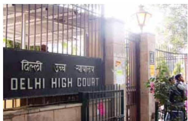
Delhi High Court

direction to the Ministry of Home Affairs to prepare rules for a centralised database of marriage registration. The Supreme Court, in February 2006, ruled that all marriages, irrespective of their religion, be compulsorily registered and directed the Centre and all states to frame and notify rules for this within three months. Pursuant to the top court's directions, the Delhi government issued an order on April 21, 2014 containing certain provisions for compulsory registration of marriage. The order is known as "Delhi (Compulsory Registration of Marriage) order, 2014. However, various deficiencies and lacunae were pointed out in the rules by the petitioner, who said the state and the Central governments were informed about it.