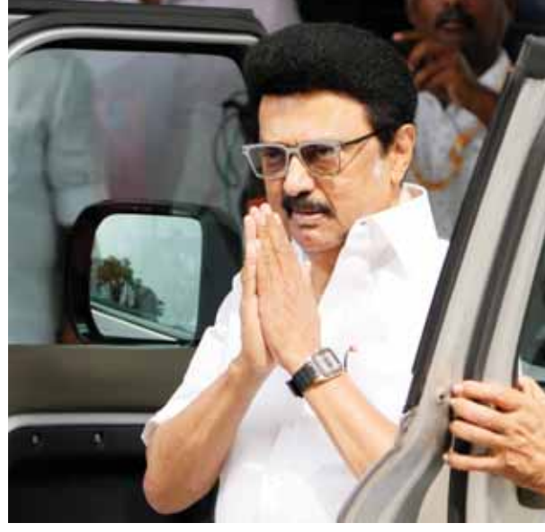
Tamil Nadu CM MK Stalin participates in all-party meeting to discuss proposed delimitation of LS seats PTI

Tamil Nadu Chief Minister MK Stalin on Wednesday alleged that the Bharatiya Janata Party (BJP)-led union government paid mere lip service to Tamil language for the sake of votes and dubbed the ruling party at the Centre as Tamil's "enemy." Writing to party workers as part of his series on the theme of "all-time opposition to Hindi imposition," Stalin recalled DMK founder leader CN Annadurai's views on the issue. Decades ago, Anna had said that the party's objective is not to oppose Hindi, but to get equal recognition to Indian languages including Tamil.