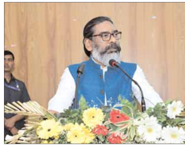
Chief Minister Hemant Soren addresses newly recruited trainee officers under the Department of Labour, Planning, Training and Skill Development during a programme in Ranchi on Wednesday.

Artificial Intelligence. Today, be it agriculture or industry or any other sector - the use of Artificial Intelligence is increasing everywhere. Now you cannot keep yourself away from Artificial Intelligence. In such a situation, our youth should move forward in the field of Artificial Intelligence, for this it needs to be included in the curriculum of ITI institutes. He also emphasized on