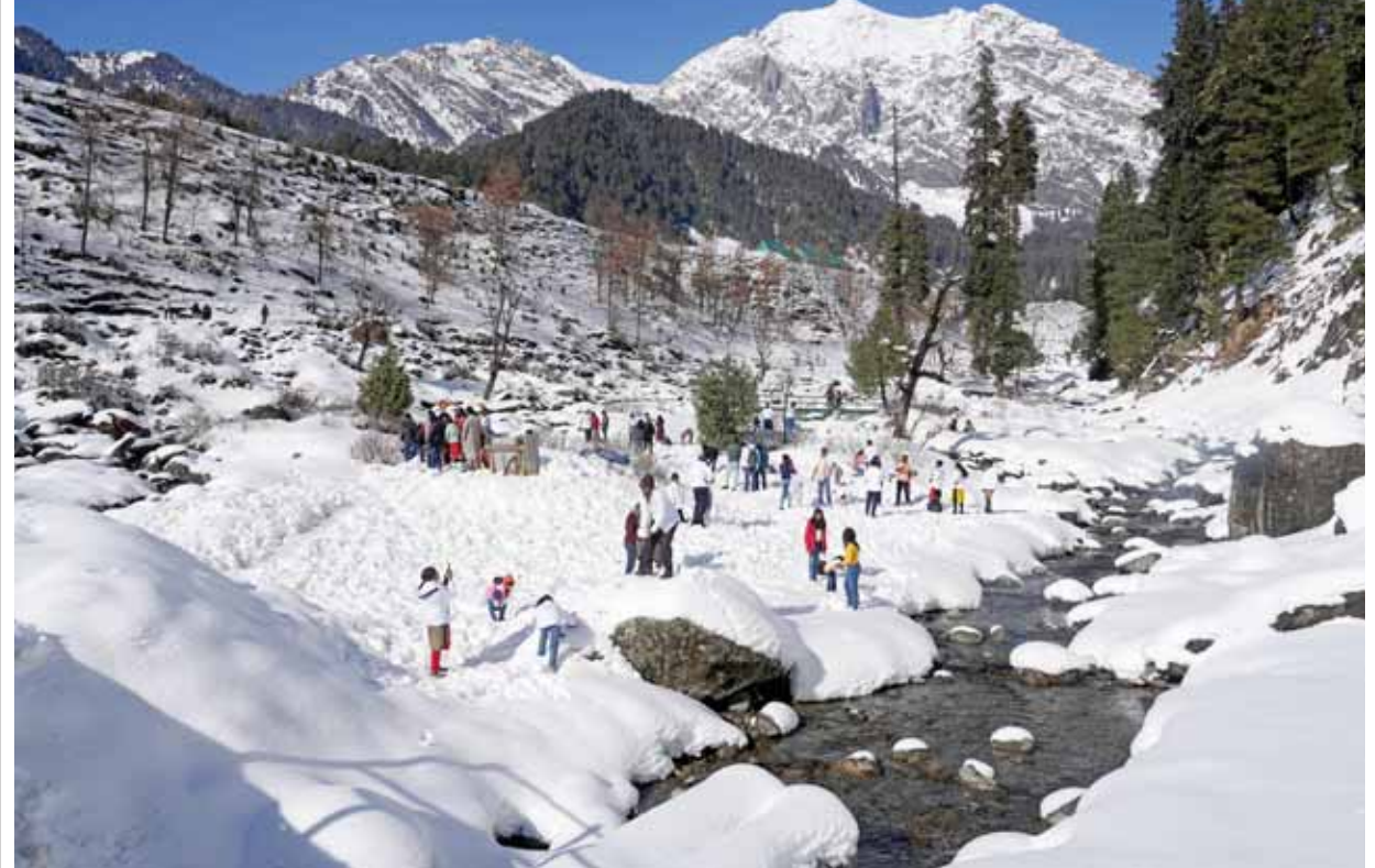
Tourists visit Pahalgam after fresh snowfall, in Anantnag district of South Kashmir.