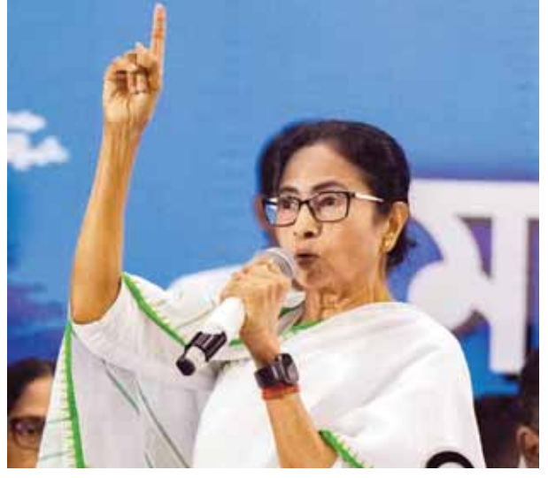
West Bengal CM Mamata Banerjee during a TMC's workers meeting