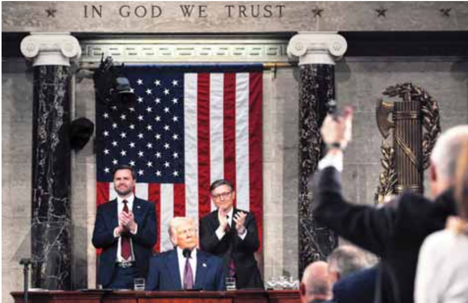
President Donald Trump addresses a joint session of Congress at the Capitol in Washington on Tuesday.

He told Congress that on Tuesday, he received an "important letter" from Zelenskyy, in which he said that "Ukraine is ready to come to the negotiating table as soon as possible to bring lasting peace closer. Nobody wants peace more than the Ukrainians," Zelenskyy wrote in the letter, Trump said. Trump said that Zelenskyy went on to write in the letter that his team and him "stand ready to work under President Trump's strong leadership to get a peace that lasts. We do really value how much America has done to help Ukraine, maintain its sovereignty and independence. Regarding the agreement on minerals and security, Ukraine is ready to sign it at any time that is convenient for you." Trump said he appreciates the letter and added that "simultaneously we've had serious discussions with Russia and I've received strong signals that they are ready for peace."