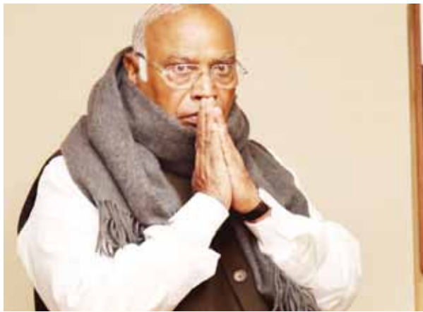
Congress President Mallikarjun Kharge

"Narendra Modi ji, you had talked about 'stealing of mangalsutras'. That has now come true. In your rule, women have been forced to mortgage their gold ornaments. First you made women's 'stri-dhan' disappear by m p l e m e n t i n g demonetisation, now due to inflation and falling household savings, they are forced to mortgage their