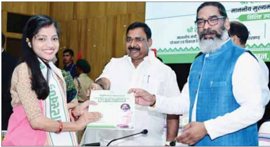
Chief Minister Hemant Soren hands over an appointment letter to newly selected 49 trainee officers under the Department of Labour, Planning, Training and Skill Development during a programme in Ranchi on Wednesday.

The CM said that there is no price for skill. Skill is priceless. If you have skill, you do not need to run for employment. Employment will come to your doorstep itself, because everyone wants to keep a skilled person with them. This is the reason why our government is taking several steps for skill development of the youth of the state. Now special emphasis is being laid on