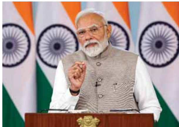
Prime Minister Narendra Modi addresses post-budget webinar on boosting job creation

Referring to an IMF report of February 2025, Modi noted that between 2015 and 2025, India grew by 66 per cent, making the country a $ 3.8 trillion economy. Observing that the country's growth surpassed that of several major economies, he said "the day is not far when