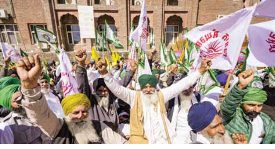
Members of Samyukta Kisan Morcha stage protest against Punjab CM Bhagwant Mann-led government in Amritsar