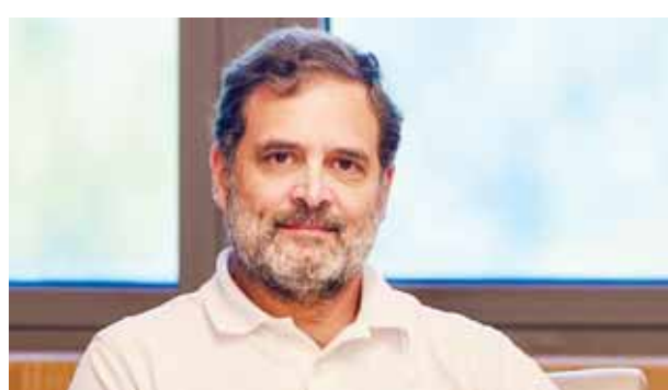
Congress leader Rahul Gandhi during a meeting in New Delhi

The former Congress president, who posted on his YouTube channel a video of his recent interaction with porters at the New Delhi railway station, asserted that he would fight for their rights. Gandhi also urged people to share suggestions on the 'Awaaz Bharat Ki' portal to improve crowd management and strengthen security. "We will listen to the voice