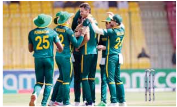
South Africa's Marco Jansen, center, celebrates with teammates after taking the wicket of England's Ben Duckett during the ICC Champions Trophy match

In his final game as England's ODI captain, Jos Buttler won the toss and chose to bat, but the decision backfired as Jansen wreaked havoc early, reducing England to 37 for 3 by the