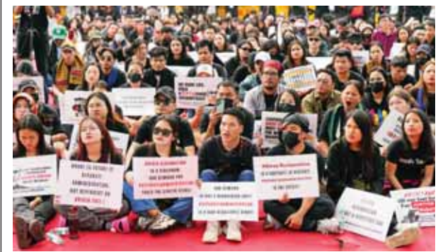
Kuki organisations protested against ongoing ethnic violence at Jantar Mantra