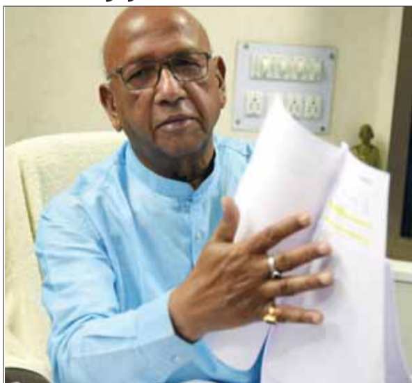
PNS : JAMSHEDPUR

The long-awaited demand of the residents of Cable Town and Cable Basti has finally been fulfilled as the Jharkhand High Court cleared the way for them to receive electricity connections from Tata Steel UISL. On Friday, the High Court delivered its verdict on a writ petition filed two years ago, allowing residents to individually apply for Tata Power connections.