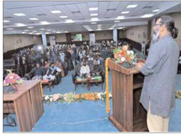
Chief Minister Hemant Soren, addresses the Orientation cum-training program organised for the members of the Sixth Jharkhand Legislative Assembly at Assembly in Ranchi on Saturday.