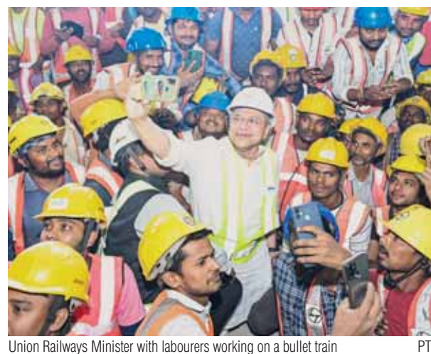
Union Railways Minister with labourers working on a bullet train

Railway Minister Ashwini Vaishnav on Saturday reviewed the progress of Ahmedabad Railway Station redevelopment and the Bullet train project at Anand in Gujarat. During a day-long visit to Gujarat, the minister went to Ahmedabad Railway Station with senior officials of the Western Railway Zone and inspected the construction work in detail. "The design and appearance of the station will reflect the culture and heritage of Ahmedabad," Vaishnav said, adding that he expects the redevelopment work to be finished in three-and-a-half years. According to the Western Railway, the redevelopment work of Ahmedabad station was awarded in November 2023 and it is targeted to be completed by June 2027. Vaishnav said several innovations have been made for the Ahmedabad railway station redevelopment project, and special care is being taken to ensure that the facility's design reflects the city's rich heritage. Vaishnav, who reviewed the redevelopment project, said architectural elements inspired by the city's heritage, such as the 'Jhulta Minar' (swaying minaret), kite festival, etc, will be incorporated into the design. He said this approach was in line with Prime Minister Narendra Modi's commitment to preserve the cultural fabric of modern India. The redevelopment is a