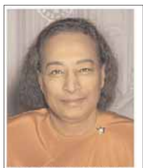
Sri Sri Paramahansa Yogananda

The two Gurus of the Kriya Yoga lineage dropped