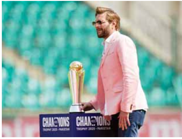
Pakistan's former cricketer Shahid Afridi displays the Champions Trophy in Karachi

The star Indian batters were focusing more on playing out Bangladesh spinners Mehidy Hasan Miraz (0/37) and Rishad Hossain (2/38) without taking risks, and they followed the same approach against Pakistan leg-spinner Abrar Ahmed (1/28). But they will come up against