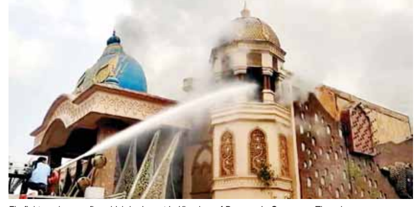
Firefighters douse a fire which broke out in Kingdom of Dreams, in Gurugram, Thursday