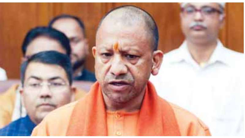
UP CM Yogi Adityanath

Adityanath emphasised that festivals bring greater joy when celebrated with mutual respect and urged people not to forcibly apply colours on others, especially those who are unwell.