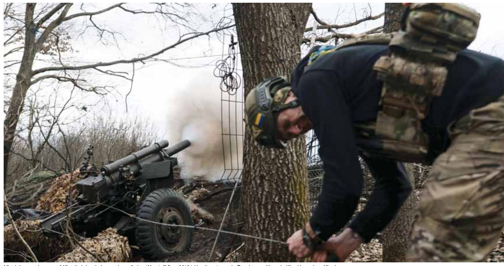
Ukrainian serviceman of Khartia brigade known by call sign "Krystal" fires M101 Howitzer towards Russian positions in Kharkiv region, Ukraine