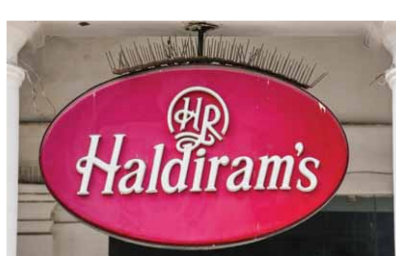
Temasek, Singapore's sovereign investment firm, is acquiring a minority 10 per cent stake in Haldiram Snacks Food: