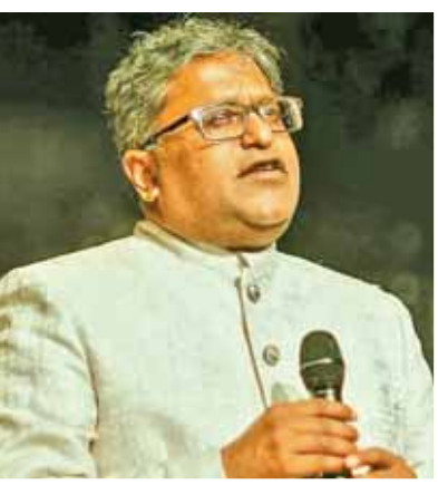
PIONEER NEWS SERVICE/AGENCIES ■ New Delhi/Port Vila