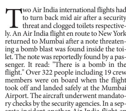
PIONEER NEWS SERVICE/AGENCIES ■ New Delhi