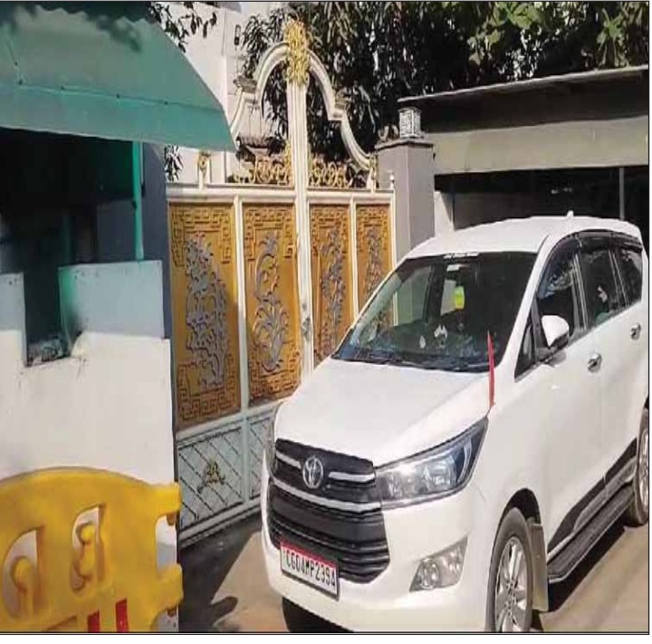
SPECIAL CORRESPONDENT BHILAI