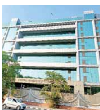
A day earlier in a massive crackdown the CBI arrested 26 railway officials, including a senior divisional electrical engineer of East Central Railway for allegedly leaking papers of a departmental examination and seized ₹1.17 crore cash during its raids. The railway officials were arrested on Monday night for allegedly leaking papers of

DEEPAK KUMAR JHA ■ NEW DELHI After several rail officials were nabbed in a Central Bureau of Investigation (CBI) trap pertaining to cases related to jobs, promotions in the Indian Railway networks, the Railway Board in a high level meeting on Wednesday decided that all departmental promotion examinations for the 13 Lakh rail employees will be done by the Railway Recruitment Board (RRB) via centralised examination through Computer Based Test (CBT) aptitude. Sources in the railways said all zonal railways will have to prepare a calendar for the examination and all examinations will be conducted on the basis of a calendar only. "This has been decided after a long experience of transparent, fair, and highly appreciated examinations conducted by RRB in recent years," sources said.