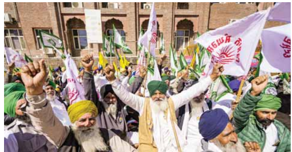
Members of Samyukta Kisan Morcha stage protest against Punjab CM Bhagwant Mann-led government in Amritsar