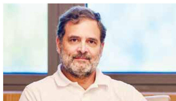
Congress leader Rahul Gandhi during a meeting in New Delhi

Drawing attention to the financial difficulties faced by railway porters, Congress leader Rahul Gandhi on Wednesday said they risked their lives to help people during the stampede at the New Delhi Railway Station last month and yet their voice was not being heard. The former Congress president, who posted on his YouTube channel a video of his recent interaction with porters at the New Delhi railway station, asserted that he would fight for their rights. Gandhi also urged people to share suggestions on the 'Awaaz Bharat Ki' portal to improve crowd management and strengthen security. "We will listen to the voice