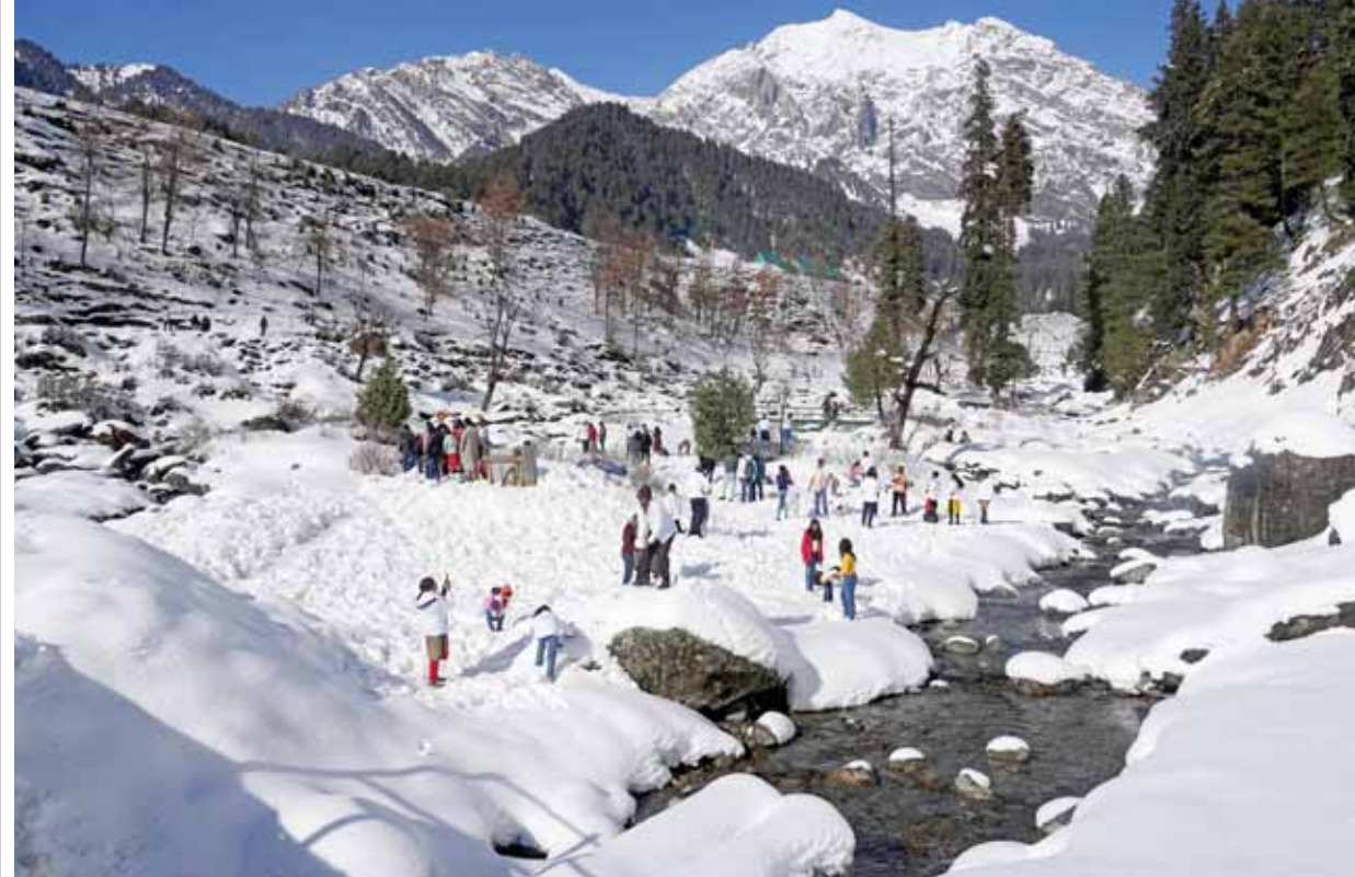
Tourists visit Pahalgam after fresh snowfall, in Anantnag district of South Kashmir