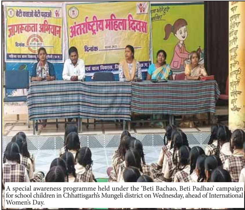
A special awareness programme held under the 'Beti Bachao, Beti Padhao' campaign for school children in Chhattisgarh's Mungeli district on Wednesday, ahead of International Women's Day.

It is worthwhile to mention here that the Ayushman Bharat health insurance scheme provides a health cover of Rs 5 lakhs per family per year.