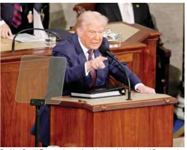
President Donald Trump gestures as he addresses a joint session of Congress at the Capitol in Washington

product in America, however, under the Trump administration, you will pay a tariff and in some cases, a rather large one," Trump said. "Other countries have used tariffs against us for decades and now it's our turn to start using them against those other countries. On average, the European Union, China, Brazil, India, Mexico and Canada - have you heard of them? And countless other nations charge us tremendously higher tariffs than we charge them," Trump said. "It's very unfair. India charges us auto tariffs higher than 100 per cent." In February, President