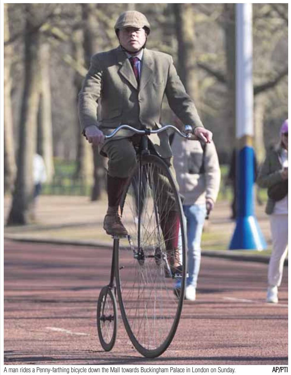
A man rides a Penny-farthing bicycle down the Mall towards Buckingham Palace in London on Sunday.

The NPC would meet along with the advisory body, the Chinese People's Political Consultative Conference (CPPCC), to deliberate on the state of the economy and the country's strategic challenges arising out of US President Donald Trump starting a second stint in power. Trump said he planned to slap new 10 per cent tariffs on goods from China, escalating trade fights with Beijing. Already, Chinese goods were hit by 10 per cent tariffs by Trump earlier this month. During his election campaign, he threatened to slap 60 per cent tariffs on Chinese goods to address US concerns over fentanyl, a potent opioid drug blamed for widespread drug addiction in the US.