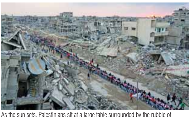
As the sun sets, Palestinians sit at a large table surrounded by the rubble of destroyed homes and buildings as they gather for iftar, the fast-breaking meal, on the first day of Ramazan in Rafah, southern Gaza strip.