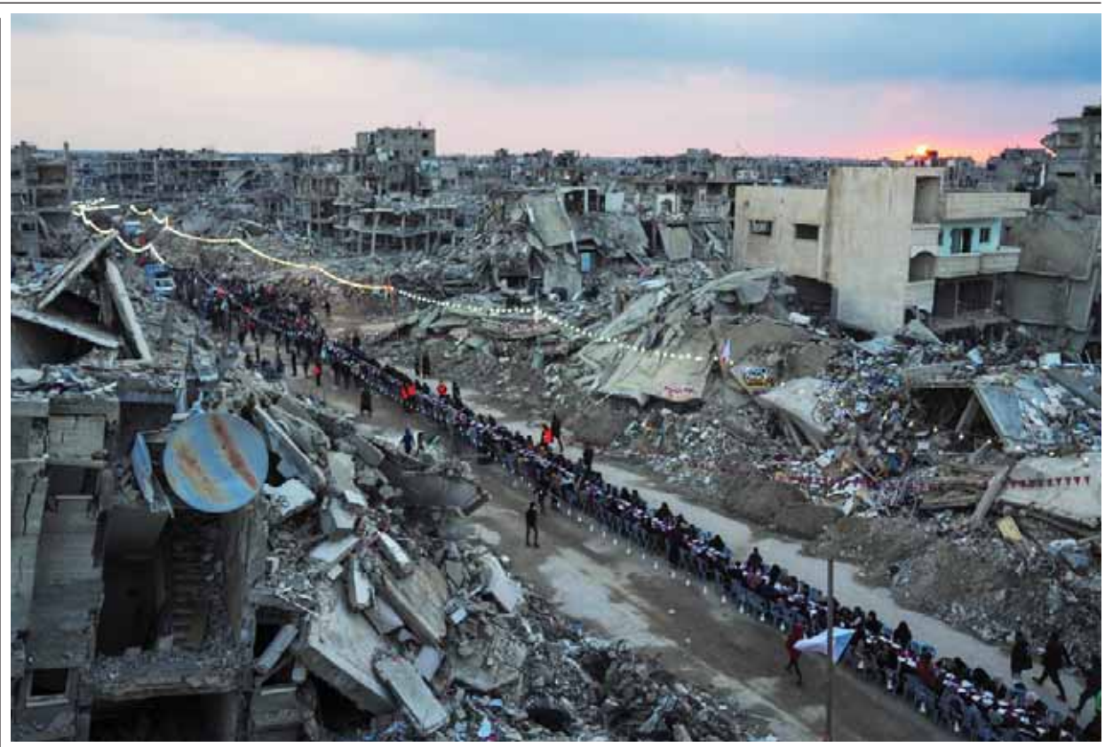
As the sun sets, Palestinians sit at a large table surrounded by the rubble of destroyed homes and buildings as they gather for iftar, the fast-breaking meal, on the first day of Ramadan in Rafah, southern Gaza Strip.