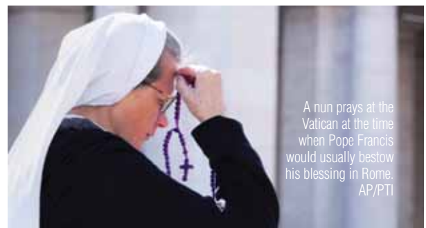
A nun prays at the Vatican at the time when Pope Francis would usually bestow his blessing in Rome.

A stable Pope Francis had a visit Sunday from the Vatican secretary of state as he continued his recovery from double pneumonia, the Vatican said, but again skipped his weekly noon blessing to avoid even a brief public appearance from the hospital. Instead, the Vatican distributed a message from the pope in which he thanked his doctors for their care and well-wishers for their prayers, and prayed again for peace in Ukraine and elsewhere. "From here, war appears even more absurd," Francis said in the message, which he drafted in recent days from the Gemelli hospital, the Vatican said. Francis said he was living his hospitalization as an experience of profound solidarity with people who are sick and suffering everywhere. "I feel in my heart the blessing that is hidden within frailty, because it is precisely in these moments that we learn even more to trust in the Lord," Francis said in the text. "At the same time, I thank God for giving me the opportunity to share in body and spirit the condition of so many sick and suffering people." Signs point to a recovery: It marked the third weekend in a row that Francis has cancelled