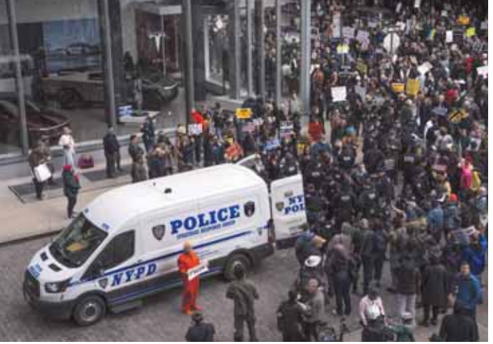
Demonstrators are arrested by NYPD officers during a protest against Elon Musk and Tesla outside of a Tesla showroom in New York.