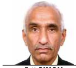
B K SINGH

Despite its noble intent to secure the livelihoods of tribals, the Forest Rights Act has inadvertently opened the door to rampant deforestation and widespread encroachment