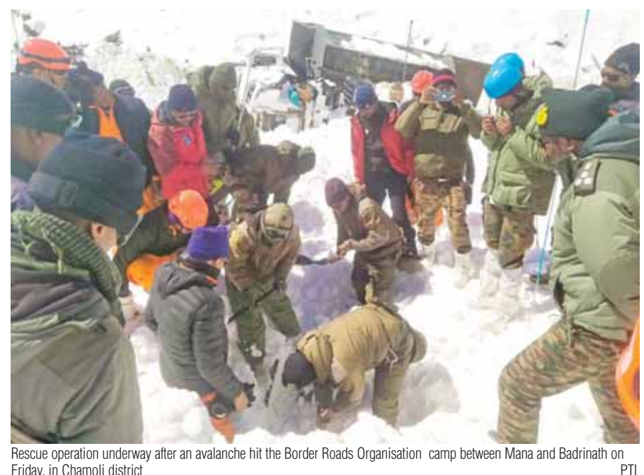
Rescue operation underway after an avalanche hit the Border Roads Organisation camp between Mana and Badrinath on Friday, in Chamoli district.