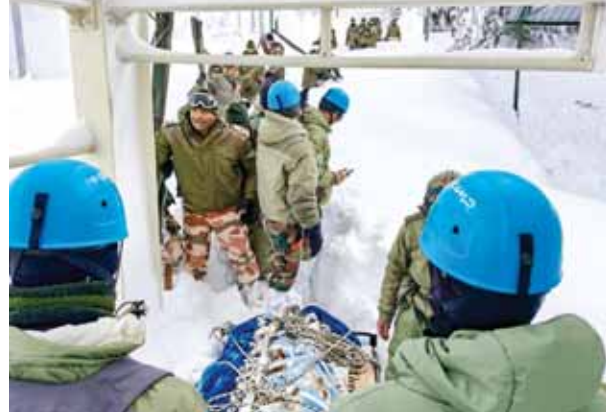
Rescue operation underway after several labourers got trapped under snow following an avalanche in Mana area of Chamoli district, Uttarakhand

PIONEER NEWS SERVICE ■ DEHRADUN/NEW DELHI War footing rescue operations helped the Indian Army rescue 50 workers out of snow brought in by an avalanche at a Border Roads Organisation (BRO) camp in the high-altitude Mana village in Uttarakhand's Chamoli district, but unfortunately four of them died on Saturday. Six helicopters, including three of the Indian Army Aviation, two of the Indian Air Force and one civil copter hired by the Army, were engaged in the rescue operations, an Army spokesperson said. Thirty-three were rescued by Friday night. Avalanche hit the BRO camp between Mana and Badrinath between 5:30 am and 6 am on Friday, burying 55 workers inside eight containers and a shed, according to the Army. "Fifty labourers have been rescued out of which, unfortunately, four injured have been confirmed as fatal casualties while the search for the remaining five is underway," the Army spokesperson said. The injured were being prioritised for evacuation, he said. Uttarakhand Chief Minister Pushkar Singh Dhami conducted an aerial survey of the affected area and directed officials to speed up the rescue operation. Prime Minister Narendra Modi spoke to Dhami and assured him of full support. District Disaster Management Officer NK Joshi said Army and Indo-Tibetan Border