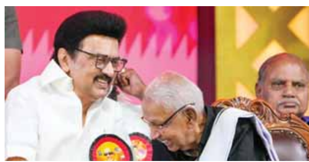
DMK President, Chief Minister MK Stalin with INDIA block leaders during a public meeting organised on the eve of his birthday in Chennai

Tamil Nadu Chief Minister MK Stalin on Saturday turned 72 and the DMK President underlined his commitment to state autonomy, two-language policy and opposition to Hindi imposition as his birthday message. Stalin, who cut a cake with his family members and party workers, administered to cadres an oath of "one goal" which is to protect the interests of Tamil Nadu and oppose Hindi imposition at all times to come. "Tamil Nadu poradum, Tamil Nadu Vellum," (Tamil Nadu will fight, Tamil Nadu will win) Stalin said, which was repeated by party workers. "Anna Arivalayam," the DMK headquarters here wore a festive look as party cadres and office-bearers turned up in large numbers to greet their party chief. "Dravida Nayagar," (Dravidian Hero) was among the phrases used by DMK workers and supporters to greet