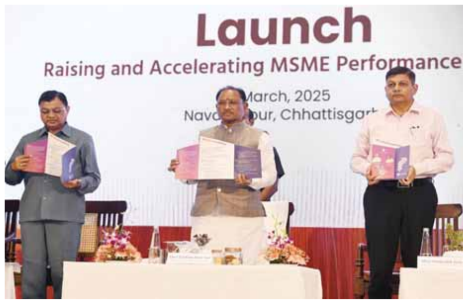
it is guessed.

Sai distributed letters proposing 'invitation to invest' to 16 investors. On auspices of this workshop, the state will receive investments amounting to Rs 11,733 crore and approximately 9,000 youths will get employment,