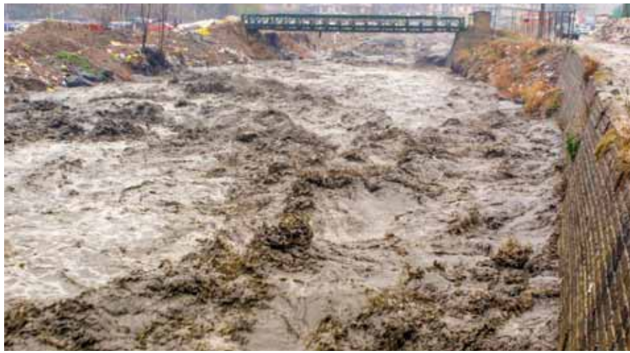
The Sarvari river flows in spate after heavy rains in Kullu on Friday

Heavy rains and snowfall disrupted normal life in several parts of Himachal Pradesh triggering landslides, blocking roads and huge mounds of debris swept by gushing waters damaging vehicles in Kullu. A massive landslide triggered by incessant rains and cloudbursts at Rokaru (Multhan) in Kangra district damaged several vehicles and endangered 12 houses. The affected families have been relocated to safer places and restoration works are in progress, said Kangra Deputy Commissioner, Hem Raj. One person was reported missing near Shiva Hydropower project in Palampur and search operations have been launched to trace him, officials said on Saturday. Tribal Pangi valley in Chamba was cut off following heavy snowfall and electricity and