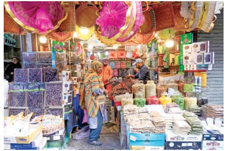
Residents buy dry fruits from a shop ahead of the holy month of Ramadan in Srinagar