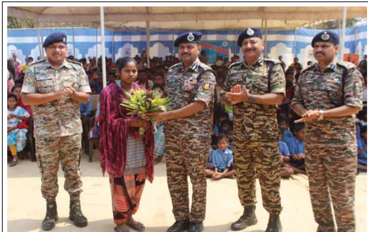
A glimpse of the Central Reserve Police Force civic action program in Chhattisgarh tribal-dominated Bijapur district on Saturday. The CRPF personnel provide aid to villagers, educational materials to children and sports materials to the youth.