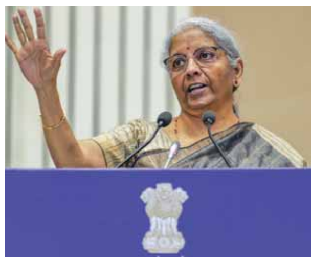
Finance Minister Nirmala Sitharaman addresses 49th Civil Accounts Day celebrations in New Delhi

She said that since a lot of digital integration has already taken place with the states, more research can be carried out based on the data set available with the CGA. "If you're able to make the report a lot more user-friendly, that itself can generate a lot of interest in the work that you do," the minister said. Sitharaman also asked both the Department of Expenditure and the CGA to ensure that the SNA-SPARSH is smoothly rolled out for all schemes in the upcoming financial year. "CGA should handhold states in seamless onboarding and transition to SNA-SPARSH and convince them about the benefits of this reform for quick adoption," she said, while suggesting to CGA officers to engage more with your counterparts in the states, take their input and encourage them to adopt the system. PFMS, which is developed and implemented by the Controller General of Accounts (CGA) under the Department of Expenditure, provides an IT platform and ensures end-to-end digital payments, collection of receipts, accounting.