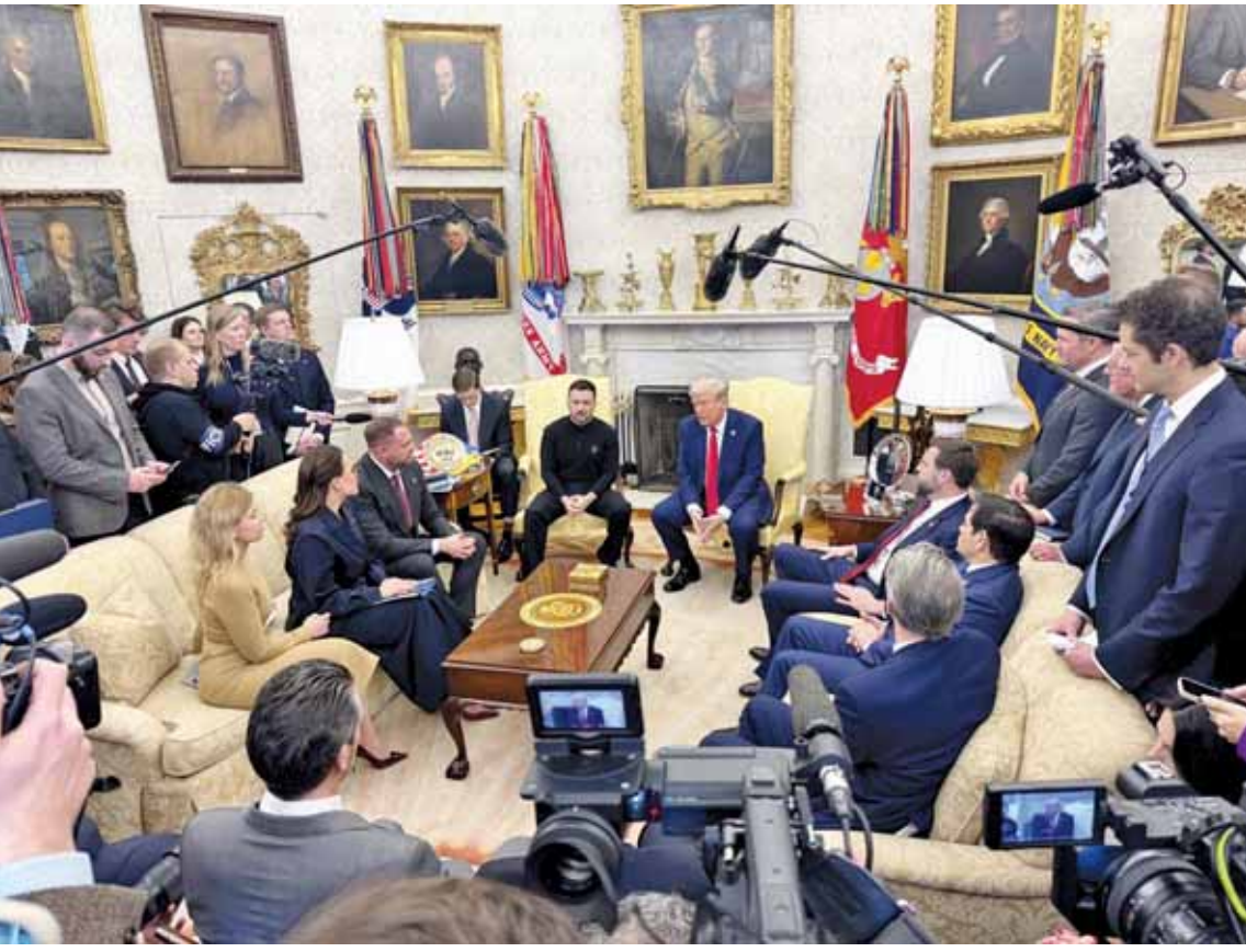
President Donald Trumps meets Ukraine President Volodymyr Zelenskyy in the Oval Office at the White House in Washington

PTI ■ NEW YORK Ukraine's European partners as well as other global leaders rallied behind President Volodymyr Zelenskyy while the White House touted support for President Donald Trump's 'American First strength' after a remarkable showdown in the Oval Office between the two leaders. Zelenskyy departed the White House on Friday after an unprecedented verbal clash in the Oval Office between him and Trump and Vice President JD Vance.