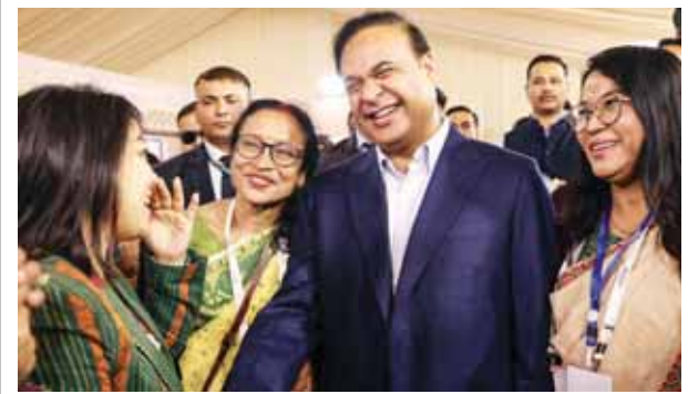
Assam Chief Minister Himanta Biswa Sarma