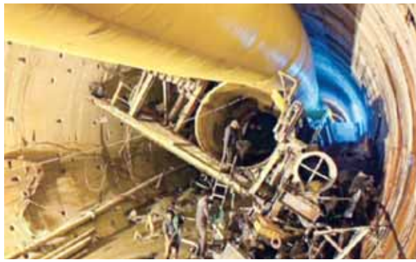
Rescue operation underway to trace workers trapped inside the partially collapsed Telangana's SLBC tunnel in Nagarkurnool, Telangana on Saturday