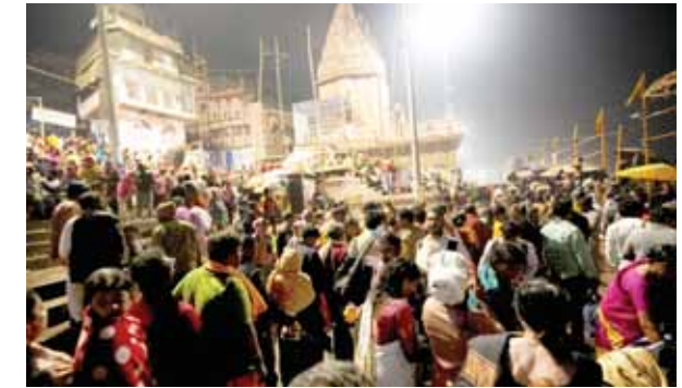
Devotees wait outside the Kashi Vishwanath temple