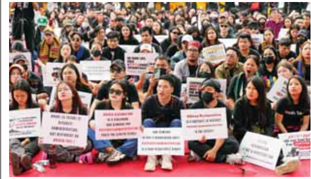
Kuki organisations protested against ongoing ethnic violence at Jantar Mantra