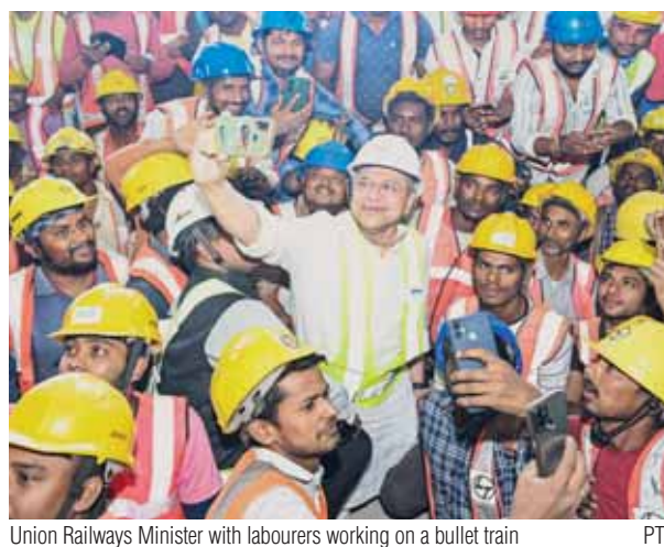
Union Railways Minister with labourers working on a bullet train

Railway Minister Ashwini Vaishnav on Saturday reviewed the progress of Ahmedabad Railway Station redevelopment and the Bullet train project at Anand in Gujarat. During a day-long visit to Gujarat, the minister went to Ahmedabad Railway Station with senior officials of the Western Railway Zone and inspected the construction work in detail. "The design and appearance of the station will reflect the culture and heritage of Ahmedabad," Vaishnav said, adding that he expects the redevelopment work to be finished in three-and-a-half years. According to the Western Railway, the redevelopment work of Ahmedabad station was awarded in November 2023 and it is targeted to be completed by June 2027. Vaishnav said several innovations have been made for the Ahmedabad railway station redevelopment project, and special care is being taken to ensure that the facility's design reflects the city's rich heritage. Vaishnav, who reviewed the redevelopment project, said architectural elements inspired by the city's heritage, such as the 'Jhulta Minar' (swaying minaret), kite festival, etc, will be incorporated into the design. He said this approach was in line with Prime Minister Narendra Modi's commitment to preserve the cultural fabric of modern India. The redevelopment is a