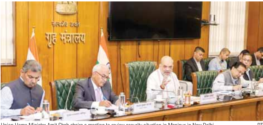
Union Home Minister Amit Shah chairs a meeting to review security situation in Manipur in New Delhi

PIONEER NEWS SERVICE ■ NEW DELHI Union Home Minister Amit Shah on Saturday directed security forces to ensure free movement of people on all routes in Manipur from March 8 and surrender of arms from rebel outfits. He also called for strict action against those creating obstructions. Home Minister was chairing a meeting, first time after the imposition of President's rule to review the security situation of Manipur, which has been witnessing ethnic violence since May 2023. Over 250 people have lost their lives in the violence. The Home Minister directed that free movement of people should be ensured on all roads of Manipur from March 8,