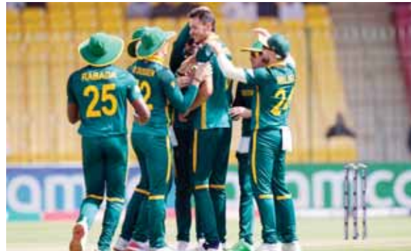
South Africa's Marco Jansen, center, celebrates with teammates after taking the wicket of England's Ben Duckett during the ICC Champions Trophy match

In his final game as England's ODI captain, Jos Buttler won the toss and chose to bat, but the decision backfired as Jansen wreaked havoc early, reducing England to 37 for 3 by the