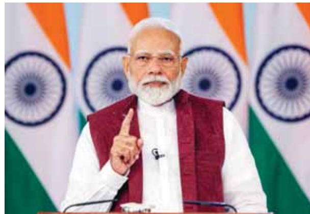
Prime Minister Narendra Modi addresses post-budget webinar on agriculture and rural prosperity in Delhi

The Prime Minister highlighted record achievements in the agriculture sector, noting that foodgrain production has increased from 265 Million Tonnes a decade ago to over 330 Million Tonnes currently. Similarly, horticulture production has grown to exceed 350 Million Tonnes. Modi specifically mentioned the PM Dhan Dhanya Krishi Yojana, describing it as "a very important scheme" for him. The initiative will focus on 100 districts with low crop yields, following the successful model of aspirational districts. "We have announced the setting up of a Makhana Board in Bihar. I urge all