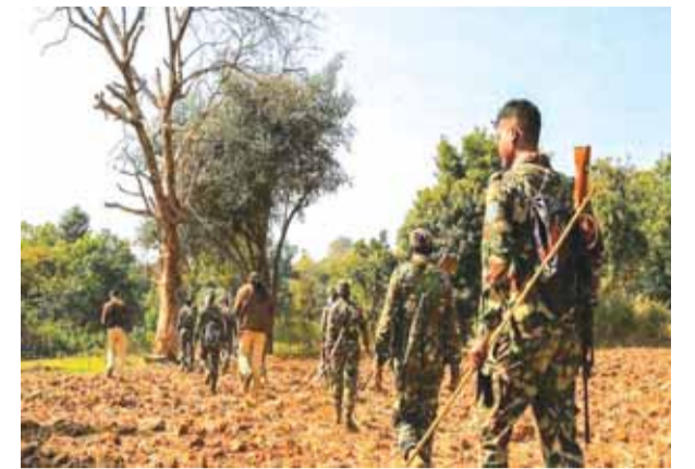
of Maoists in the area, Chavan added.

The District Reserve Guard (DRG) and Commando Battalion of Resolute Action (COBRA), an elite unit of Central Reserve Police Force (CRPF) were involved in the operation launched on Friday based on the inputs about the presence