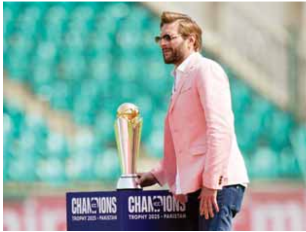
Pakistan's former cricketer Shahid Afridi displays the Champions Trophy in Karachi

The star Indian batters were focusing more on playing out Bangladesh spinners Mehidy Hasan Miraz (0/37) and Rishad Hossain (2/38) without taking risks, and they followed the same approach against Pakistan leg-spinner Abrar Ahmed (1/28). But they will come up against