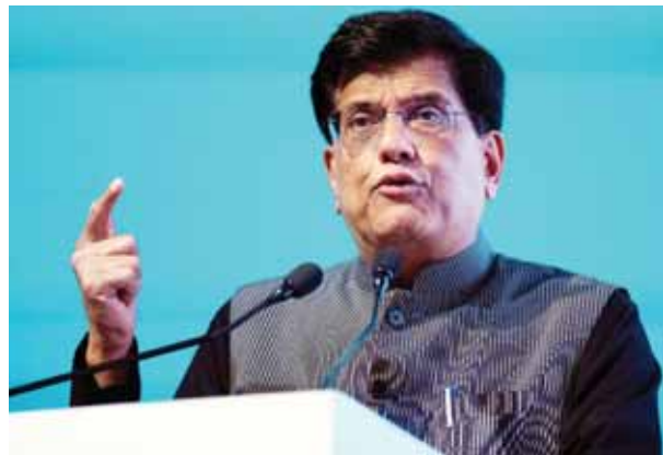
Union Minister Piyush Goyal speaks during AMFI Mutual Fund Summit

With India and the European Union (EU) setting the year-end deadline to conclude a free trade agreement, teams from both sides held discussions on Saturday to accelerate efforts towards a balanced and mutually beneficial pact. The meeting was held between Commerce and Industry Minister Piyush Goyal and EU Commissioner for Trade and Economic Security Maros Sefcovic in Mumbai along with officials from both sides. "Our discussions focused on accelerating efforts towards a balanced and mutually beneficial free trade agreement. Looking forward to deepening economic ties and fostering a prosperous India-EU partnership," Goyal said in a post on X. On February 28, Prime Minister Narendra Modi and European Commission President Ursula von der Leyen agreed to seal a much-awaited free trade deal by this year amid rising concerns over Unites States President Donald Trump's policy on tariffs. The two sides are scheduled to hold the tenth round of negotiations for the FTA from March 10-14 in Brussels. Further strengthening of economic ties between the two is crucial in light of the threat from US President Donald Trump to impose higher tariffs. In the current uncertain global economic situation, India is the fastest-