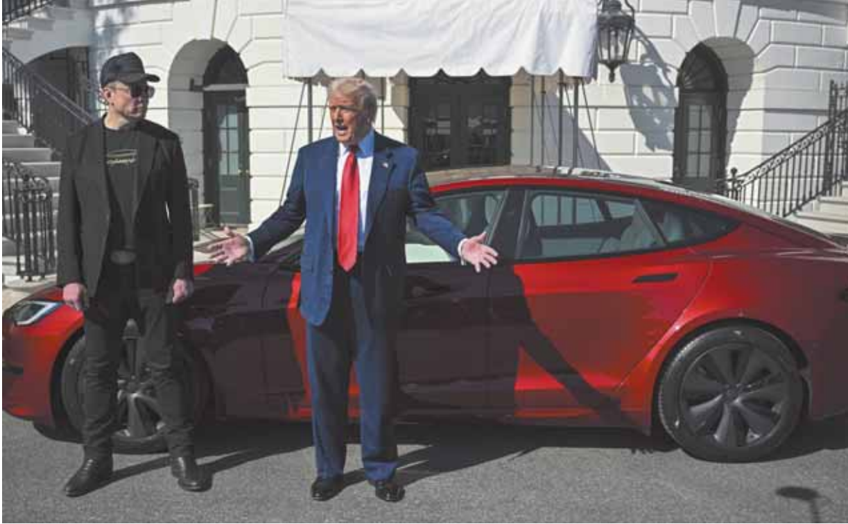
President Donald Trump and Tesla CEO Elon Musk speak to reporters near a red Model S Tesla vehicle on the South Lawn of the White House in Washington.

posed taking an even bigger first step—a 30-day full interim ceasefire, not only stopping missile, drone, and bomb attacks, not only in the Black Sea, but also along the entire front line," the Ukrainian president said in a video, text for which was posted on his official X handle too.