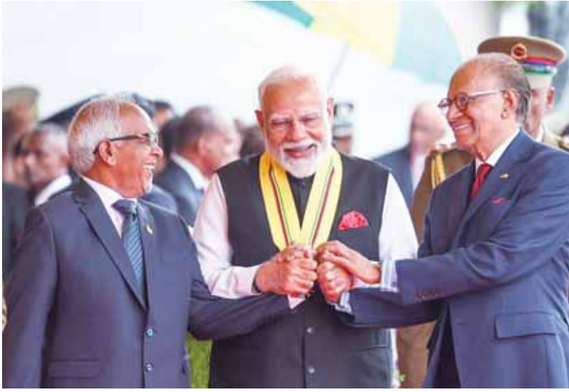
PM Modi after being conferred highest civilian award of Mauritius

The officials cited several instances of Modi being the main guest at signature events of several countries to assert that the prime minister as a "global leader is