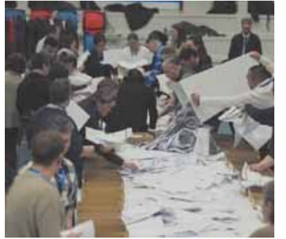
Electoral workers prepare to count votes during parliamentary elections in Nuuk, Greenland.

Greenland, a self-governing region of Denmark, straddles strategic air and sea routes in the North Atlantic and has rich deposits of the rare earth minerals needed to make everything from mobile