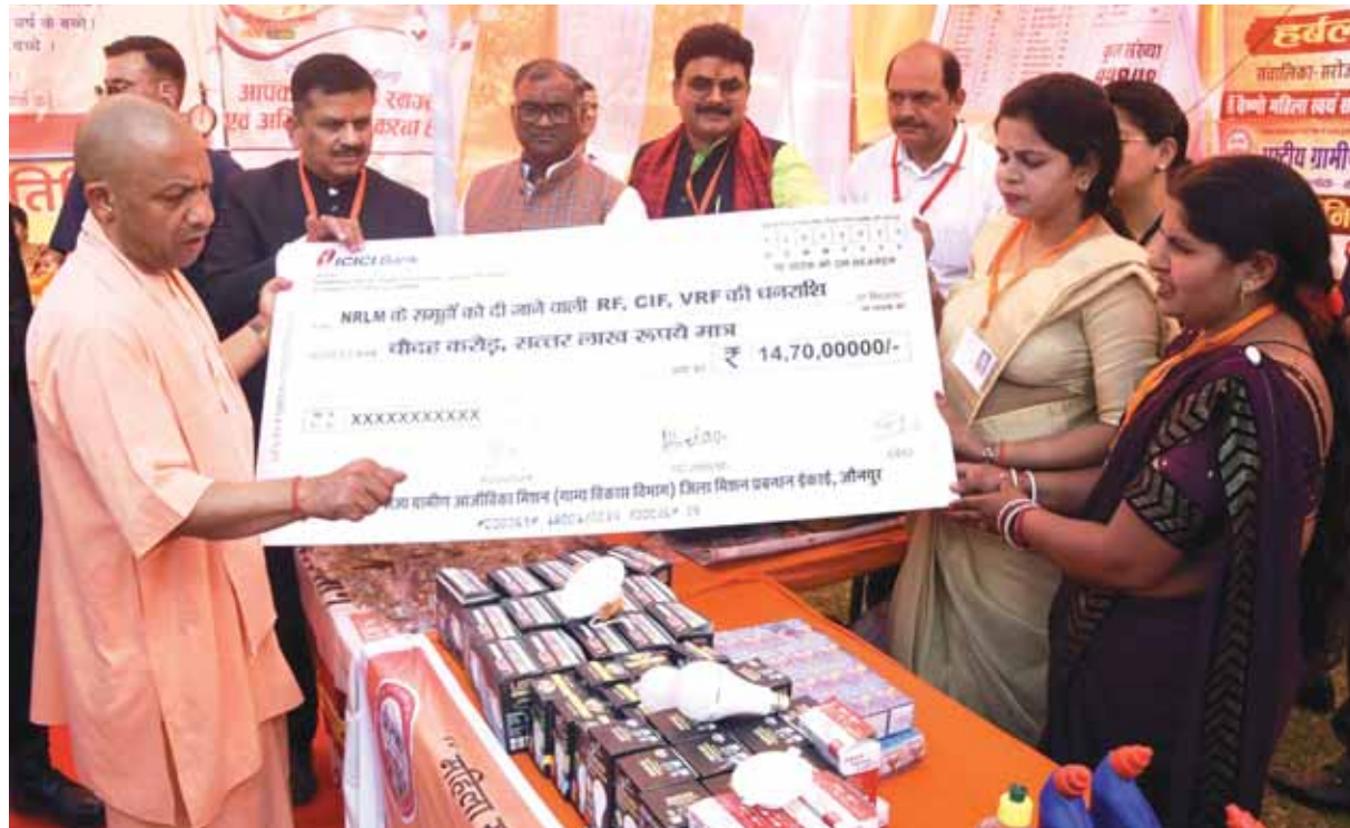
Uttar Pradesh Chief Minister Yogi Adityanath honours the participating artists of the 'Jaunpur Mahotsav' in Jaunpur district of UP.