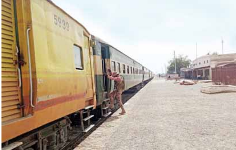
A paramilitary soldier takes position at a railway station near the attack site of a passenger train by insurgents in Mushkaf in Bolan district of Pakistan's southwestern Balochistan province. PTI

This is the first time the BLA or any insurgent group in the Balochistan province have resorted to hijacking a passenger train, although in the last year, they have stepped up their attacks on securi-