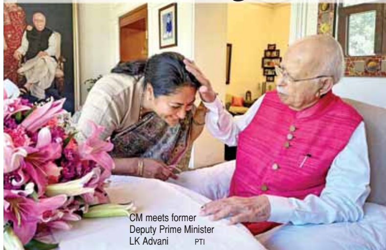
CM meets former Deputy Prime Minister LK Advani.