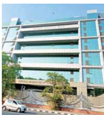
A day earlier in a massive crackdown the CBI arrested 26 railway officials, including a senior divisional electrical engineer of East Central Railway for allegedly leaking papers of a departmental examination and seized ₹1.17 crore cash during its raids. The railway officials were arrested on Monday night for allegedly leaking papers of

After several rail officials were nabbed in a Central Bureau of Investigation (CBI) trap pertaining to cases related to jobs, promotions in the Indian Railway networks, the Railway Board in a high level meeting on Wednesday decided that all departmental promotion examinations for the 13 Lakh rail employees will be done by the Railway Recruitment Board (RRB) via centralised examination through Computer Based Test (CBT) aptitude. Sources in the railways said all zonal railways will have to prepare a calendar for the examination and all examinations will be conducted on the basis of a calendar only. "This has been decided after a long experience of transparent, fair, and highly appreciated examinations conducted by RRB in recent years," sources said. Continued on page 8