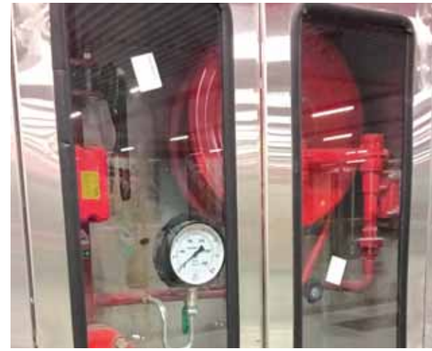
Kanpur Metro completes installation of fire safety system at all five underground stations from Motijheel to Kanpur Central.

Before launching passenger services from Motijheel to Kanpur Central, it is essential to meet all fire safety regulations and standards. With this in mind, fire-fighting systems, including fire pumps, hydrants, hose reels and other essential equipment, have been fully installed in the underground section between Chunniganj and Kanpur Central, ensuring readiness for any emergency. In recognition of these comprehensive fire safety measures, Uttar Pradesh Fire Services has recently issued No Objection Certificates (NOCs) for all five stations. Prior to granting the NOCs, the fire services conducted a thorough inspection