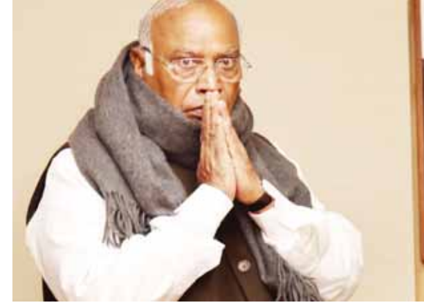
Congress President Mallikarjun Kcharge

Congress President Mallikarjun Kcharge on Wednesday attacked Prime Minister Narendra Modi over rise in gold loans and said his remarks during the Lok Sabha polls campaign about 'stealing of mangalsutras' have come true with women forced to mortgage their gold ornaments under his rule. Citing media reports, Kcharge claimed that between 2019 and 2024, four crore women mortgaged their gold and took a loan of ₹4.7 Lakh Crore. In 2024, 38 per cent of the total loans taken by women are from gold loans, he said. In February 2025, RBI data showed that gold loans increased by a whopping 71.3 per cent in a year, the Congress chief said. "Narendra Modi ji, you had talked about 'stealing of mangalsutras'. That has now come true. In your rule, women have been forced to mortgage their gold ornaments. First you made women's 'stri-dhan' disappear by i m p l e m e n t i n g demonetisation, now due to inflation and falling household savings, they are forced to mortgage their