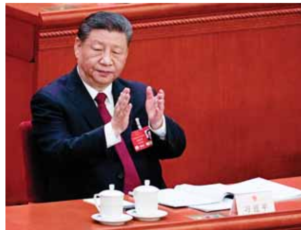
Chinese President Xi Jinping applauds during the opening session of the National People's Congress (NPC) at the Great Hall of the People in Beijing, China.

China on Wednesday announced a 7.2 per cent increase of its national defence budget totalling to $249 billion this year amid its hectic efforts to modernise armed forces, including fast paced development of warships and new generation fighter jets. The planned defence expenditure for the country is 1.784665 Trillion yuan (about $249 billion) this year, according to a draft budget report submitted to China's Parliament by Premier Li Qiang, state-run Xinhua news agency reported. Last year, China increased its defence budget by 7.2 per cent to about $232 Billion (1.67 Trillion yuan). China has the world's second-largest military budget after the US whose latest defence spending amounted to over $890 Billion as proposed by President Donald Trump. The Chinese defence spending is amounted to