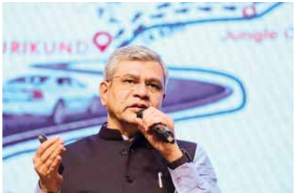
Union Minister Ashwini Vaishnaw briefs on union cabinet decisions

"A decision related to livestock health has been taken in the Cabinet. High-quality medicines will be provided under the Pashu Aushadhi component of the scheme," I and B Minister Ashwini Vaishnaw said after the Union Cabinet meeting chaired by Prime Minister Narendra Modi in New Delhi.