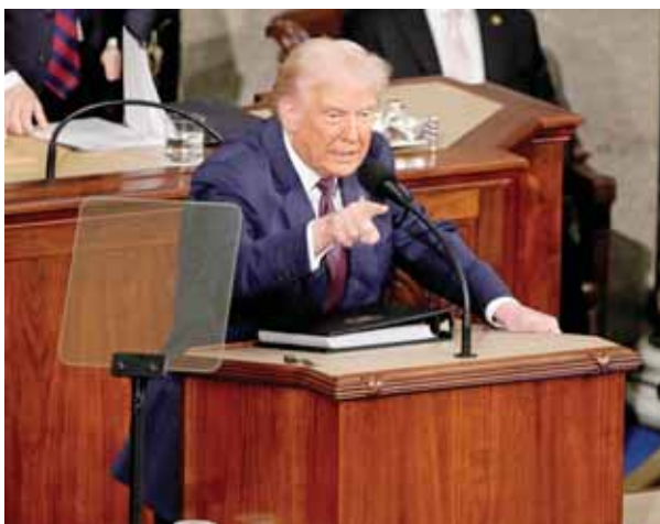
President Donald Trump gestures as he addresses a joint session of Congress at the Capitol in Washington.

product in America, however, under the Trump administration, you will pay a tariff and in some cases, a rather large one," Trump said. "Other countries have used tariffs against us for decades and now it's our turn to start using them against those other countries. On average, the European Union, China, Brazil, India, Mexico and Canada - have you heard of them? And countless other nations charge us tremendously higher tariffs than we charge them," Trump said. "It's very unfair. India charges us auto tariffs higher than 100 per cent." In February, President