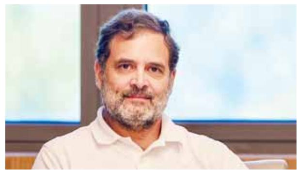
Congress leader Rahul Gandhi during a meeting in New Delhi

Drawing attention to the financial difficulties faced by railway porters, Congress leader Rahul Gandhi on Wednesday said they risked their lives to help people during the stampede at the New Delhi Railway Station last month and yet their voice was not being heard. The former Congress president, who posted on his YouTube channel a video of his recent interaction with porters at the New Delhi railway station, asserted that he would fight for their rights. Gandhi also urged people to share suggestions on the 'Awaz Bharat Ki' portal to improve crowd management and strengthen security. "We will listen to the voice