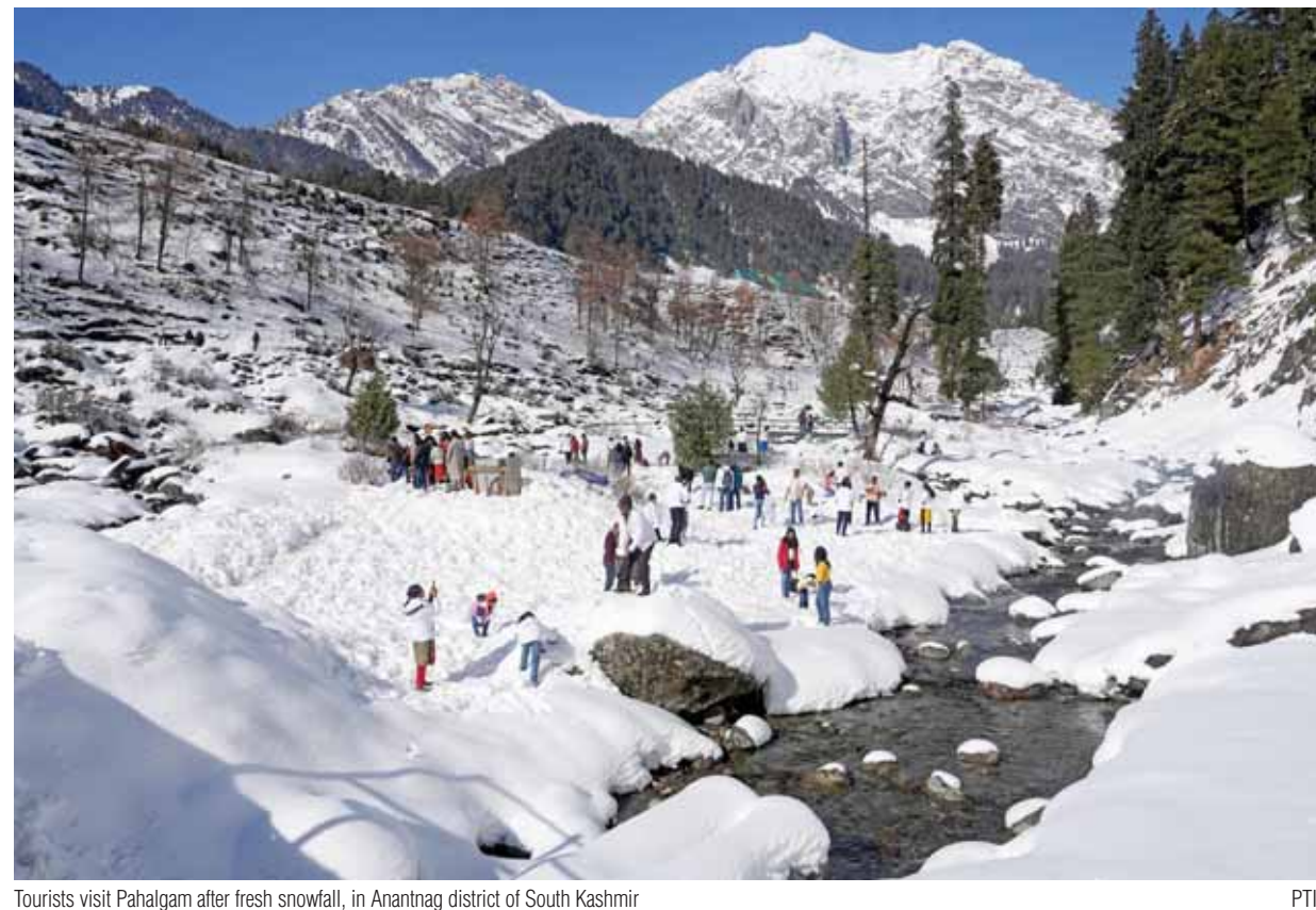
Tourists visit Pahalgam after fresh snowfall, in Anantnag district of South Kashmir.