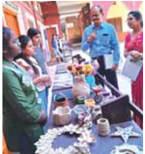
The Start-up Mela organised at Christ Church College on Wednesday.