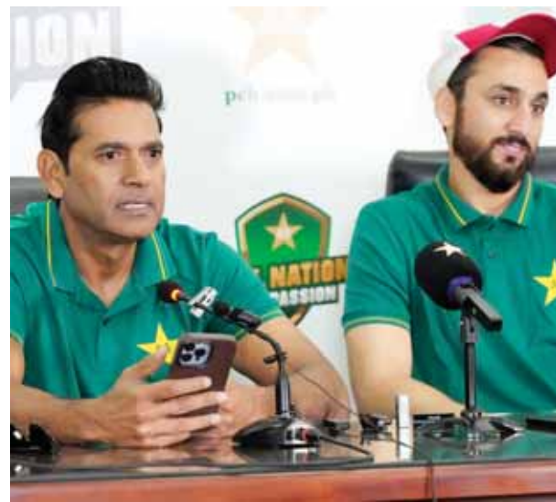
Pakistan interim head coach Aaqib Javed, left, speaks as Salman Ali Agha watches during a press conference in Lahore

Aaqib, a senior selector, was then asked to take over as interim head coach of the white ball squad and then also the red ball team for the Test series in South Africa and against West Indies at home.