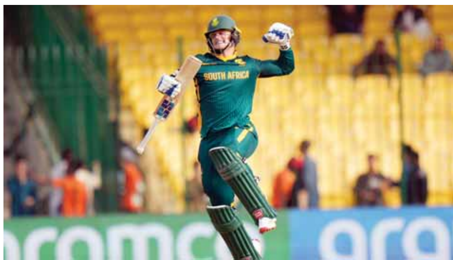
South Africa's Ryan Rickelton celebrates after scoring century during the ICC Champions Trophy cricket match

T20: Salman Ali Agha (captain), Shadab Khan (VC), Abdul Samad, Abrar Ahmed, Haris Rauf, Hasan Nawaz, Jahandad Khan, Khushdil Shah, Muhammad Abbas Afridi, Muhammad Ali, Muhammad Haris, Muhammad Irfan Khan, Omaid Bin Yousuf, Shaheen Shah Afridi, Sufyan Muqeem, Usman Khan.