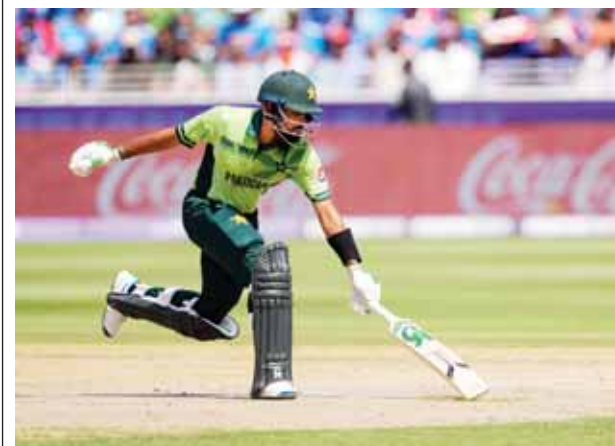
Babar Azam plays a shot during the Champions Trophy 2025 cricket match