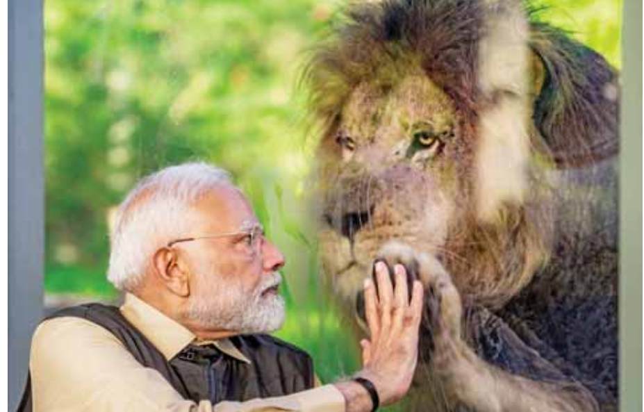
PM Narendra Modi looks at a lion through a glass partition during the inauguration of 'Vantara' in Jamnagar, Gujarat.