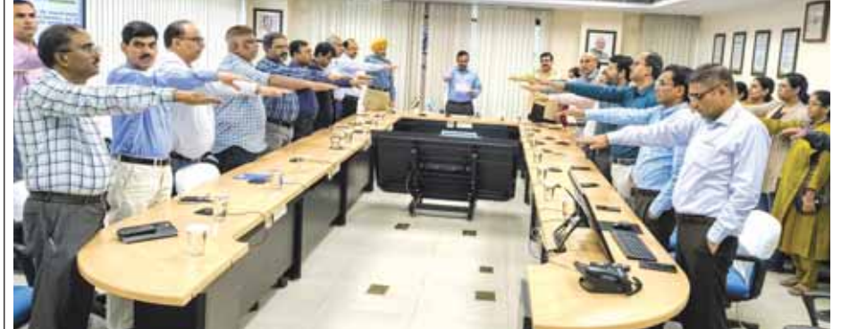
Safety pledge being administered to NTPC employees in Lucknow on Tuesday.