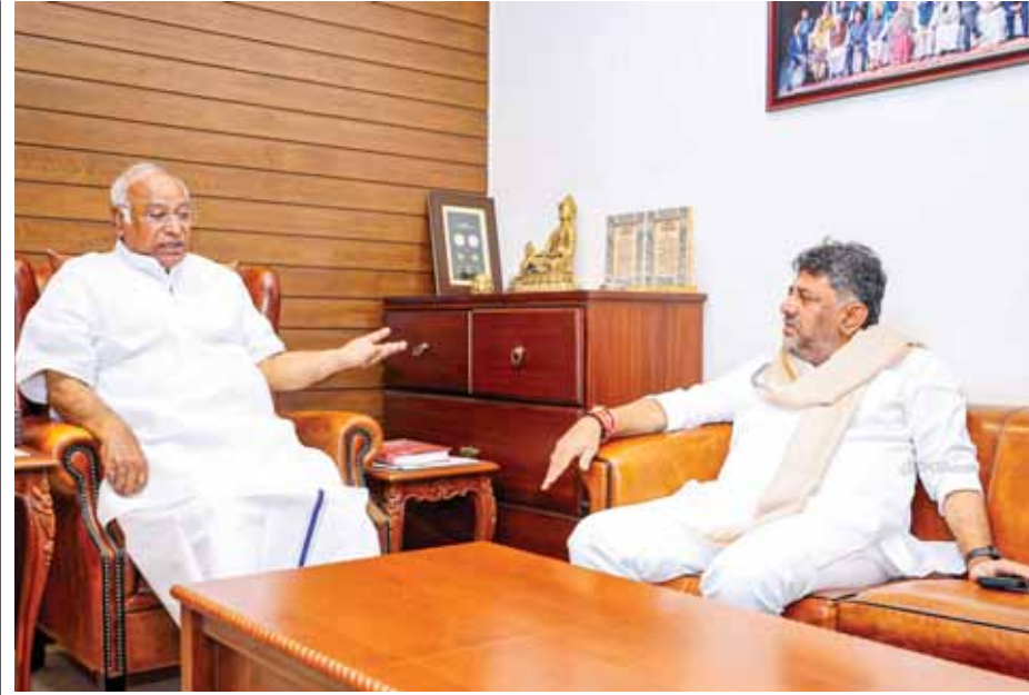
Congress President Mallikarjun Kharge with Karnataka Deputy Chief Minister DK Shivakumar in Bengaluru

nologies such as thermal imaging cameras, drone-based detection systems, and victim locating devices can significantly reduce casualties and damage. Referring to the recent avalanche at Mana in Uttarakhand, the defence minister lauded the use of advanced rescue equipment in saving lives and reducing the impact of the disaster. He said the impact of disasters can be minimised with the use of advanced technology. "Today, India is a prospering nation, and disaster management must become an integral part of our preparedness." "It is not enough for security agencies and technology developers to take the lead; we must also educate the general public. Every citizen should know how to respond in times of crisis," he said. Singh also talked about varied security threats facing different regions of the country. "Security threats in India are not uniform. The issues faced in the Northeast due to insurgencies are different from those in Naxal-affected areas or border regions." "Similarly, urban security concerns are different from those in rural areas. We need to organise dedicated conferences that focus on region-specific challenges and solutions," he said.