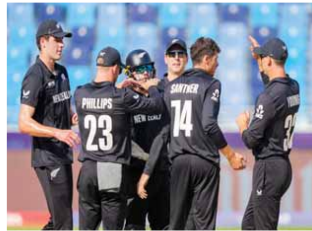
New Zealand players celebrate the wicket of Virat Kohli during ODI match of the ICC Champions Trophy in Dubai

Led by Mitchell Santner, New Zealand finished behind India in Group A, while South Africa topped Group B ahead of