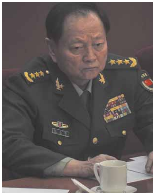
Gen Zhang Youxia, vice chairman of China's Central Military Commission attends the opening of the Chinese People's Political Consultative Conference held at the Great Hall of the People in Beijing, on Tuesday

list and take corresponding measures against them. They include a number of companies linked to defence and security besides AI, aviation, IT and "dual-use" items that carry both civilian and military applications. Also, China has initiated legal action against the US under the World Trade Organisation (WTO) dispute settlement mechanism regarding the latter's latest tariff increase on Chinese products, the Ministry of Commerce said Tuesday. China's retaliatory actions followed after the US imposition of an additional 10-per cent tariff on products imported from China, effective from March 4. The unilateral imposition of tariffs by the US undermines the multilateral trading system, increases the burden on American businesses and consumers, and erodes the foundation of China-US economic and trade cooperation, the commission said. Trump's announcement of a second round of 10 per cent tariffs on Chinese exports to the US coincides with the opening of China's annual parliamentary session. The twin sessions consisting of the Parliament, the National People's Congress and the advisory council, the China People's Political Consultative Conference (CPPCC) were opened on Tuesday. While NPC began with the