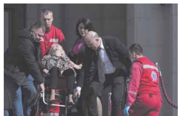
Medics carry a lawmaker injured after chaos erupted during a Serbian parliament session in Belgrade, Serbia, on Tuesday

Belgrade (AP): At least three lawmakers were injured on Tuesday, one of them seriously, after chaotic scenes in Serbia's parliament, during which smoke bombs and flares were thrown, further fuelling political tensions in the Balkan country. Lawmakers were scheduled to vote on a law that would increase funding for university education, but opposition parties said the ruling majority was also planning to approve dozens of other decisions. They said this was illegal and that lawmakers should first confirm the resignation of Prime Minister Milos Vucevic and his government. Chaos erupted about an hour after the parliamentary session started, with opposition lawmakers blowing whistles and holding up a banner reading "Serbia has risen so the regime would fall" Hundreds of opposition supporters rallied outside the parliament building during the session. Video footages from the assembly hall showed a clash first between lawmakers and later flares and smoke bombs being