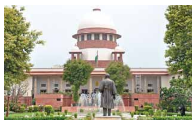
sought information under the RTI Act from additional collector-cum-first appellate authority, Bokaro, and the information was dispatched to him.