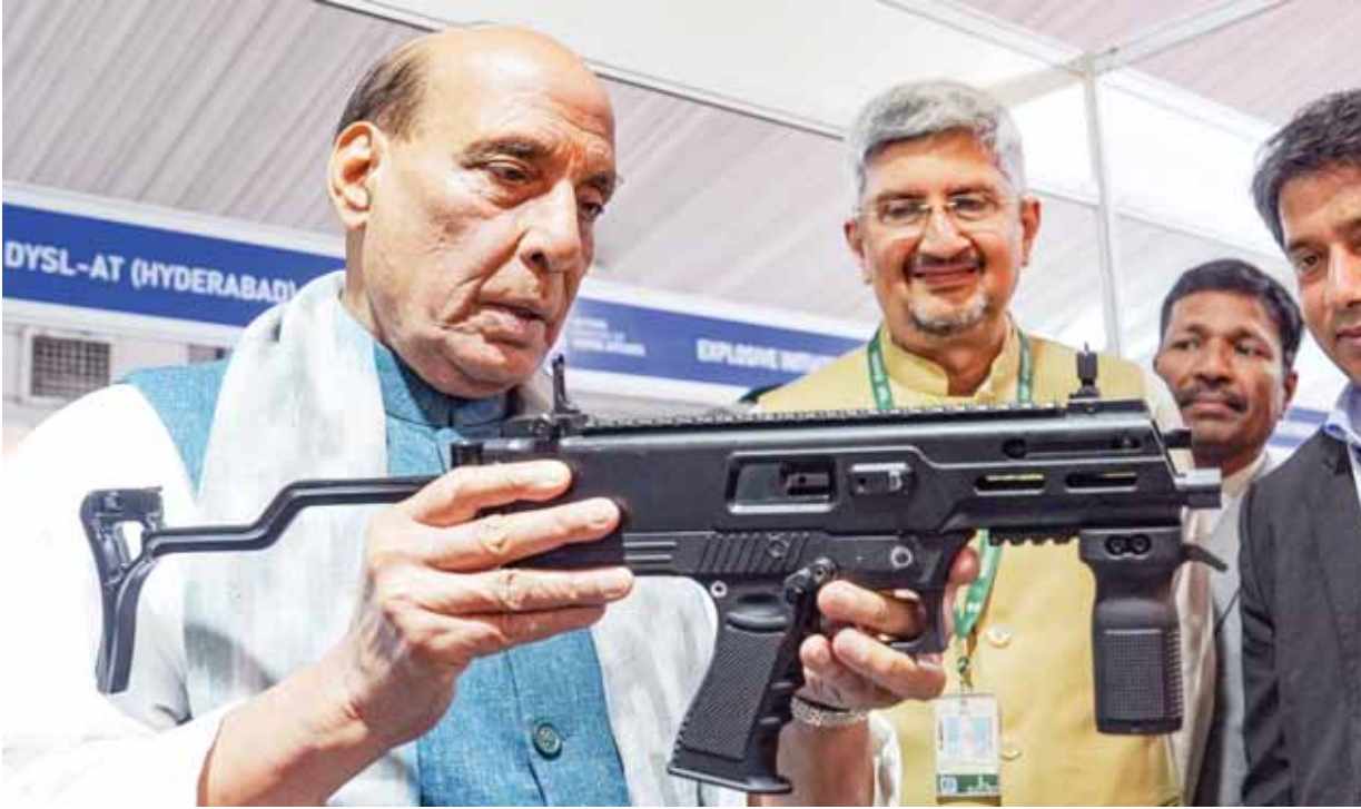
Defence Minister Rajnath Singh visits an exhibition of products for internal security and disaster relief operations in New Delhi