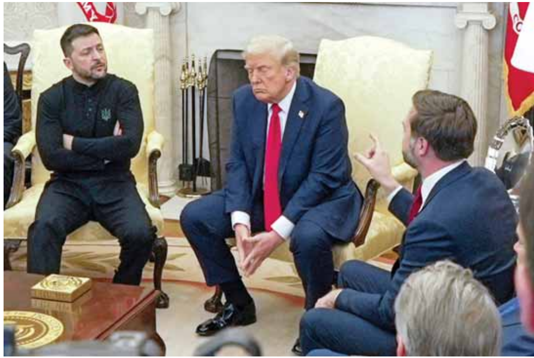
Vice President JD Vance, right, speaks with Ukrainian President Volodymyr Zelenskyy, left, as President Donald Trump listens in the Oval Office at the White House