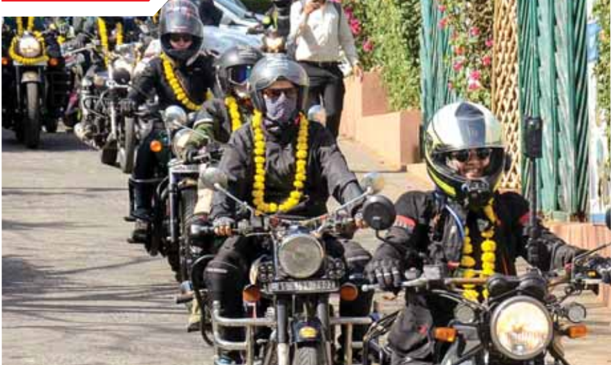
Women participate in bike rally 'Queens on the Wheel', in Bhopal.