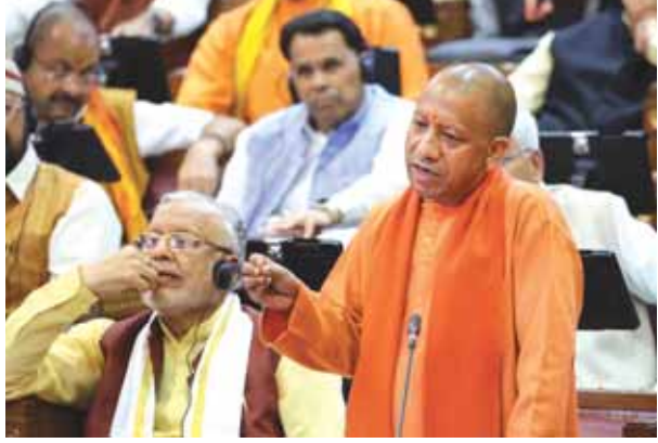
Uttar Pradesh Chief Minister Yogi Adityanath speaks in the House during the Budget session of state Assembly in Lucknow.

Chief Minister Yogi Adityanath, on Tuesday, highlighted the thematic approach of his government's Budgets over the past eight years, saying that each of them was presented with a distinct theme reflecting the state's evolving priorities. Every Budget followed a specific theme, he said adding that the 2017-18 Budget was centred on farmers, while the 2018-19 Budget focused on infrastructure and industrial development, and in 2019-20, the emphasis shifted to women's empowerment, followed by a focus on youth and infrastructure development in the 2020-21 Budget. The 2021-22 Budget embraced the theme of 'empowerment through self-reliance,' and the 2022-23 Budget advanced this vision with the theme of 'self-reliance through Antyodaya,' he added. The 2023-24 Budget aimed to strengthen the foundation of a 'self-reliant Uttar Pradesh' through rapid, inclusive, and holistic development, while the 2024-25 Budget was dedicated to Lord Shri Ram and the welfare of all, the chief minister pointed out. The 2025-26 budget is inspired by Prime Minister Narendra Modi's vision and follows the theme of 'vanchit ko vareyeta' (priority to the deprived), he pointed out, adding that this budget is devoted to the uplift of the poor, farmers, youth, and women, inspired by the Sanatan cultural principle of 'Sarve Bhavantu Sukhinah.' "It covers everything from agriculture to welfare, faith to livelihood and education to self-reliance, ensuring a stronger foundation for a devel-