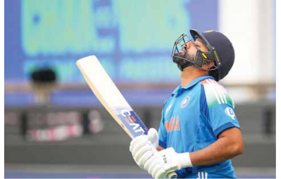
Rohit Sharma prays as he walks to open the innings during the ICC Champions Trophy semi-final cricket match between India and Australia in Dubai

"It's about how well you can play cricket. We talked about Sarfaraz Khan, he was vilified for a long time because he was on the heavier side. But if he scores 150 for India in a Test match and follows it up with another two or three fifty-plus scores, then what's the