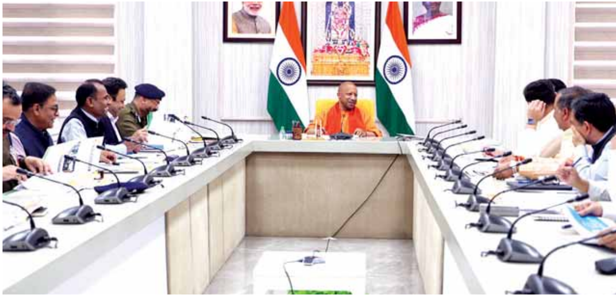
Chief Minister Yogi Adityanath presiding over the meeting of Uttar Pradesh State Road Safety Council at his official residence on Sunday

To curb the growing menace of road accidents on highways and expressways, Chief Minister Yogi Adityanath has ordered effective action against unauthorised vehicles and overloaded trucks. He has also directed officials to close the liquor vends on the sides of expressways and highways. "No liquor shops should be permitted along expressways and highways," said, noting that the signages for these shops were often extensive and should be reduced in size. The chief minister chaired a meeting of the Uttar Pradesh State Road Safety Council on Sunday. The meeting was attended by ministers of the departments concerned, senior government officials, divisional commissioners, district magistrates, police commissioners, and superintendents of police. During the meeting, the chief minister issued essential directives to reduce road accidents in the state effectively. Reviewing the annual data on road accidents, the chief minister highlighted that 46,052 accidents occurred in 2024, resulting in 34,600 injuries and over 24,000 fatalities - figures he described as deeply distressing. Expressing concern at the delay in treatment of accident victims, the chief minister proposed setting up hospital facilities along both sides of all expressways, similar to food plazas. Emphasising the need for urgent action, the chief minister instructed all departments related to road safety to work in coordination to curb accidents. He also directed