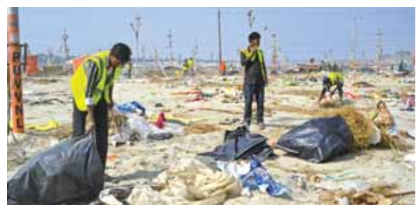
Workers collect garbage at Sangam on Sunday during a cleanliness drive days after the conclusion of Maha Kumbh Mela in Prayagraj

Amidst the sea of devotees who came to Prayagraj for a holy dip in the Sangam during the Maha Kumbh, many got separated from their loved ones. However, thanks to the foresight of the Yogi Adityanath government and its dedicated efforts, 54,357 individuals separated from their near and dear ones, were successfully reunited with their families. Among them, a significant number were women. The police also played a vital role in reuniting devotees from different states of India and Nepal with their families. The Yogi government implemented several exemplary initiatives to ensure this divine event's safety and seamless organisation. A key highlight was the establishment of the Digital Khoya Paya Kendra, which facilitated the swift reunion of more than 35,000 separated devotees and their families. During the amrit snan on Makar Sankranti (January 13-15), 598 individuals