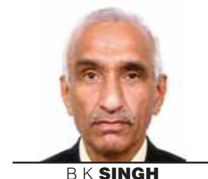
B K SINGH

Despite its noble intent to secure the livelihoods of tribals, the Forest Rights Act has inadvertently opened the door to rampant deforestation and widespread encroachment