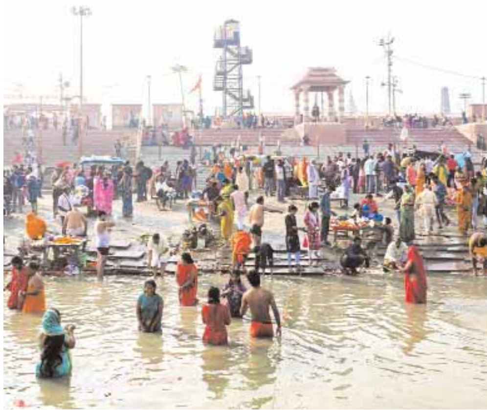
Devotees take a dip in Sarayu river in Ayodhya