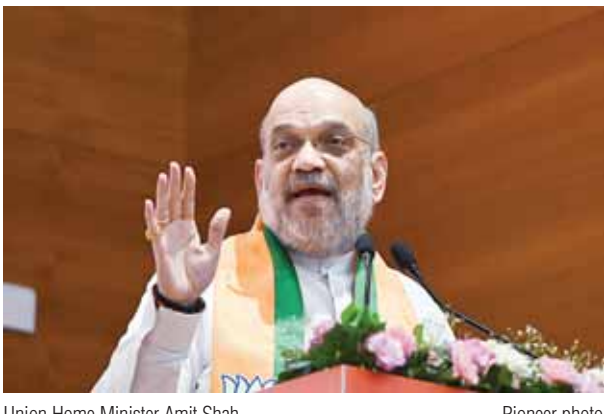
Union Home Minister Amit Shah

Union Home Minister Amit Shah on Sunday said the Modi government is unsparing in punishing drug traffickers who drag the youth into the dark abyss of addiction for the greed of money.