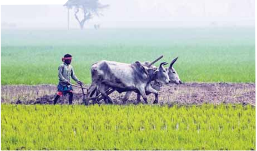
A farmer prepares an agricultural land for paddy cultivation, in Nadia