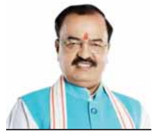
KESHAV PRASAD MAURYA

With a sharp focus on strengthening infrastructure and boosting holistic rural development, the UP budget underscores a visionary and inclusive agenda