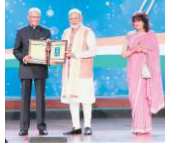
Mauritian Prime Minister Navinchandra Ramgoolam on Tuesday announced that his Indian counterpart Narendra Modi will be conferred with the nation's highest honour, The Grand Commander of the Order of the Star and Key of the Indian Ocean.

Mauritius PM bestows country's highest honour on PM Modi