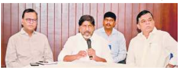
Deputy Chief Minister Bhatti Vikramarka Mallu revealed the scheme's details during a press conference held at the Veer Vanitha Chakali Ilaamma Women's University on Tuesday.

PNS ■ HYDERABAD The Telangana Government has announced the launch of Rajiv Yuva Vikasam, a major self-employment scheme with a budget of Rs 6,000 crore, aimed at empowering five lakh unemployed SC, ST, BC and minority youth.