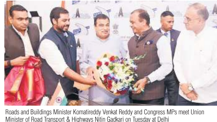
Roads and Buildings Minister Komatireddy Venkat Reddy and Congress MPs meet Union Minister of Road Transport & Highways Nitin Gadkari on Tuesday at Delhi