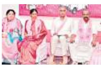
K. Chandrasekhar Rao addressing the BRS Legislature Party meeting on Tuesday.

Urges MLAs, MLCs to be present in the House