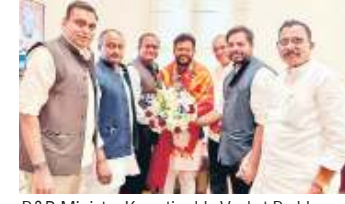
R&B Minister Komatireddy Venkat Reddy and Congress MPs meet Union Civil Aviation Minister K Rammoohan Naidu on Tuesday at Delhi

PNS ■ HYDERABAD The Union Minister of Road Transport and Highways, Nitin Gadkari, has assured that all permissions for the Regional Ring Road (RRR) will be given within two months and the matter will be brought to the attention of Prime Minister Modi after getting all clearances, Roads and Buildings (R&B) Minister Komatireddy Venkat Reddy said.