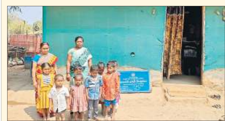
An Anganwadi centre in a facility built with corrugated roof sheets