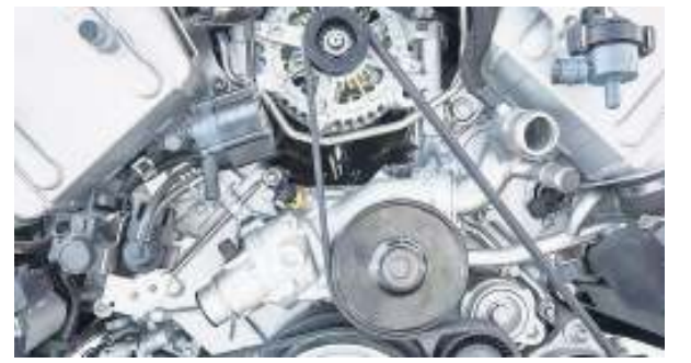
The report 'Revving Up Exports: The Next Phase of Export Growth for the Auto Component Industry', conducted in association with the Automotive Component Manufacturers Association of India (ACMA), presents a comprehensive, multi-faceted strategy to achieve this ambitious target

As per the findings, doubling down on classical components, India can potentially