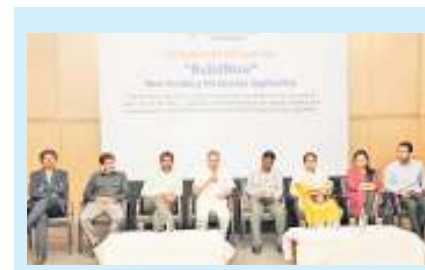
Members of NAREDCO Telangana in an interactive session on the BuildNow portal in Hyderabad

(IP), MCH, IVF, OP diagnostic services and scanning wards. He expressed dissatisfaction over the absence of