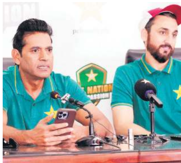
Pakistan interim head coach Aaqib Javed, left, speaks as Salman Ali Agha watches during a press conference in Lahore

Aaqib, a senior selector, was then asked to take over as interim head coach of the white ball squad and then also the red ball team for the Test series in South Africa and against West Indies at home.