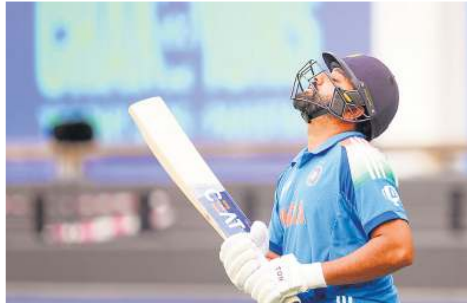
Rohit Sharma prays as he walks to open the innings during the ICC Champions Trophy semi-final cricket match between India and Australia in Dubai

"It's about how well you can play cricket. We talked about Sarfaraz Khan, he was vilified for a long time because he was on the heavier side. But if he scores 150 for India in a Test match and follows it up with another two or three fifty-plus scores, then what's the