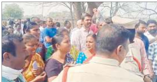
Farmers, particularly the women farmers staging a protest against land acquisition for Mamnoon airport in Warangal on Tuesday

Following the Central government's approval for the Mamnoon airport, farmers have strongly opposed the land acquisition survey associated with the project. On Tuesday, a protest was held on the Nakkalapally road near the airport, where farmers, particularly women, demanded fair