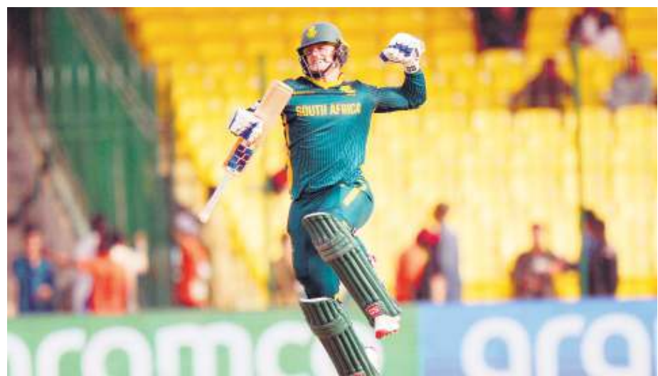
South Africa's Ryan Rickelton celebrates after scoring century during the ICC Champions Trophy cricket match

T20: Salman Ali Agha (captain), Shadab Khan (VC), Abdul Samad, Abrar Ahmed, Haris Rauf, Hasan Nawaz, Jahandad Khan, Khushdil Shah, Muhammad Abbas Afridi, Muhammad Ali, Muhammad Khan, Muhammad Irfan Khan, Omaid Bin Yousuf, Shaheen Shah Afridi, Sufyan Muqeem, Usman Khan.