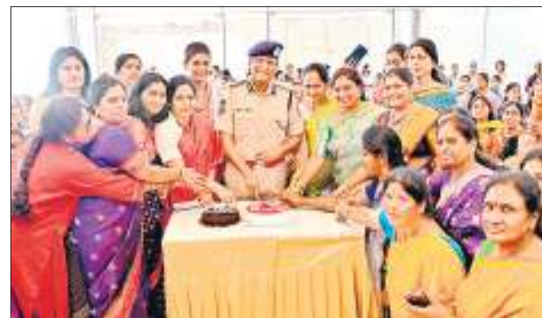
Rachakonda Police Commissioner Sudheer Babu at Women's Day Celebrations at Nagole in Rangareddy district on Tuesday

Speaking as the chief guest, Rachakonda Police Commissioner Sudheer Babu emphasised the importance of women's empowerment, stating that women possess immense willpower and can achieve anything. He acknowledged the challenges women face due to discrimination but praised their determination in overcoming obstacles to