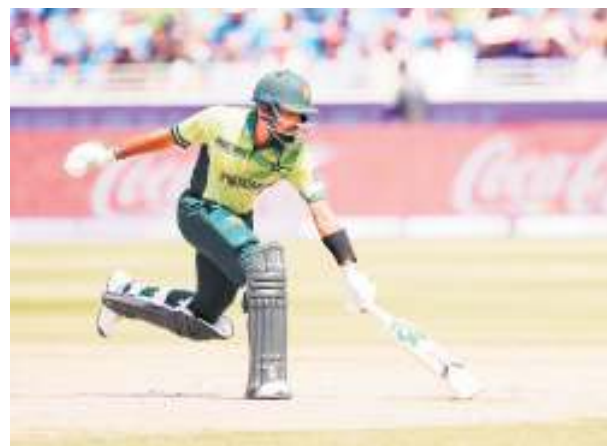
Babar Azam plays a shot during the Champions Trophy 2025 cricket match