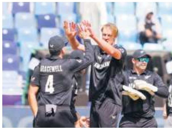
New Zealand players celebrate the wicket of Virat Kohli during ODI match of the ICC Champions Trophy in Dubai

While South Africa would look to shed their big tournament "chokers" tag, the Kiwis will also be desperate to lay their hands on a title after having finished second best twice in the ODI World Cup (2015 and 2019) and once in the T20 World Cup (2021). Led by Mitchell Santner, New Zealand finished behind India in Group A, while South Africa topped Group B ahead of