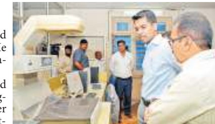
District Collector Anudeep Durishetty inspecting the Central library at Afzalgunj

During his inspection, the Collector examined the library registers, the textbook section, the digital library, computers, Xerox machines and other sections. The Collector enquired whether competitive exam books were available in Telugu and suggested that UPSC books be made available. Furthermore, the Collector interacted with students preparing for various competitive exams and asked if they had access to adequate resources and encouraged them to set clear goals, prepare diligently for exams and utilise the library as a valuable source of knowledge.