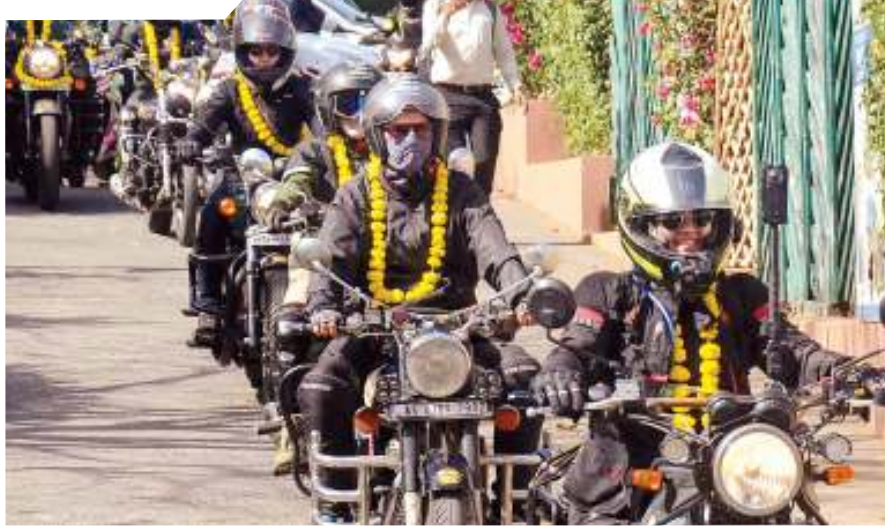
Women participate in bike rally 'Queens on the Wheel', in Bhopal.