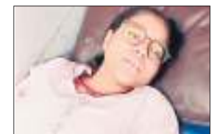
A girl, who fell ill due to food poisoning at the college hostel, convalescing in hospital in Khammam on Tuesday

The college management immediately shifted the students to a hospital. Among the affected students, three are receiving treatment at KIMS Hospital in Khammam, while