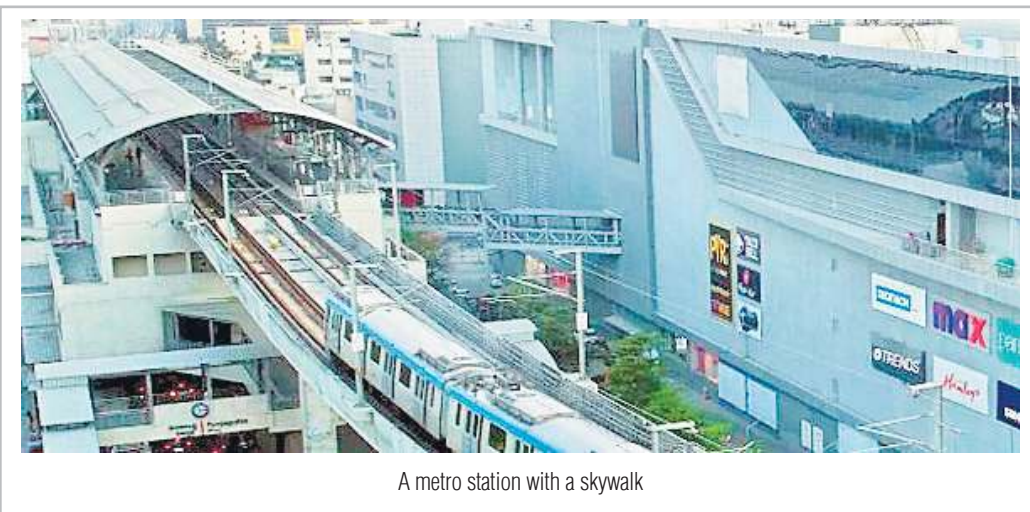
A metro station with a skywalk

With both countries deepening economic and technological cooperation, the Telugu states are poised to play a vital role in advancing the UK-India trade relationship, driving innovation and investment in AI and healthcare sectors.