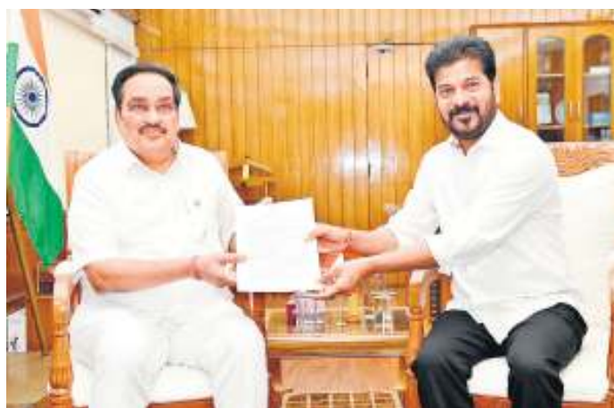
Chief Minister Revanth Reddy meeting Union Jal Shakti Minister C R Patil in New Delhi on Monday

He accused the Krishna River Management Board (KRM) of bias, stating that Andhra Pradesh has been illegally drawing more water than allocated to it. This year too, Andhra Pradesh has taken more than its share, causing losses to Telangana, the CM said