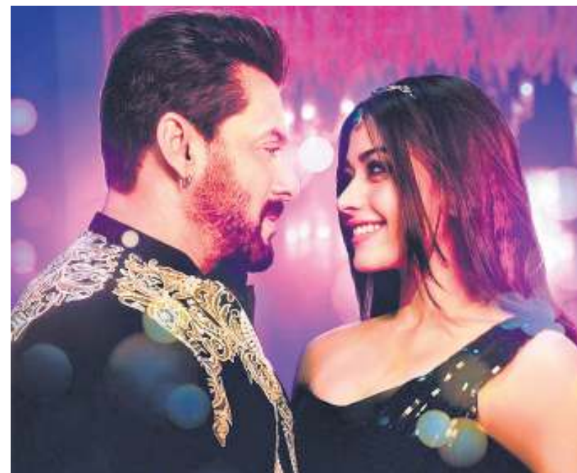
The makers of the upcoming Salman Khan and Rashmika Mandanna-starrer Sikandar , dropped the teaser of the song Zohra Jabeen on Monday. The teaser promises a vibrant, foot-tapping dance number and features Salman and Rashmika Mandanna, and their palpable chemistry. From dazzling costumes to smooth, lively choreography, the teaser is packed with everything needed to make this track a worldwide sensation.