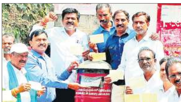
Telangana statehood movement activists participating in the postcard campaign at martyrs' memorial near Mayuri centre in Khammam on Monday

In response to the call by the Telangana Movement Forum State Committee, a postcard campaign was organised at the martyrs memorial near Mayuri Centre. The activists sent postcards to Chief Minister A Revanth Reddy, demanding immediate implementation of the promises made to activists who participated in the Telangana movement. The Congress party made many promises to the activists during the election campaign.