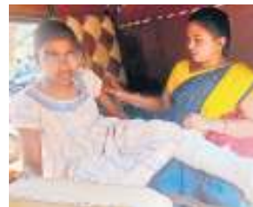
Girl student with her mother in hospital

Members of the Akhil Bharatiya Vidyarthi Parishad (ABVP), along with the girl's