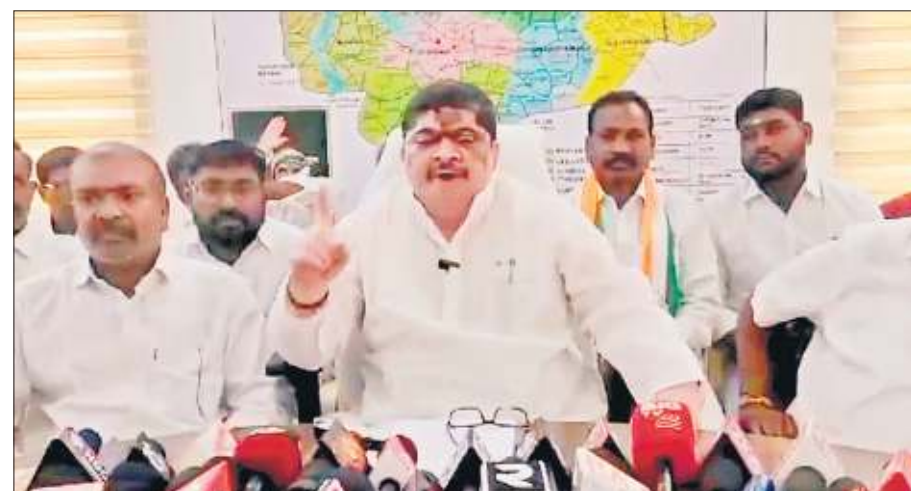
Transport Minister Ponnam Prabhakar speaking to reporters in Husnabad on Monday

The Minister emphasised that if Kishan Reddy hailed from Telangana, he should