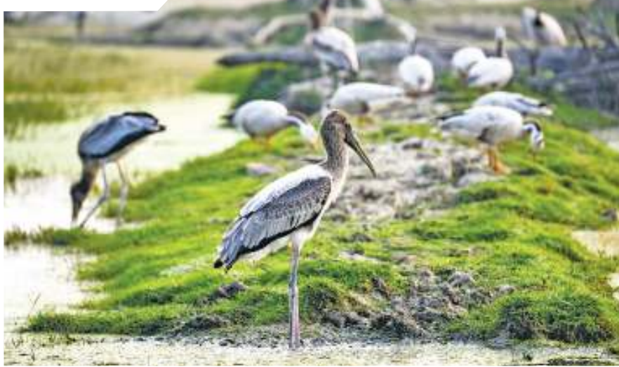
Painted storks at Keoladeo National Park, in Bharatpur