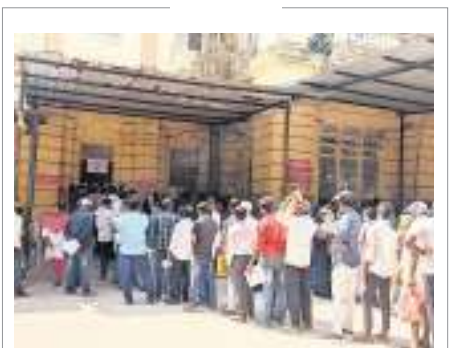
Patients waiting in queue at ENT Government Hospital of Koti in Hyderabad on Monday.

NVS Reddy also highlighted that all 57 Phase 1 metro stations have pedestrian-friendly facilities for road crossings and urged the public to use them for safe transit.