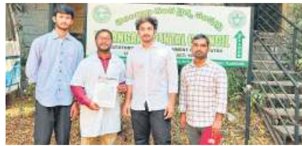
All India Dental Students Association and All India Dental Surgeons Association seeking action against quacks, in Hyderabad on Monday

This move aligns with the ongoing Anti-Quackery Awareness Week organised by AIDSA, aimed at raising awareness about the risks associated with quackery and promoting ethical dental practices across India. The All India Dental Students Association (AIDSA) and the All India Dental Surgeons Association (AIDSA - Surgeons Wing) have submitted formal letters to all state Dental Council of India (DCI) offices. These letters urge immediate and strict action against individuals practicing dental quackery