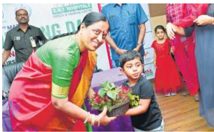
Minister for Forests, Environment, and Endowments Konda Surekha at meeting in Hyderabad on Monday

Addressing the gathering at Maa ENT Hospital in Jubilee Hills, where she attended as the chief guest, the minister unveiled a special awareness poster, watched cultural performances by children who had successfully undergone cochlear implant surgeries, and felicitated doctors for their contributions in