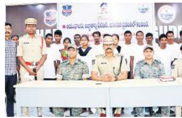
Police officers with surrendered members of the banned Maoists party in Kothagudem on Monday

Despite these efforts, there has been criticism that large defaulters are still being overlooked, and some allege negligence in the collection process by field staff. As the strategies and actions taken by the officers unfold, it remains to be seen whether these intensified measures will prove successful in achieving the tax collection targets.