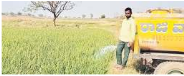
A farmer irrigating his field with the help of a water tanker in Komuravalle mandal in Siddipet district

Even before the start of the summer season, there are already issues with irrigation and drinking water. Due to the decline in groundwater levels and the failure to release water from reservoirs into lakes and ponds, crops are drying up. Farmers are worried. With such water scarcity in rural areas even before the summer season, farmers are concerned about what the situation would be like during the sum-