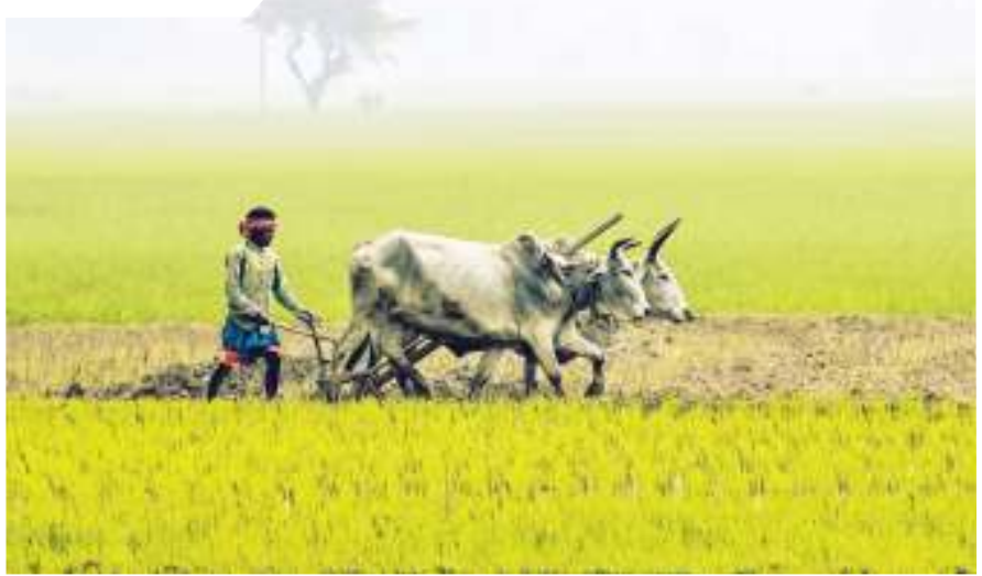
A farmer prepares an agricultural land for paddy cultivation, in Nadia