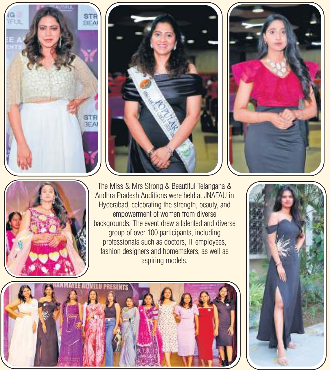
The Miss & Mrs Strong & Beautiful Telangana & Andhra Pradesh Auditions were held at JNAFAU in Hyderabad, celebrating the strength, beauty, and empowerment of women from diverse backgrounds. The event drew a talented and diverse group of over 100 participants, including professionals such as doctors, IT employees, fashion designers and homemakers, as well as aspiring models.