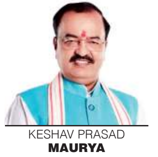
KESHAV PRASAD MAURYA

With a sharp focus on strengthening infrastructure and boosting holistic rural development, the UP budget underscores a visionary and inclusive agenda