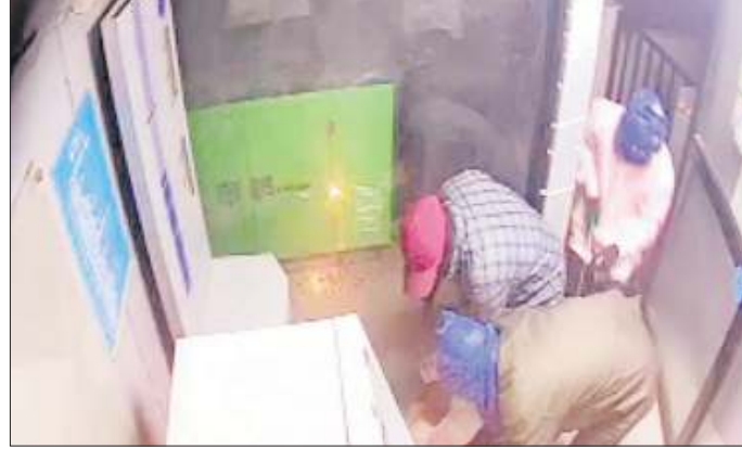
Four masked burglars inside the SBI ATM kiosk in Rangareddy on Sunday

Four masked men carried out a daring heist at a State Bank of India (SBI) ATM kiosk in Rangareddy district, stealing nearly Rs 30 lakh in just four minutes. The robbery took place in the early hours of Sunday. At around 1:56 am, one of the robbers was seen exiting a car and casually approaching the ATM kiosk. He damaged the CCTV camera at the gate to disable it and also cut the emergency siren wires. However, the CCTV camera inside the kiosk captured the entire operation by the burglars. It seemed that the miscreants did not find the CCTV camera inside the ATM kiosk. Inside the kiosk, three men, armed with an iron rod and a gas