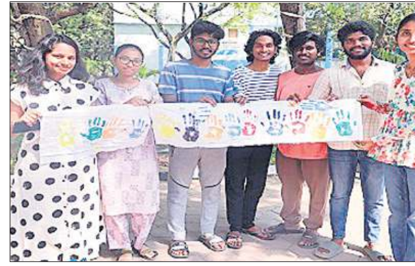
Students at NITW @ SpringSpree 2025 in Hanamkonda on Sunday

National Institute of Technology Warangal (NITW) cultural fest, SpringSpree 25, concluded on Sunday. The festival was held from February 28. The festival is a platform for cultural exchange, creativity, and talent. It also aimed to promote inclusivity and a deeper appreciation for different cultures. SpringSpree, NIT Warangal's annual cultural festival, started in 1978 as a refreshing break from classes. Now, after 47 years, it is renowned as one of the nation's best cultural festivals, attracting participants from all corners. Over time, they have hosted famous artistes, enriching the festival with their esteemed presence and performances. On day 1 the festival was inaugurated by K Brahmaaramandam, a legendary actor and comedian. On Day 2, the stunning setup of lights