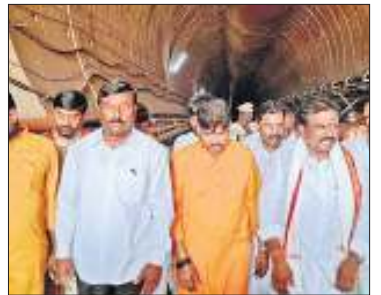
week after the incident occurred.

He stated that the state government was responsible for the deaths of these workers, calling it a clear case of murder by the state government. He questioned why Chief Minister Revanth Reddy had not visited the site even a