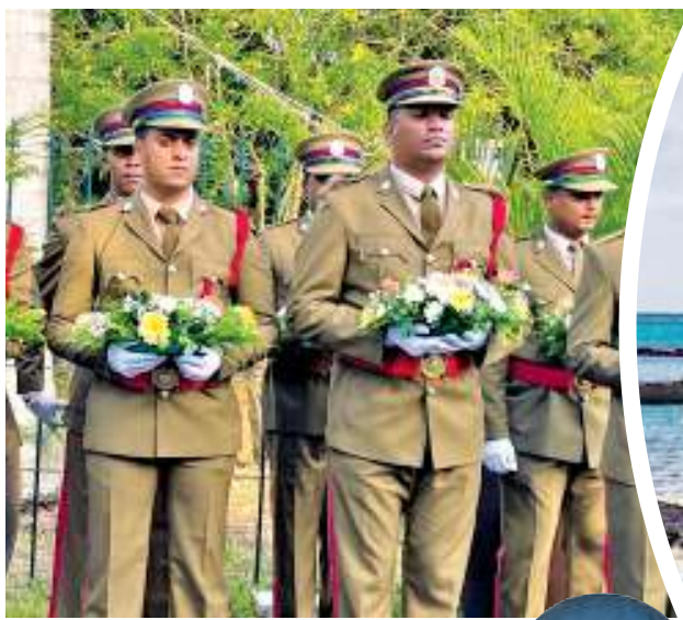
Despite its beauty, Mauritius honours its painful history of slavery annually on Abolition Day