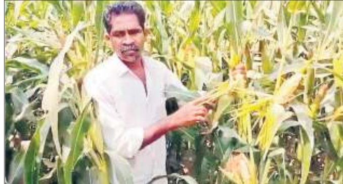
A farmer showing failed maize crop at Venkatapuram in Mulugu district

Across two mandals, a total of 4,000 acres was covered by maize seeds, but have resulted in no significant yield, causing up to Rs 1 crore loss to farmers. Without providing the promised seeds, the company agents, the farmers alleged, took them for a ride. Even though the agents had no direct involvement, they acted as middlemen, sending these farmers to the companies. While the companies