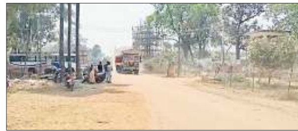
Highway 163 and the increase in heavy vehicles, including sand lorries, heading towards Chhattisgarh, the road leading to Eturnagaram village was dam-

Officials removed the huge gates erected on the main road in front of the police station in Eturnagaram mandal of Mulugu district. The gates were erected 25 years ago when the Naxalite movement was at its height. In 2001, Maoists attacked the police station with tractor bombs. Since then, for security reasons, police higher-ups had installed large gates on the road to prevent vehicles from passing through. In 2011, with the opening of National