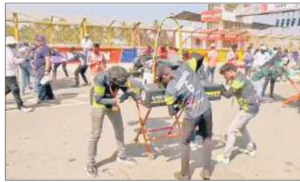
Guru Nanak Institutions students at 12th national level go-kart design challenge in Uttar Pradesh

Kart stood out as a remarkable feat of engineering, featuring cutting-edge technology and innovation. The key highlights