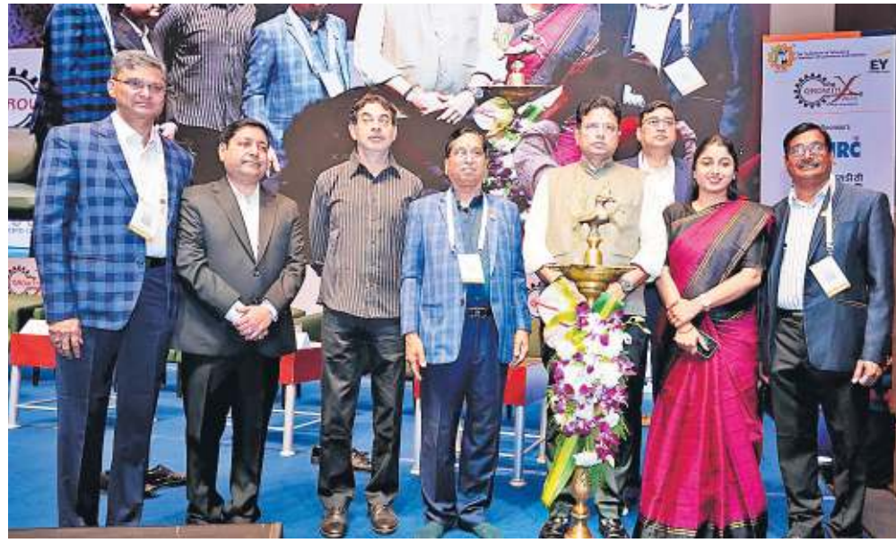
IT Minister D Sridhar Babu, along with Special Chief Secretary Jayesh Ranjan lighting the lamp at GrowthX 2025 Summit on Saturday

The Minister announced that the government aims to make Telangana a $1 trillion economy