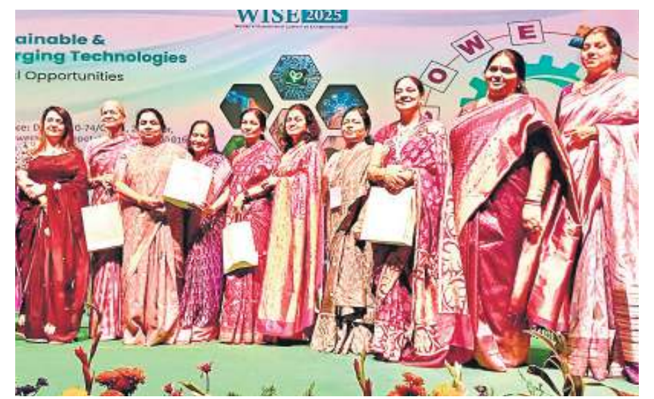
Panel members of women entrepreneurs at WISE 2025 in Hyderabad on Saturday