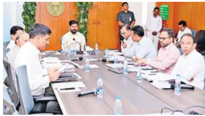
Telangana State Mineral Development Corporation (TGMDC).

The Chief Minister directed them to ensure that all sand required for government projects, including those under Irrigation, R&B, and Panchayat Raj departments, is supplied exclusively through the