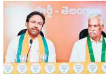
Telangana BJP president G Kishan Reddy addressing the media at State BJP office on Saturday