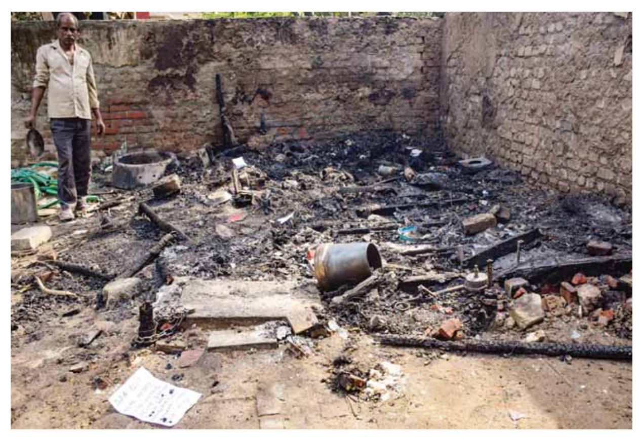
A man near the charred remains at the site after a fire gutted a makeshift tent near the AGCR Enclave in Anand Vihar