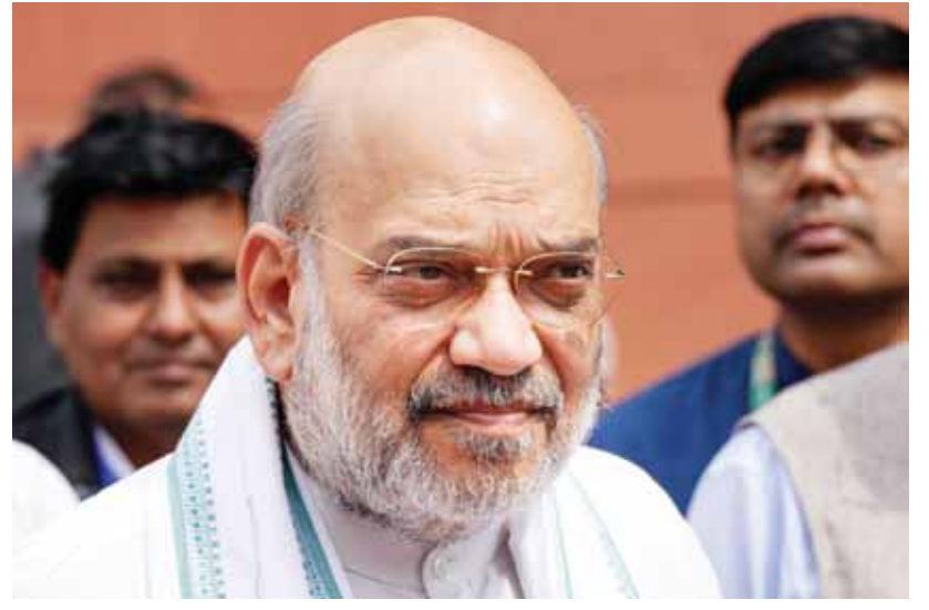
Home Minister Amit Shah during the Budget session of Parliament in New Delhi on Tuesday

Violence, bandhs, drugs, blockades, and regionalism fragmented the region, causing a divide not only between the northeast