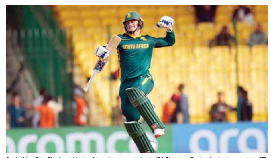
South Africa's Ryan Rickelton celebrates after scoring century during the ICC Champions Trophy cricket match