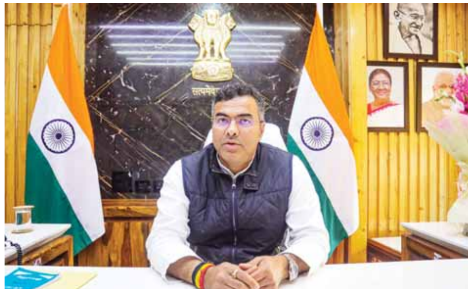
PWD minister Parvesh Verma at his office at Delhi Secretariat

In a first, the Delhi government has planned to hand-over the maintenance of PWD roads in the city border areas to NHAI, with a 13.23-km stretch of Delhi-Rohtak Road being transferred to the authority as part of its initiative to strengthen road network. The move will also boost a larger infrastructure development strategy in the national Capital. According to the government, the 13.23 stretch from Peeragarhi Chowk to Tikri Border (Delhi-Haryana border) will soon be handed over to the National Highways Authority of India (NHAI). The stretch between Delhi-Rohtak Road has been described as the "worst road of the city". Rohtak Road is in a dilapidated condition due the rapid unplanned population growth along the stretch, and the inadequate capacity of drains to carry water from these areas.