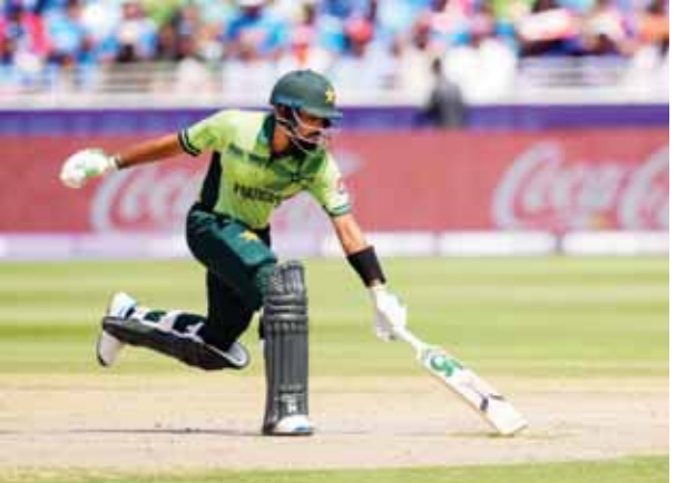
Babar Azam plays a shot during the Champions Trophy 2025 cricket match

T20 World Cup, Pakistan are set to play a minimum of five T20Is in the Asia Cup 2025 and three T20Is each against West Indies (away in July), Afghanistan (home in August), Ireland (home in September), South Africa (home in September/October), Sri Lanka (home in November) and Australia (home in January 2026). The board said that Mohammad Rizwan will continue leading the ODI side as Pakistan build for the 2027 ODI World Cup, which will take place in Namibia, South Africa and Zimbabwe. The board also confirmed that openers Fakhar Zaman and Saim Ayub were not considered for either format for the New Zealand tour on medical advice. "Fakhar suffered a left lower intercostal muscle sprain during Pakistan's ICC Champions Trophy opener against New Zealand, while Saim is recovering from a right ankle fracture sustained on the first day of the Cape Town Test against South Africa in January," the board said. It confirmed that both are expected to be fully fit for the Pakistan Super League 10, starting in Rawalpindi on 11 April.