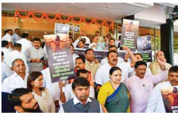
Members of the ruling Mahayuti stage a protest against Samajwadi Party MLA Abu Asim Azmi during the Budget session of Maharashtra Assembly in Mumbai

The issue of SP MLA Abu Asim Azmi's remarks eulogising Mughal emperor Aurangzeb rocked both houses of the Maharashtra legislature on Tuesday, with members of the ruling Mahayuti demanding his suspension and charging him with treason. Both the houses were adjourned over the issue. The development came on a day when the opposition Maha Vikas Aghadi planned to corner the government over the resignation of NCP minister Dhananjay Munde. As proceedings of both the houses began, the Mahayuti members started raising slogans seeking action against Azmi, who is the Samajwadi Party's state president. They claimed Azmi was a descendant of Aurangzeb, who tortured Maratha king Chhatrapati Sambhaji Maharaj and brutally killed him. Deputy Chief Minister and Shiv Sena head Eknath Shinde led the attack on Azmi both in the legislative council and assembly. In the council, the former CM said Azmi also made objectionable statements in