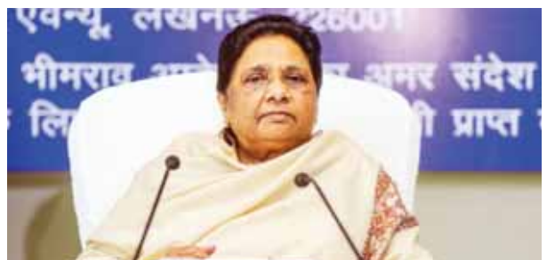
Mayawati during meeting with party's senior office bearers and state presidents at the party office, in Lucknow