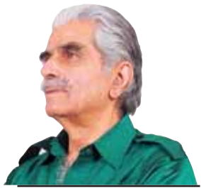
ASHOK K MEHTA

up. Russia supplied six Su30 aircraft while six Burmese elephants were sent to Moscow. The Sukhois will significantly enhance aerial capability and cause additional civilian casualties. China remains the key stakeholder in Myanmar and is supporting the Junta as it has made major military and economic investments in Myanmar. It eyes the rich minerals, oil, gas and hydropower. Its gas pipeline from Kyaukphu seaport on the Andaman Sea to Kunming in Yunnan provides Beijing access to the Indian Ocean. Gas pipelines are being supplemented by road and railway arteries. Along with Coco Island given on lease, the China-Myanmar Economic Corridor constitutes an alternative route to China's Malacca dilemma. With 20,000 new recruits with Junta, Beijing has calculated that Resistance cannot defeat it. So Beijing-brokered cease-fires with EAOs in Kachin and Shan states and Kokang region in the north and also with MNDAA in January 2025. Beijing will also support Junta to hold elections in November 2025 giving it the fig-leaf of legitimacy. (The writer, a retired Major General, was Commander, IPKF South, Sri Lanka, and founder member of the Defence Planning Staff, currently the Integrated Defence Staff. The views are personal)