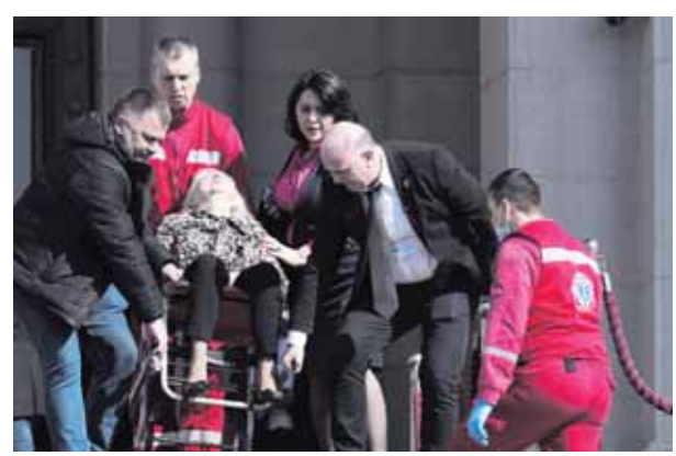
Medics carry a lawmaker injured after chaos erupted during a Serbia's parliament session in Belgrade, Serbia, on Tuesday

Belgrade (PTI): At least three lawmakers were injured on Tuesday, one of them seriously, after chaotic scenes in Serbia's parliament, during which smoke bombs and flares were thrown, further fuelling political tensions in the Balkan country. Lawmakers were scheduled to vote on a law that would increase funding for university education, but opposition parties said the ruling majority was also planning to approve dozens of other decisions. They said this was illegal and that lawmakers should first confirm the resignation of Prime Minister Milos Vucevic and his government. Chaos erupted about an hour after the parliamentary session started, with opposition lawmakers blowing whistles and holding up a banner reading "Serbia has risen so the regime would fall" Hundreds of opposition supporters rallied outside the parliament building during the session. Video footages from the assembly hall showed a clash first between lawmakers and later flares and smoke bombs being