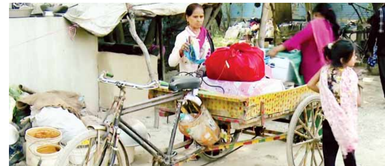
People vacate their residence ahead of a demolition drive at Yamuna bridge area Shastri Park