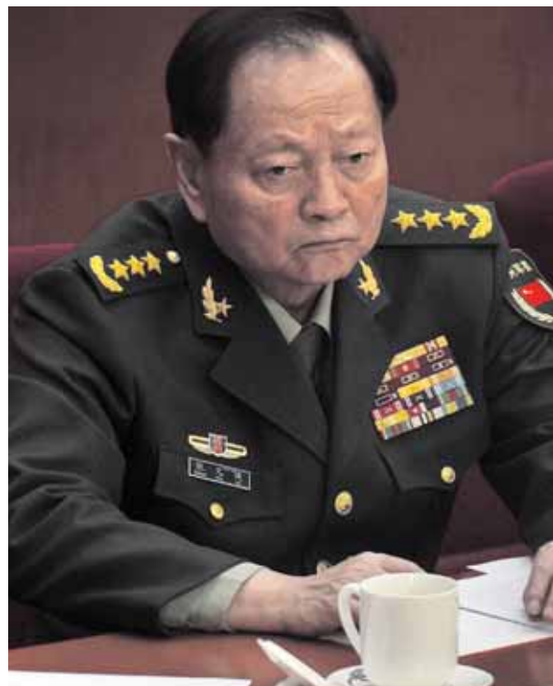
Gen Zhang Youxia, vice chairman of China's Central Military Commission attends the opening of the Chinese People's Political Consultative Conference held at the Great Hall of the People in Beijing, on Tuesday

The twin sessions consisting of the Parliament, the National People's Congress and the advisory council, the China People's Political Consultative Conference (CPPCC) were opened on Tuesday. While NPC began with the