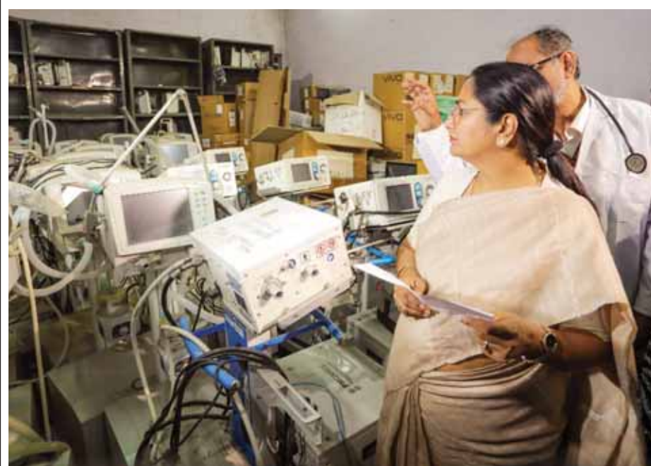
Delhi Chief Minister Rekha Gupta during a visit to the Guru Teg Bahadur Hospital