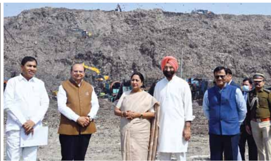
LG VK Saxena with CM Rekha Gupta at the Bhalswa landfill

The previous AAP government had sanctioned ₹183 crores to overhaul the New Rohtak Road with an aim to eliminate the problem of water logging and traffic congestion, which will bring relief to lakhs of commuters and residents of areas starting Nangloi, Mundka, Ghevra and upto Tikri around the Delhi-Haryana Border. The project remained on the paper.