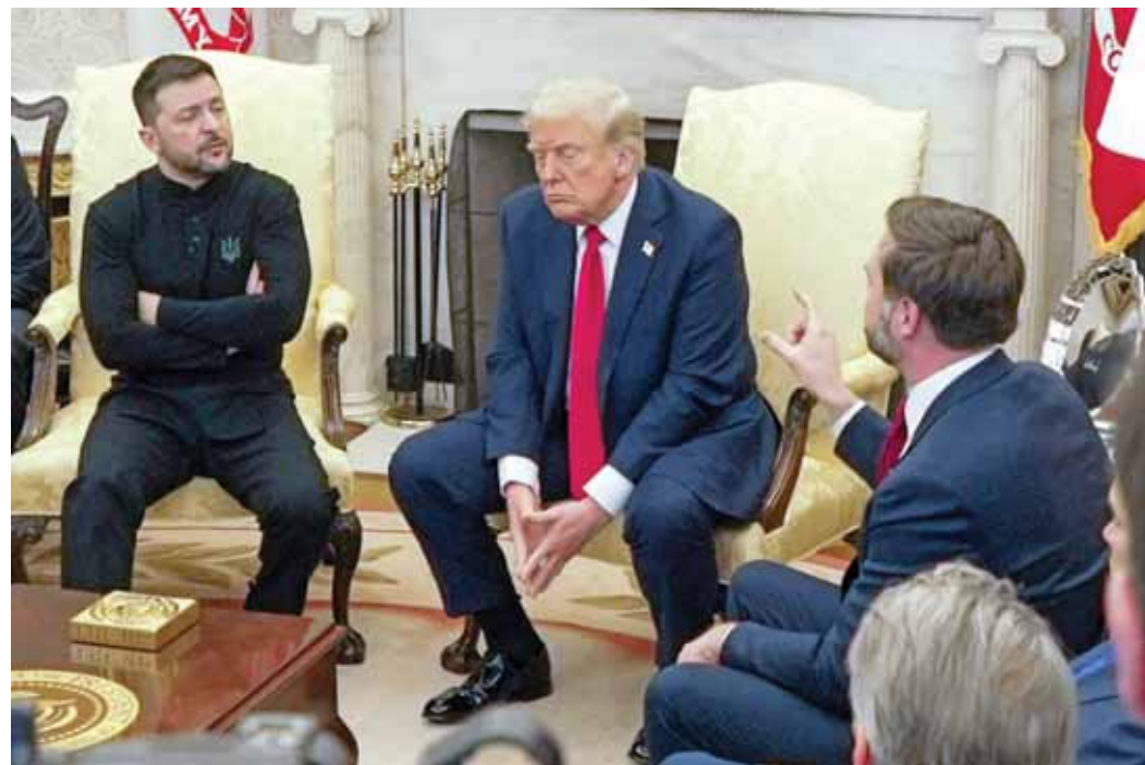
Vice President JD Vance, right, speaks with Ukrainian President Volodymyr Zelenskyy, left, as President Donald Trump listens in the Oval Office at the White House

Trump at an event at the White House later on Monday referred to Zelenskyy's reported comments, and asserted the Ukrainian leader "better not be right about that." "If somebody doesn't want to make a deal, I think that person won't be around very long," Trump added. "That person will not be listened to very long." Meanwhile, Trump is scheduled to address Congress on Tuesday with a speech that will offer him an opportunity to outline his vision for ending the war. As regards tariffs, Trump said Monday "Tomorrow - tariffs 25% on Canada and 25% on Mexico. And that'll start," Trump told reporters in the Roosevelt Room. "They're going to have to have a tariff." He has said the tariffs are to force the two US neighbours to step up