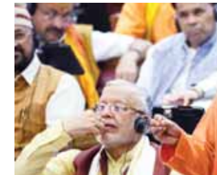
UP CM Yogi Adityanath speaks in the House during Budget session of state Assembly in Lucknow

progress over the years. "Despite being the largest state with abundant resources, the Gross State Domestic Product (GSDP) of Uttar Pradesh stood at only ₹12.75 Lakh Crore from 1950 to 2017. However, after the people placed their trust in Prime Minister Narendra Modi's policies in 2017, the state's GSDP is more than doubled and is expected to reach ₹27.51 Lakh Crore in 2024-25," he said. He added that Uttar Pradesh now holds a 9.2 per cent share in the national GDP, ranking second in the country. While India's GDP growth rate in 2023-24 was 9.6 per cent, Uttar Pradesh recorded a higher growth rate of 11.6 per cent. Emphasising Uttar Pradesh's leadership in the digital revolution, CM Yogi pointed out the rapid adoption of digital transactions. "In 2017-18, the state recorded 122.84 Crore digital transactions, which surged to 1,024.41 Crore by December 2024. Uttar Pradesh is now the leader in digital payments, with more than half of the transactions happening via UPI," he said. He attributed this success to better internet connectivity in rural areas, financial awareness, and the availability of banking infrastructure.