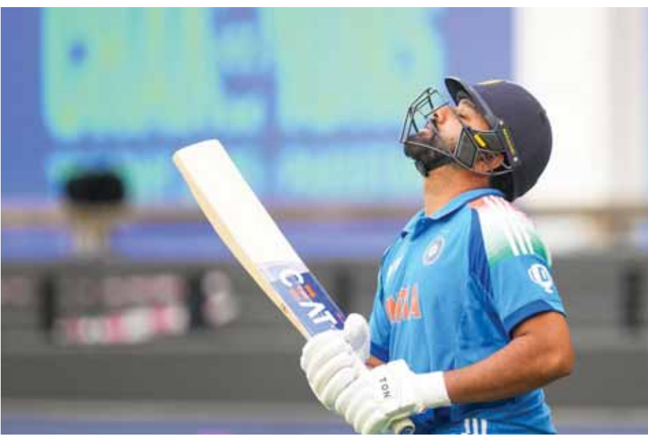
Rohit Sharma prays as he walks to open the innings during the ICC Champions Trophy semi-final cricket match between India and Australia in Dubai

PTI ■ DUBAI Backing India captain Rohit Sharma, who was subjected to fat-shaming, cricket legend Sunil Gavaskar on Tuesday said that slim guys are for modelling and in cricket, mental strength is what matters, not physical size. Addressing the unnecessary criticisms directed at India skipper in the middle of Champions Trophy by a politician, Gavaskar reminded how Mumbai's big-hitting Sarfaraz Khan also faced body shaming, but it didn't affect his performance at all. "I have always said, if you want only slim guys, then you should go to a modelling competition and pick all the models. It's not about that," Gavaskar said. "It's about how well you can play cricket. We talked about Sarfaraz Khan, he was vilified for a long time because he was on the heavier side. But if he scores 150 for India in a Test match and follows it up with another two or three fifty-plus scores, then what's the