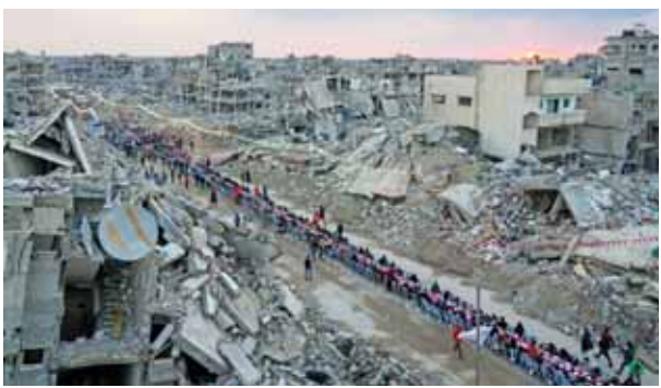
As the sun sets, Palestinians sit at a large table surrounded by the rubble of destroyed homes and buildings as they gather for iftar, the fast-breaking meal, on the first day of Ramazan in Rafah, southern Gaza strip