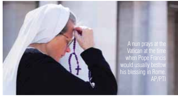
A nun prays at the Vatican at the time when Pope Francis would usually bestow his blessing in Rome.

A stable Pope Francis had a visit Sunday from the Vatican secretary of state as he continued his recovery from double pneumonia, the Vatican said, but again skipped his weekly noon blessing to avoid even a brief public appearance from the hospital. Instead, the Vatican distributed a message from the pope in which he thanked his doctors for their care and well-wishers for their prayers, and prayed again for peace in Ukraine and elsewhere. "From here, war appears even more absurd," Francis said in the message, which he drafted in recent days from the Gemelli hospital, the Vatican said. Francis said he was living his hospitalization as an experience of profound solidarity with people who are sick and suffering everywhere. "I feel in my heart the blessing that is hidden within frailty, because it is precisely in these moments that we learn even more to trust in the Lord," Francis said in the text. "At the same time, I thank God for giving me the opportunity to share in body and spirit the condition of so many sick and suffering people." Signs point to a recovery: It marked the third weekend in a row that Francis has cancelled