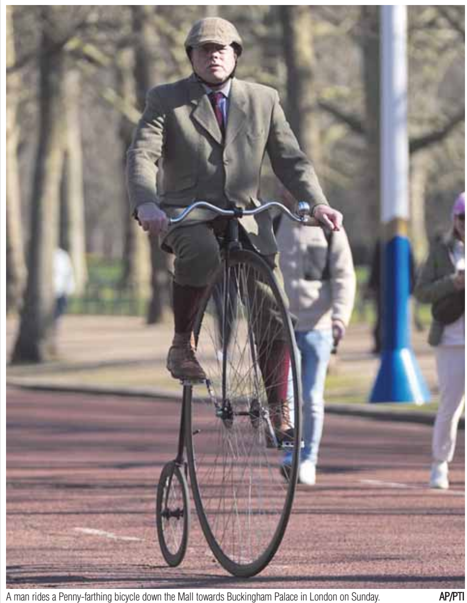
A man rides a Penny-farthing bicycle down the Mall towards Buckingham Palace in London on Sunday.

The NPC would meet along with the advisory body, the Chinese People's Political Consultative Conference (CPPCC), to deliberate on the state of the economy and the country's strategic challenges arising out of US President Donald Trump starting a second stint in power.