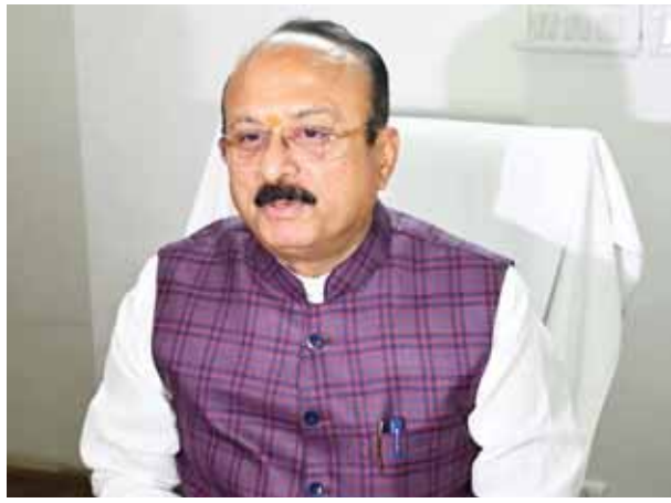
Delhi Minister Ashish Sood addresses a press conference

STAFF REPORTER ■ NEW DELHI As the summer is approaching, Delhi's Power Minister Ashish Sood, held a crucial meeting on Sunday at the Delhi Secretariat with senior officials of the Power Department and power companies operating in the national Capital and asked to implement the Summer Action Plan - 2025 with immediate effect. The Power Department and all stakeholders were instructed to take immediate and effective measures to ensure uninterrupted power supply as the summer season approaches. The India Meteorological Department (IMD) predicted that India is likely to witness above-normal maximum temperatures in most parts between March and May. The IMD declares a heat wave when the maximum is over 40°C in the plains, and also the temperature is 4.5 degrees Celsius or more above normal. Summer Action Plan