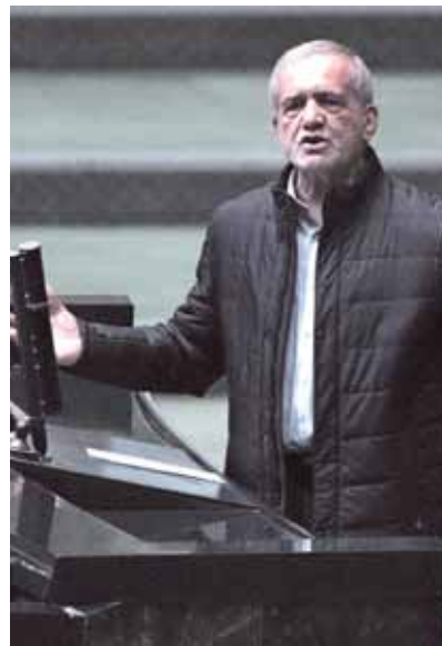
Iranian President Masoud Pezeshkian speaks during an open session of parliament for impeachment of his Finance Minister Abdolnasser Hemmati, in Tehran, Iran, on Sunday.

Iran's parliament on Sunday impeached the country's economy minister and voted to remove him from office, amid growing concerns over the crashing rial and accusations of mismanagement. Parliament Speaker Mohammad Bagher Qalibaf announced that 182 out of 273 lawmakers voted to dismiss Abdolnasser Hemmati, just six months after President Masoud Pezeshkian's government took office. Pezeshkian, who defended Hemmati, emphasised that the government is locked in a tough battle with the West. He called for greater unity and cooperation from Parliament to face these challenges. The decision comes amid rising tensions over Iran's nuclear program and worsening relations with the West. Iran's economy has been severely affected by international sanctions, especially after the US withdrew from the 2015 nuclear deal. In 2015, the rial was worth 32,000 to the dollar, but by the time Pezeshkian took office in July, it had plummeted to 584,000 to the dollar. Recently, it dropped even further, with exchange shops in Tehran trad-