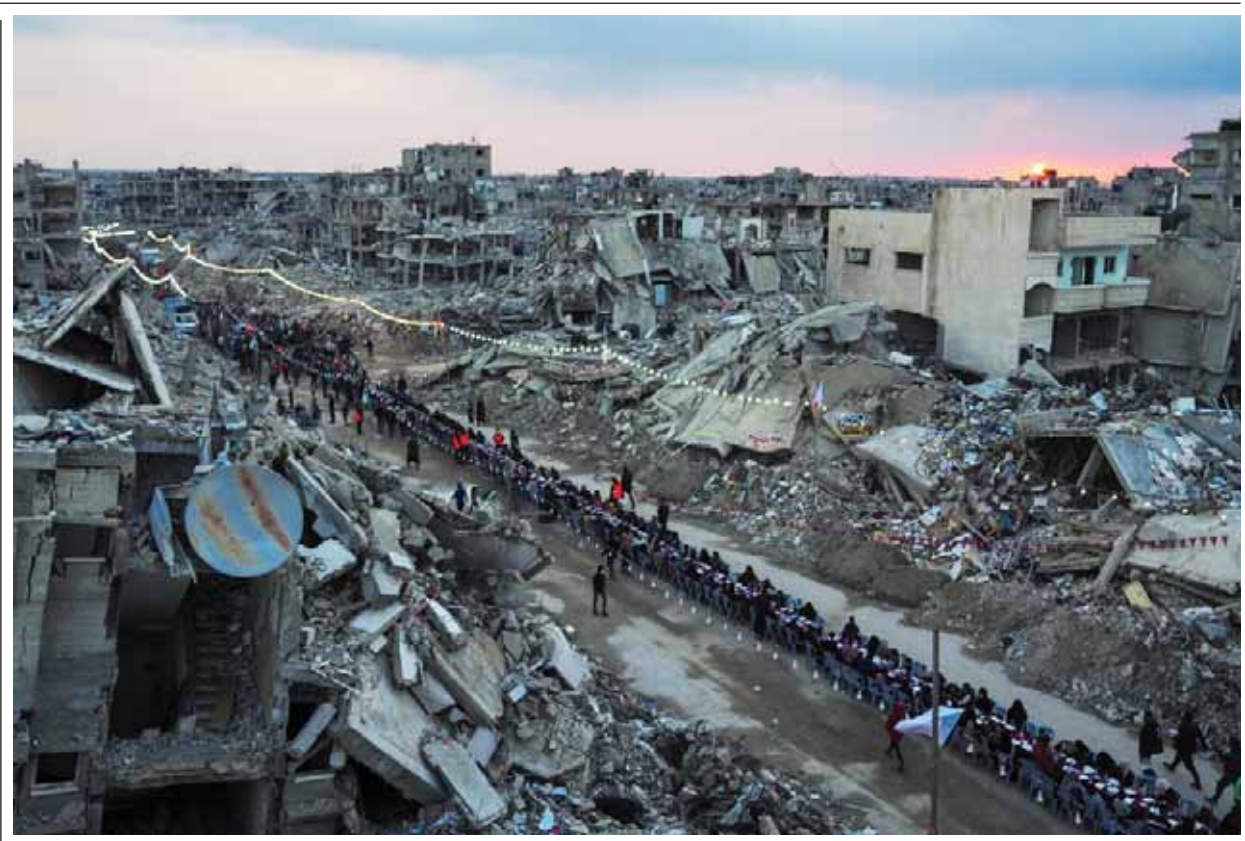
As the sun sets, Palestinians sit at a large table surrounded by the rubble of destroyed homes and buildings as they gather for iftar, the fast-breaking meal, on the first day of Ramadan in Rafah, southern Gaza Strip.

ing 930,000 rials for each dollar. During the impeachment proceedings, Mohammad Qasim Osmani, a lawmaker supporting Hemmati, argued that rising inflation and exchange rates were not the fault of the current government or Parliament. He pointed to the budget deficit left by the previous administration, which he said contributed to the economic instability. Osmani also cited recent geopolitical events as factors that undermined public confidence, causing many people to convert their savings into foreign currency, which in turn further devalued the rial. Hemmati acknowledged the tough economic climate during his five months in office, including a 10% reduction in inflation. However, he acknowledged that inflation remained high, standing at 35%. He assured lawmakers that his team was working hard to address the issue, but warned that the process would take time. This latest development is another chapter in Iran's ongoing political and economic struggles as the country continues to navigate a complex relationship with the international community.