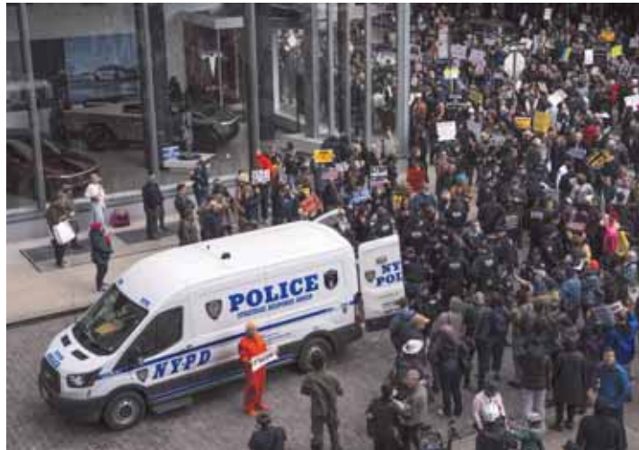
Demonstrators are arrested by NYPD officers during a protest against Elon Musk and Tesla outside of a Tesla showroom in New York.