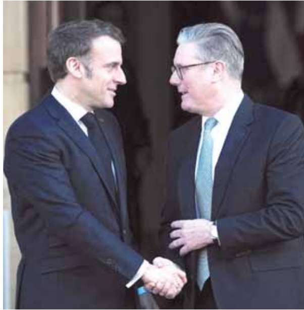
Britain's Prime Minister Keir Starmer (right) greets French President Emmanuel Macron as he arrives for a summit on Ukraine at Lancaster House in London, on Sunday.

British Prime Minister Keir Starmer says Britain, France and Ukraine have agreed to work on a ceasefire plan to present to the United States. Starmer says the plan emerged after talks among the four countries' leaders following Ukrainian President Volodymyr Zelenskyy's Oval Office blowout with US President Donald Trump. The prime minister told the BBC he believes the US president wants a durable peace in Ukraine. He repeated his assertion that American security guarantees will be needed to make it stick. Starmer is hosting a summit of European leaders in London on Sunday to discuss Ukraine. It was supposed to cap a week of whirlwind diplomacy advancing the prospect of peace in Ukraine. But a summit of European leaders on Sunday has been overshadowed by the extraordinary scolding by US President Donald Trump of Ukrainian President Volodymyr Zelenskyy at the White House on Friday for being ungrateful for US support. The London meeting has now taken on greater importance in defending the war-torn ally and shoring up the continent's defenses. "There's a real problem for European leaders to pick up the pieces and try and move forward," Peter Ricketts, the former British national security adviser, told BBC radio on Saturday. "It's going to be a damage limitation exercise. It's going to have to be an exercise in where