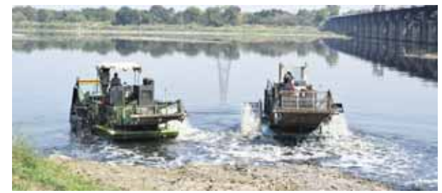
Cleaning work underway at the Yamuna river

STAFF REPORTER ■ NEW DELHI With the BJP government in Delhi focusing on the rejuvenation of the Yamuna, plans are afoot to start a cruise service in the river, between Sonia Vihar and Jagatpur, the NCR Planning Board (NCRPB) has proposed a Yamuna Water Taxi Project with tentative stations located at Madanpur Khadar, Film City, Nizamuddin and ITO.