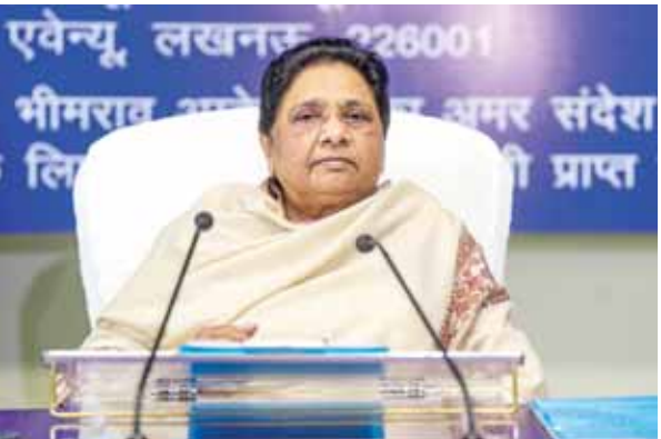
BSP supremo Mayawati during a meeting with party's senior office bearers and state presidents at the party office, in Lucknow