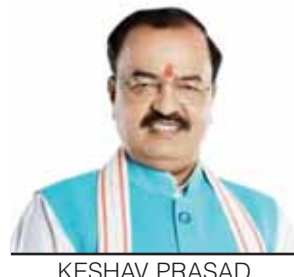
KESHAV PRASAD MAURYA

Under the Pradhan Mantri Kisan Samman Nidhi Yojana, Rs 79,500 crore have been distributed to farmers while Rs 496 crore have also been disbursed under the Pradhan Mantri Fasal Bima Yojana. The state's sugarcane production capacity has also increased from 72 tonnes to 85 tonnes per hectare, boosting the income levels of farmers. The recently presented Budget will not only take the development of the state to new heights but will also transform rural India. From roads to digital infrastructure, farmers to industry, and women empowerment to a bright future for the youth, this Budget has been able to ensure that the needs of every section of society are taken care of. With the Pradhan Mantri Awas Yojana and schemes aimed at boosting the rural economy and infrastructure, Uttar Pradesh is rapidly moving towards fulfilling the dream of a self-reliant India. I am confident that this Budget will realise the vision of 'growth and progress' of UP and propel the state towards the exalted status of the most developed state in the country. (The writer is Deputy Chief Minister of UP; views are personal)