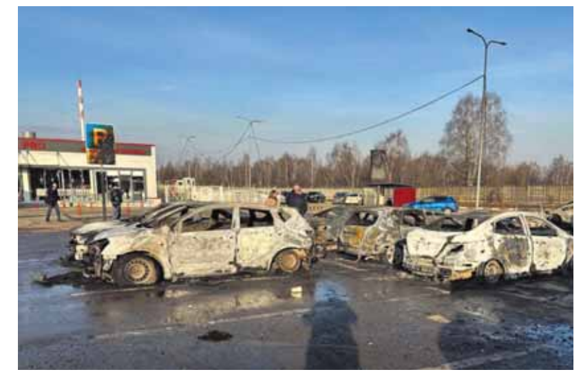
This photo released by Moscow Region Governor Andrei Vorobyev official telegram channel shows damaged and burnt cars following a Ukrainian drone attack in Domodedovo, outside Moscow, Russia on Tuesday

The governor of the Moscow region surrounding the capital, Andrei Vorobyov, said that one person was killed and nine