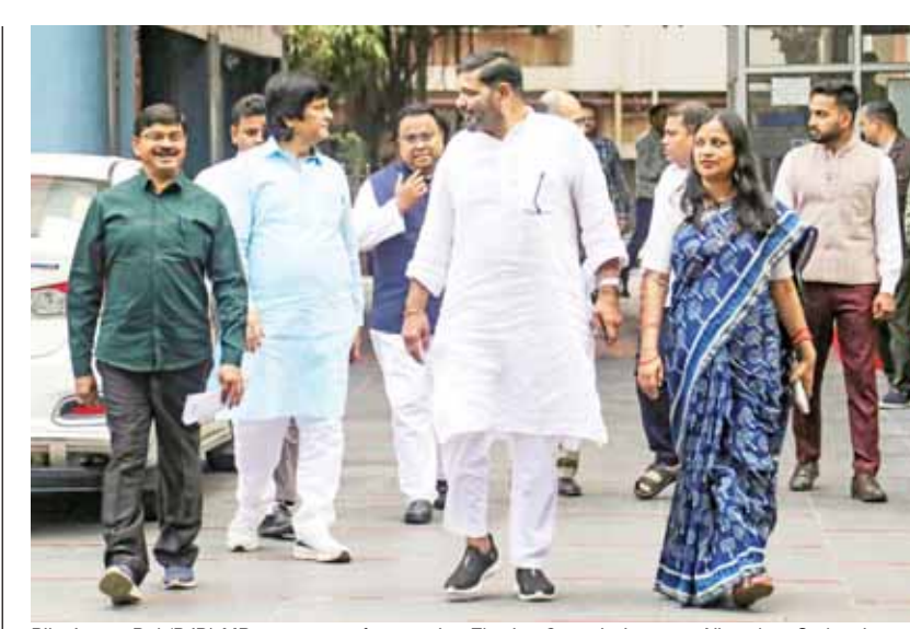
Biju Janata Dal (BJD) MPs come out after meeting Election Commissioners at Nirvachan Sadan, in

Aizawl, Mizoram recorded the lowest winter-average PM2.5 level at 7 μg/m , making it the cleanest city in the analysis. Moreover, none of the 238 cities analysed met the World Health Organisation's (WHO) guideline of 5 μg/m , emphasising the scale of air quality challenges. 'Winter' refers to the period from October 1, 2024, to February 28, 2025 (winter 2024-25).