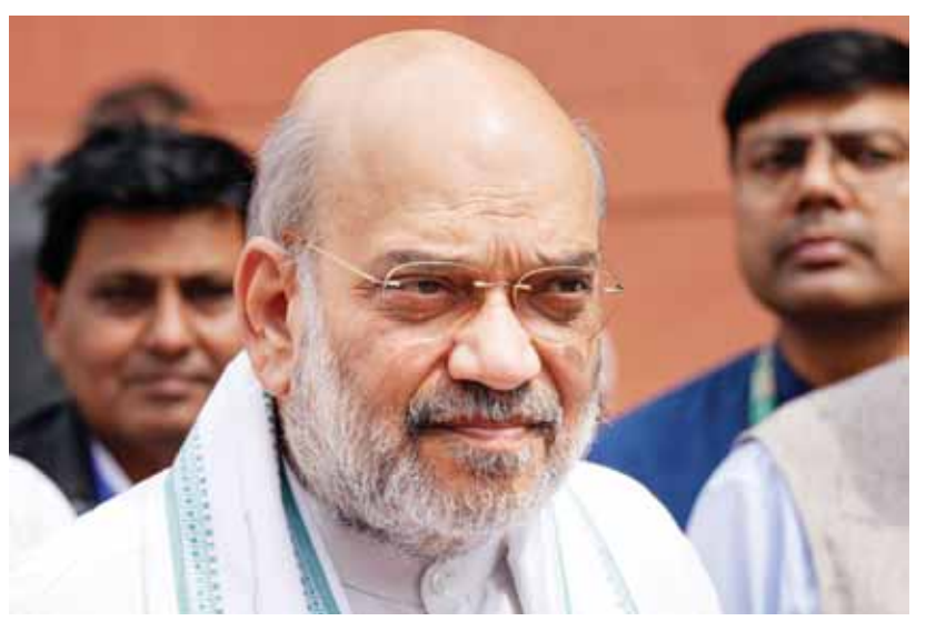
Home Minister Amit Shah during the Budget session of Parliament in New Delhi on Tuesday

Violence, bandhs, drugs, blockades, and regionalism fragmented the region, causing a divide not only between the northeast