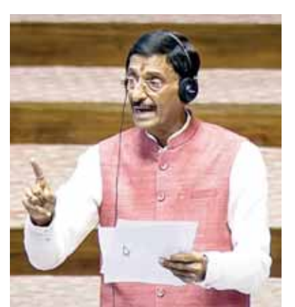
Sanjay Seth speaks in the Rajya Sabha during the Budget session of Parliament

The BJP MP said a special fast track court should be set up for speedy justice to victims. He also suggested setting