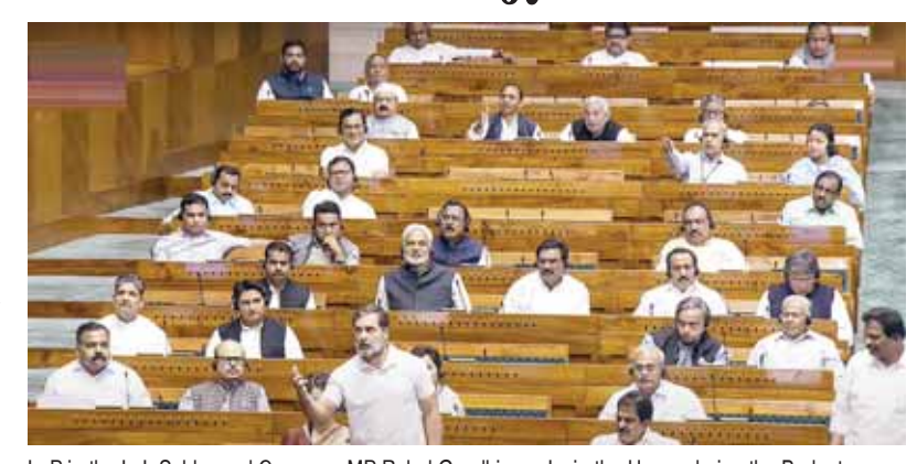
LoP in the Lok Sabha and Congress MP Rahul Gandhi speaks in the House during the Budget session of Parliament, in New Delhi, Monday

sition MPs giving notices under Rule 267 despite elaborate ruling by the chair a "vicious design to demean the institution of Parliament". "They are not interested in debate. They want to give an impression that the government does not want to answer queries or enter into a debate. "The government under Prime Minister Narendra Modi is ready to discuss anything under this roof. But there are certain rules and regulations for debates in