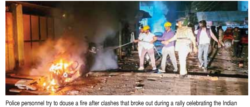
team's victory in the Champions Trophy final in Mhow in Madhya Pradesh on Sunday

against some of them, he said. Some more FIRs will also be registered in connection with the incidents on the basis of people's statements, the collector said, adding that some videos related to the incidents have also surfaced. "Peace is