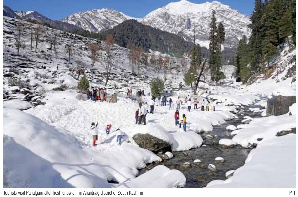
Tourists visit Pahalgam after fresh snowfall, in Anantnag district of South Kashmir.