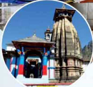
श्री केदारनाथ जी का शीतकालीन प्रवास आकाशेश्वर मन्दिर ऊखीमठ (रुद्रप्रयाग)