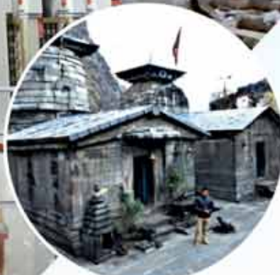
श्री बदरीनाथ जी का शीतकालीन प्रवास योगध्यान बह्नी मन्दिर पांडुकेश्वर (चमोली)