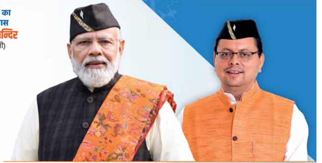
नरेन्द्र मोदी प्रधानमंत्री