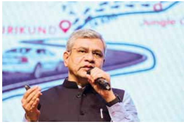
Union Minister Ashwini Vaishnav briefs on union cabinet decisions

A decision related to livestock health has been taken in the Cabinet. High-quality medicines will be provided under the Pashu Aushadhi component of the scheme," I and B Minister Ashwini Vaishnav said after the Union Cabinet meeting chaired by Prime Minister Narendra Modi in New Delhi.