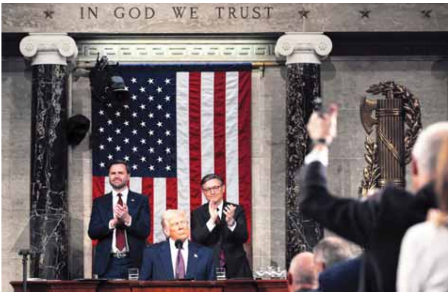
President Donald Trump addresses a joint session of Congress at the Capitol in Washington on Tuesday.

US President Donald Trump said he has received "strong signals" from Russia that it is ready for peace and that Ukrainian President Volodymyr Zelenskyy has written to him saying his country is ready to come to the negotiating table and also sign an agreement on minerals and security. Trump made these remarks Tuesday night in an address to the Joint Session of Congress, the first of his second term in the White House. "I'm also working tirelessly to end the savage conflict in Ukraine. Millions of Ukrainians and Russians have been needlessly killed or wounded in this horrific and brutal conflict with no end in sight," Trump said.