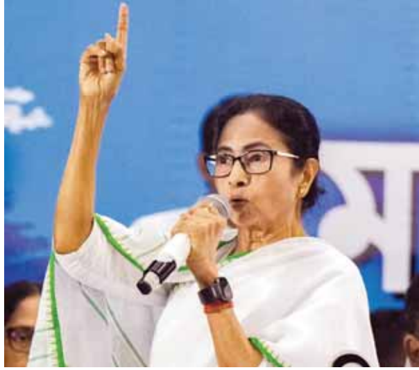
West Bengal CM Mamata Banerjee during a TMC's workers meeting