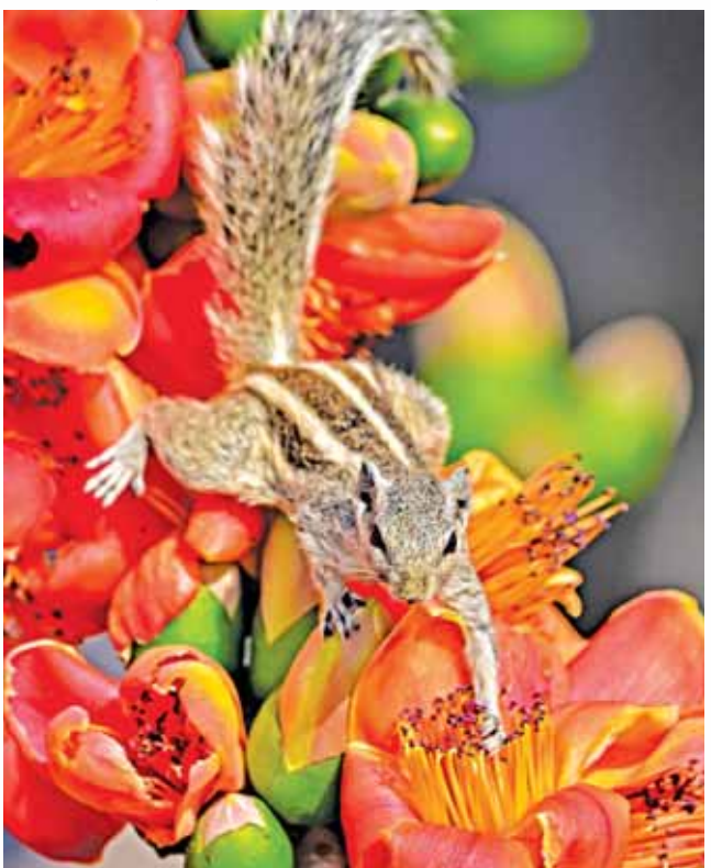
A squirrel perches on a branch of red-silk cotton tree while feeding on flowers in New Delhi