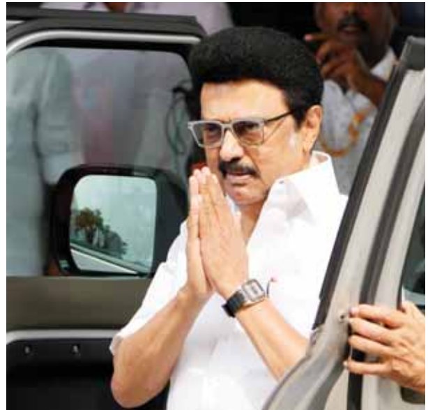
Tamil Nadu CM MK Stalin participates in all-party meeting to discuss proposed delimitation of LS seats PTI

Tamil Nadu Chief Minister MK Stalin on Wednesday alleged that the Bharatiya Janata Party (BJP)-led union government paid mere lip service to Tamil language for the sake of votes and dubbed the ruling party at the Centre as Tamil's "enemy." Writing to party workers as part of his series on the theme of "all-time opposition to Hindi imposition," Stalin recalled DMK founder leader CN Annadurai's views on the issue. Decades ago, Anna had said that the party's objective is not to oppose Hindi, but to get equal recognition to Indian languages including Tamil. While the BJP claims that Prime Minister Narendra Modi held Tamil in high esteem and that the three-language formula is for the growth of languages of the states, the difference in allocation of funds for Tamil and Sanskrit would make it pretty clear that they are "enemies" of Tamil, Stalin alleged. As per the Union Education Ministry's data, during the period between 2014 and 2023, the union government allotted ₹2,435 crore to the Central Sanskrit University and the National Sanskrit University. During the same period, only ₹167 Crore was allotted to Central Institute of Classical Tamil. Fund allocation and expenditure has increased manifold for the promotion of Sanskrit and Hindi. "The union government, out-and-out, is functioning with a feeling of