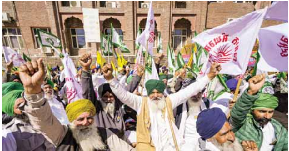
Members of Samyukta Kisan Morcha stage protest against Punjab CM Bhagwant Mann-led government in Amritsar