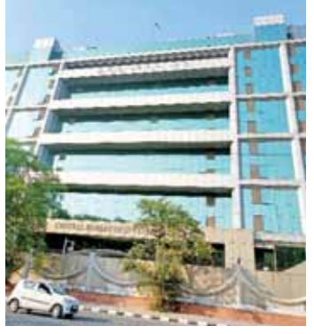
A day earlier in a massive crackdown the CBI arrested 26 railway officials, including a senior divisional electrical engineer of East Central Railway for allegedly leaking papers of a departmental examination and seized ₹1.17 crore cash during its raids. The railway officials were arrested on Monday night for allegedly leaking papers of

DEEPAK KUMAR JHA ■ NEW DELHI After several rail officials were nabbed in a Central Bureau of Investigation (CBI) trap pertaining to cases related to jobs, promotions in the Indian Railway networks, the Railway Board in a high level meeting on Wednesday decided that all departmental promotion examinations for the 13 Lakh rail employees will be done by the Railway Recruitment Board (RRB) via centralised examination through Computer Based Test (CBT) aptitude. Sources in the railways said all zonal railways will have to prepare a calendar for the examination and all examinations will be conducted on the basis of a calendar only. "This has been decided after a long experience of transparent, fair, and highly appreciated examinations conducted by RRB in recent years," sources said.