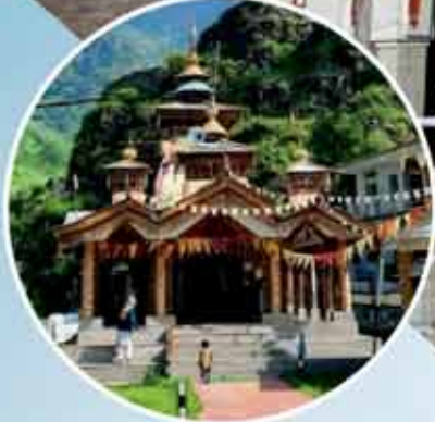
माँ यमुना का शीतकालीन प्रवास यमुना मंदिर खरसाली (उत्तरकाशी)