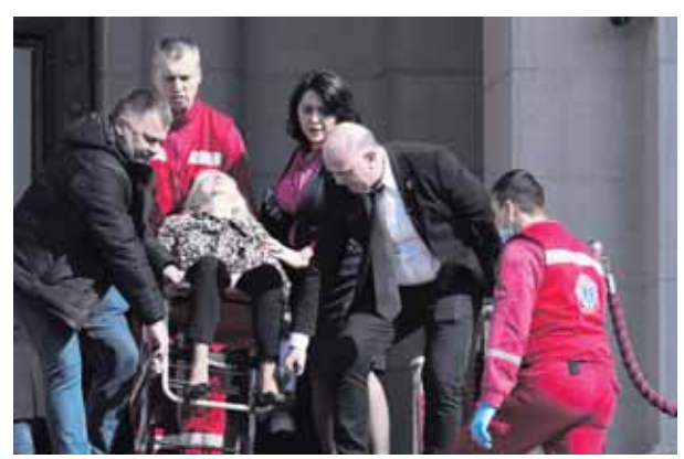
Medics carry a lawmaker injured after chaos erupted during a Serbia's parliament session in Belgrade, Serbia, on Tuesday

Belgrade (PTI): At least three lawmakers were injured on Tuesday, one of them seriously, after chaotic scenes in Serbia's parliament, during which smoke bombs and flares were thrown, further fuelling political tensions in the Balkan country. Lawmakers were scheduled to vote on a law that would increase funding for university education, but opposition parties said the ruling majority was also planning to approve dozens of other decisions. They said this was illegal and that lawmakers should first confirm the resignation of Prime Minister Milos Vucevic and his government. Chaos erupted about an hour after the parliamentary session started, with opposition lawmakers blowing whistles and holding up a banner reading "Serbia has risen so the regime would fall" Hundreds of opposition supporters rallied outside the parliament building during the session. Video footages from the assembly hall showed a clash first between lawmakers and later flares and smoke bombs being