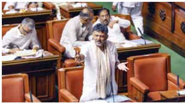
Karnataka Deputy CM DK Shivakumar speaks during the Budget session of the Karnataka Assembly in Bengaluru

The Karnataka Legislative Assembly was briefly disrupted on Tuesday as the opposition BJP alleged discrimination, claiming that cameras covering the proceedings were not showing their party members when they spoke in the House. They pointed out that during the coverage, the cameras focused on the Speaker whenever opposition MLAs were speaking, whereas this was not the case when ruling party legislators or ministers took the floor. When the Leader of Opposition, R Ashoka, pressed for a discussion on the alleged irregularities in the Karnataka Public Service Commission (KSPSC), his deputy Arvind Bellad pointed out to the Speaker that Ashoka was not being shown on television screens while speaking. He questioned whether there were instructions not to cover the opposition, saying, "The whole House is shown, the