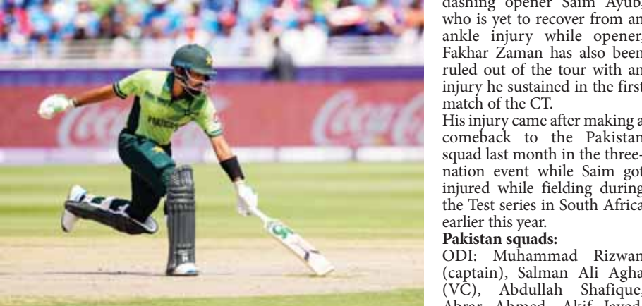
Babar Azam plays a shot during the Champions Trophy 2025 cricket match

T20 World Cup, Pakistan are set to play a minimum of five T20Is in the Asia Cup 2025 and three T20Is each against West Indies (away in July), Afghanistan (home in August), Ireland (home in September), South Africa (home in September/October), Sri Lanka (home in November) and Australia (home in January 2026). The board said that Mohammad Rizwan will continue leading the ODI side as Pakistan build for the 2027 ODI World Cup, which will take place in Namibia, South Africa and Zimbabwe. The board also confirmed that openers Fakhar Zaman and Saim Ayub were not considered for either format for the New Zealand tour on medical advice. "Fakhar suffered a left lower intercostal muscle sprain during Pakistan's ICC Champions Trophy opener against New Zealand, while Saim is recovering from a right ankle fracture sustained on the first day of the Cape Town Test against South Africa in January," the board said. It confirmed that both are expected to be fully fit for the Pakistan Super League 10, starting in Rawalpindi on 11 April.