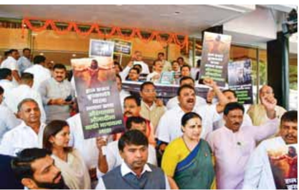
Members of the ruling Mahayuti stage a protest against Samajwadi Party MLA Abu Asim Azmi during the Budget session of Maharashtra Assembly in Mumbai

The issue of SP MLA Abu Asim Azmi's remarks eulogising Mughal emperor Aurangzeb rocked both houses of the Maharashtra legislature on Tuesday, with members of the ruling Mahayuti demanding his suspension and charging him with treason. Both the houses were adjourned over the issue. The development came on a day when the opposition Maha Vikas Aghadi planned to corner the government over the resignation of NCP minister Dhananjay Munde. As proceedings of both the houses began, the Mahayuti members started raising slogans seeking action against Azmi, who is the Samajwadi Party's state president. They claimed Azmi was a descendant of Aurangzeb, who tortured Maratha king Chhatrapati Sambhaji Maharaj and brutally killed him. Deputy Chief Minister and Shiv Sena head Eknath Shinde led the attack on Azmi both in the legislative council and assembly. In the council, the former CM said Azmi also made objectionable statements in