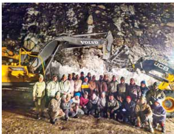
Rescue team members pose for group photos after the conclusion of Mana Rescue operations following an avalanche in Chamoli district