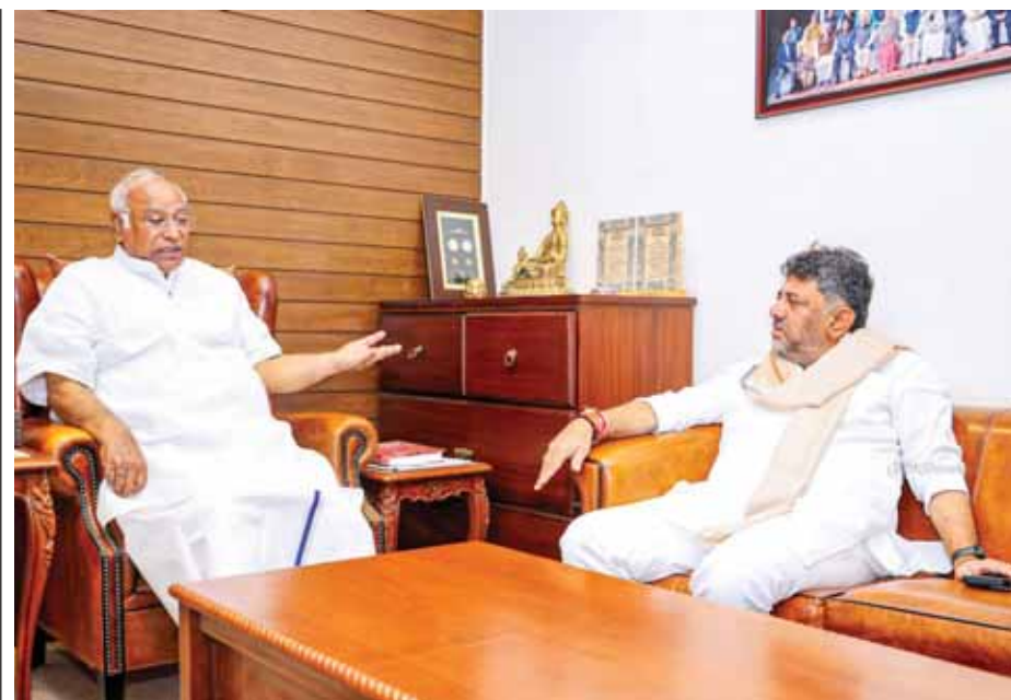
Congress President Mallikarjun Kharge with Karnataka Deputy Chief Minister DK Shivakumar in Bengaluru

Centre has planned to restore degraded ecosystems and land across more than eight Lakh hectares of reserved forest in the first phase of its ambitious Aravalli Green Wall project, which aims to create a green buffer around the Aravalli mountain range in northwest India. According to the detailed action plan for Aravalli restoration, the government is likely to spend an estimated ₹16,053 Crore in the first phase. Stretching 700 kilometres from Gujarat to Delhi, the Aravalli range acts as a natural barrier against desertification, preventing the expansion of the Thar desert and protecting cities such as Delhi, Jaipur and Gurugram. The Aravallis, India's oldest mountain range, are the source of important rivers such as the Chambal, Sabarmati and the Luni. Its forests, grasslands and wetlands support endangered plant and animal species. However, deforestation, min-