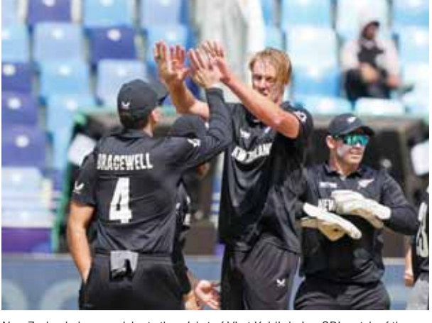
New Zealand players celebrate the wicket of Virat Kohli during ODI match of the ICC Champions Trophy in Dubai

PTI ■ LAHORE Loaded with world-class talent but haunted by the underachievers' tag at ICC events, New Zealand and South Africa will square off in an evenly-matched second semifinal of the Champions Trophy here on Wednesday. South Africa and New Zealand have won the Champions Trophy once each in 1998 and 2000 respectively but the tournament was called the ICC Knockout Trophy at that time and didn't carry the significance which it has now. While South Africa would look to shed their big tournament "chokers" tag, the Kiwis will also be desperate to lay their hands on a title after having finished second best twice in the ODI World Cup (2015 and 2019) and once in the T20 World Cup (2021). Led by Mitchell Santner, New Zealand finished behind India in Group A, while South Africa topped Group B ahead of