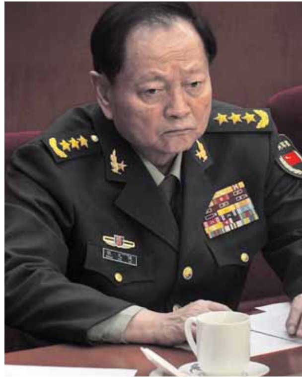
Gen Zhang Youxia, vice chairman of China's Central Military Commission attends the opening of the Chinese People's Political Consultative Conference held at the Great Hall of the People in Beijing, on Tuesday

list and take corresponding measures against them. They include a number of companies linked to defence and security besides AI, aviation, IT and "dual-use" items that carry both civilian and military applications. Also, China has initiated legal action against the US under the World Trade Organisation (WTO) dispute settlement mechanism regarding the latter's latest tariff increase on Chinese products, the Ministry of Commerce said Tuesday. China's retaliatory actions followed after the US imposition of an additional 10-per cent tariff on products imported from China, effective from March 4. The unilateral imposition of tariffs by the US undermines the multilateral trading system, increases the burden on American businesses and consumers, and erodes the foundation of China-US economic and trade cooperation, the commission said. Trump's announcement of a second round of 10 per cent tariffs on Chinese exports to the US coincides with the opening of China's annual parliament session. The twin sessions consisting of the Parliament, the National People's Congress and the advisory council, the China People's Political Consultative Conference (CPPCC) were opened on Tuesday. While NPC began with the