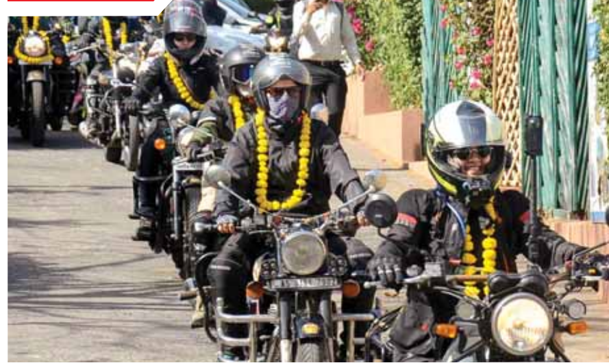
Women participate in bike rally 'Queens on the Wheel', in Bhopal.