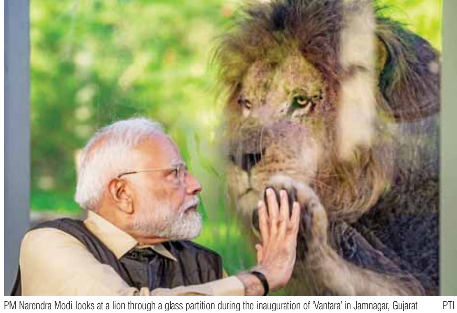
PM Narendra Modi looks at a lion through a glass partition during the inauguration of 'Vantara' in Jamnagar, Gujarat.