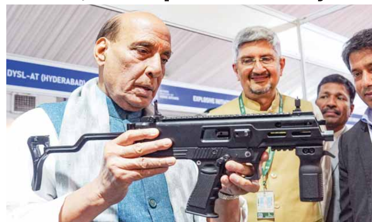
Defence Minister Rajnath Singh visits an exhibition of products for internal security and disaster relief operations in New Delhi