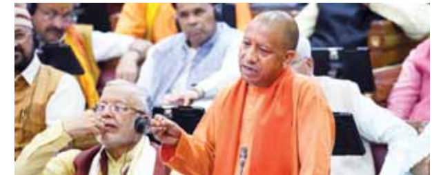
UP CM Yogi Adityanath speaks in the House during Budget session of state Assembly in Lucknow