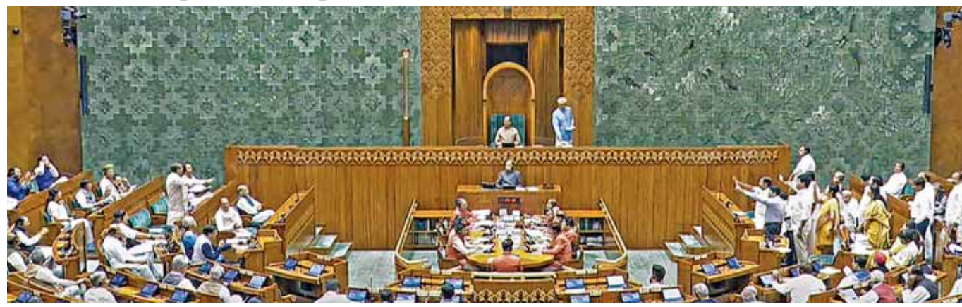
DEEPAK KUMAR JHA ■ New Delhi

Parliament resumed its second leg of Budget Session with a massive confrontation between the Centre and the Opposition over the implementation of National Education Policy (NEP) in Tamil Nadu (TN), instigating a fresh round of language row. Face-off was also witnessed in the Lok Sabha and the Rajya Sabha over alleged discrepancies in voter lists leading to several adjournments. At one point, Speaker Om Birla cautioned the Opposition to either to fall in line or face strict action. DMK MP Kanimozhi filed a notice for breach of Parliamentary privilege against Education Minister Dharmendra Pradhan in response to his remarks on the NEP issue and TN Chief Minister MK Stalin. The TN government and the Centre have been at loggerheads over the implementation of the new NEP and the three-language formula. Pradhan criticised the TN government for refusing to implement the NEP and Stalin doing a "U-turn" on the issue for "politics," which drew protests from the DMK and other Opposition members disrupting proceedings in the upper house. "They are dishonest and they are ruining the future of the students of Tamil Nadu ... They are misleading the people," Pradhan said while replying to a query on the Centre not releasing funds for the PM Schools for Rising