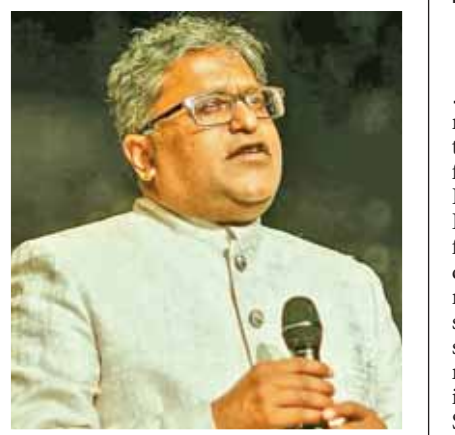
PIONEER NEWS SERVICE/AGENCIES ■ New Delhi/Port Vila