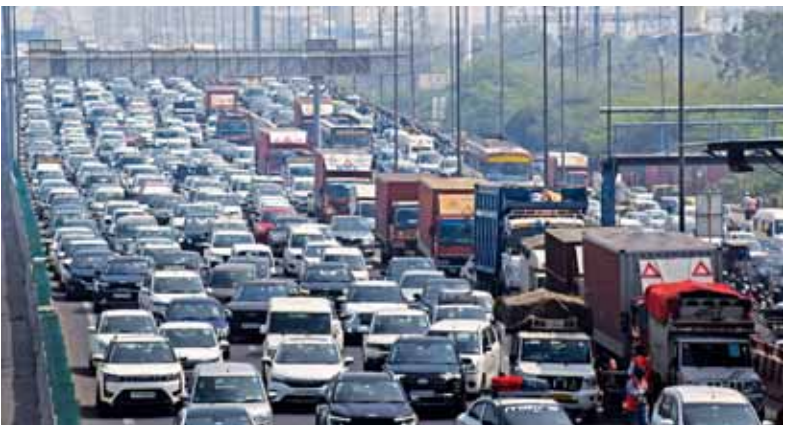
PIONEER NEWS SERVICE ■ New Delhi