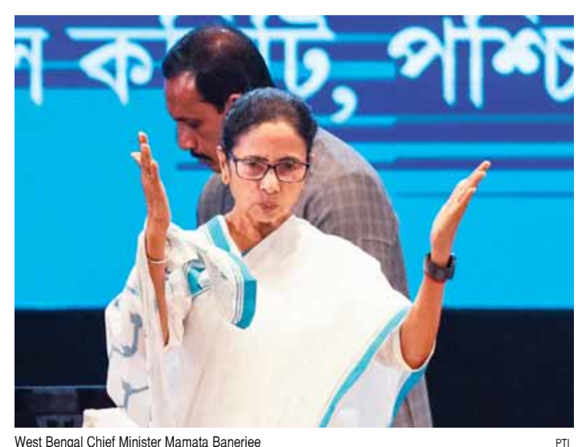
West Bengal Chief Minister Mamata Banerjee

leader and Minister Firhad Hakim) — in order to divert the attention of the people from other more important issues and