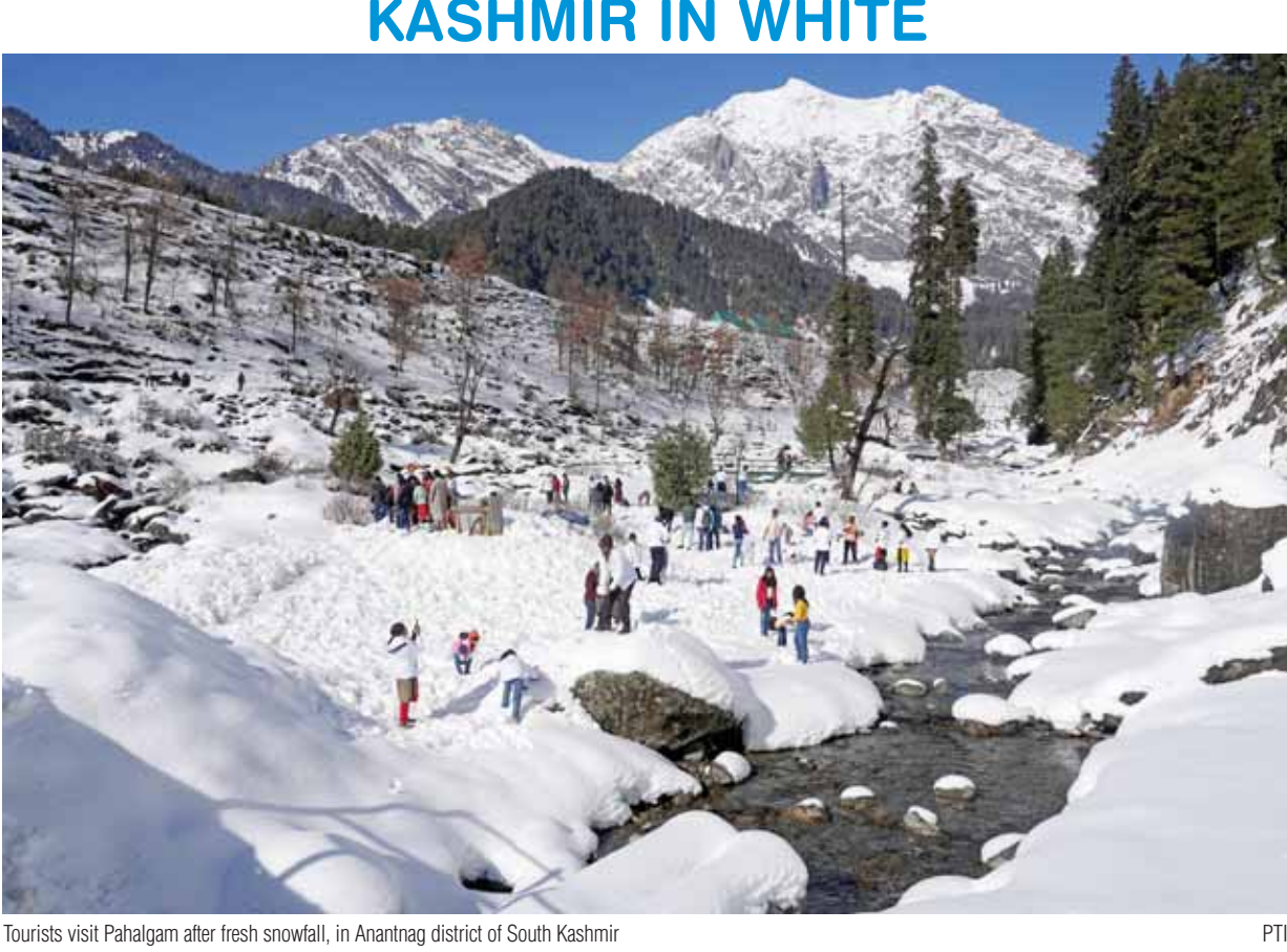
Tourists visit Pahalgam after fresh snowfall, in Anantnag district of South Kashmir

spending is amounted to three times that of India's $681,210 Crore ($78.8 Billion). China's defence budget figures are viewed by critics with scepticism in the light of massive military modernisation, including building aircraft carriers, rapid construction of advanced naval ships and modern stealth aircraft being carried out at a feverish pitch by the Chinese military. Announcing the annual budget which includes the defence spending at the opening of the annual session of China's parliament, the National People's Congress (NPC) Chinese Premier Li Qiang said last year, China