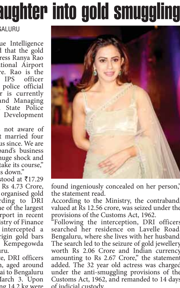
found ingeniously concealed on her person," the statement read. According to the Ministry, the contraband, valued at Rs 12.56 crore, was seized under the provisions of the Customs Act, 1962. "Following the interception, DRI officers searched her residence on Lavelle Road, Bengaluru, where she lives with her husband. The search led to the seizure of gold jewellery worth Rs 2.06 Crore and Indian currency amounting to Rs 2.67 Crore," the statement added. The 32 year old actress was charged under the anti-smuggling provisions of the Customs Act, 1962, and remanded to 14 days of judicial custody.

and began working as a house cleaner in Noida, Uttar Pradesh, and various parts of Delhi. She settled in the Pitampura area, where she remained undetected, living discreetly. Multiple FIRs were registered against her at Sonua Police Station, Jharkhand, under serious charges, including criminal conspiracy, attempt to murder, and waging war against the state. She will be produced before the court for further legal proceedings. The arrestee is wanted in case FIR No. 19 dated 11.04.2020, registered under Section 147/148/149/307/353/120B/121/121-A Indian Penal Code, 1860, read with Section 25(1A)/25(1B)(a)/35 Arms Act, read with Section 3/4/17 Explosive Act, read with Section 10/13 Unlawful Activities (Prevention) Act, Police Station Sonua, Jharkhand. On 26.03.2023, the court of SDJM (P), Chaibasa, Jharkhand, issued a Non-Bailable Warrant for the arrest of the lady accused (R). Accused arrestee "R" has been booked by way of Kalandara under Section 41.1 Code of Criminal Procedure, 1973 read with Section 35(1)(C) Bharatiya Nagarik Suraksha Sanhita 2023.