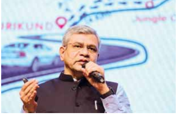
Union Minister Ashwini Vaishnav briefs on union cabinet decisions.

The Cabinet on Wednesday approved changes to the ₹3,880 Crore Livestock Health and Disease Control Programme (LHDC) to include the distribution of high-quality and affordable generic veterinary medicines to farmers. The total budget provided for the Livestock Health and Disease Control Programme (LHDCP) was ₹3,880 Crore for 2024-25 and 2025-26. A decision related to livestock health has been taken in the Cabinet. High-quality medicines will be provided under the Pashu Aushadhi component of the scheme, I and B Minister Ashwini Vaishnav said after the Union Cabinet meeting chaired by Prime Minister Narendra Modi in New Delhi.