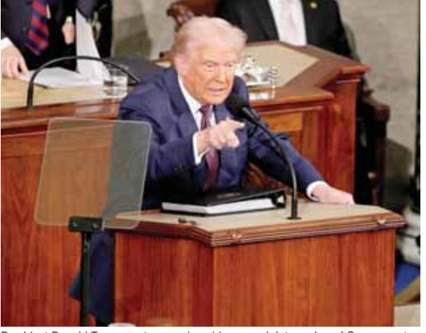
President Donald Trump gestures as he addresses a joint session of Congress at the Capitol in Washington

PRESS TRUST OF INDIA ■ NEW YORK/WASHINGTON US President Donald Trump criticised the high tariffs charged by India and other countries, terming them as "very unfair" and announced reciprocal tariffs from April 2 on nations that impose levies on American goods. Trump made these remarks in an address to the Joint Session of the Congress on Tuesday. It was the first address of his second term in the White House. On January 20, Trump was sworn in as the 47th President of the US. "If you don't make your product in America, however, under the Trump administration, you will pay a tariff and in some cases, a rather large one," Trump said. "Other countries have used tariffs against us for decades and now it's our turn to start using them against those other countries. On average, the European Union, China, Brazil, India, Mexico and Canada - have you heard of them? And countless other nations charge us tremendously higher tariffs than we charge them," Trump said. "It's very unfair. India charges us auto tariffs higher than 100 per cent." In February, President