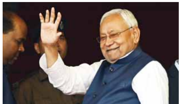
Bihar CM Nitish Kumar during Budget session of the Assembly in Patna

The Nitish Kumar government in Bihar on Monday tabled a ₹3.17 Lakh Crore budget in the assembly, the last before the state goes to polls later this year. Presenting the budget on the floor of the assembly, Deputy Chief Minister Samrat Choudhary, who holds the finance portfolio, told the House that the budget, the total size of which was ₹38,169 Crore more than the last fiscal, is inspired by Prime Minister Narendra Modi's "margdarshan" (guidance) and the CM's "netritva" (leadership). "The government has received enormous support from the people of the state in its bid to achieve the goal of a 'samridhi Bihar', which is essential to achieve the prime minister's goal of a 'vksit Bihar'.