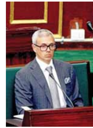
J and K CM Omar Abdullah during the first day of the Budget session of the state Assembly