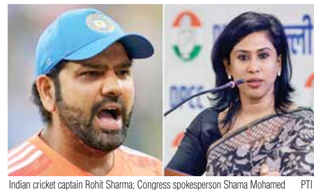
Indian cricket captain Rohit Sharma; Congress spokesperson Shama Mohamed