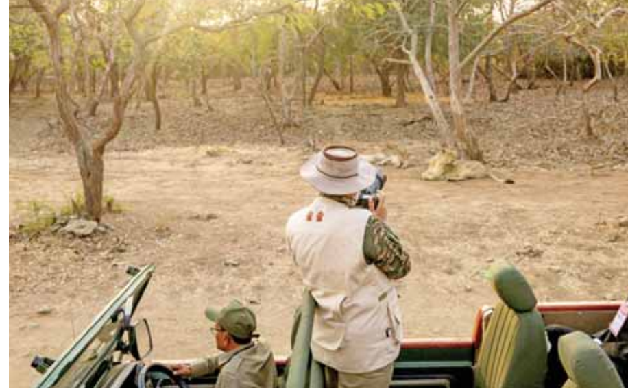
Prime Minister Narendra Modi during a lion safari at the Gir Wildlife Sanctuary on the occasion of the World Wildlife Day in Gujarat's Junagadh district