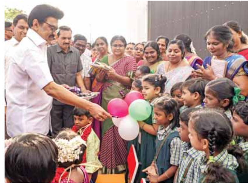
Stalin has claimed a higher population would ensure more MPs as delimitation will be population-based PTI

PIONEER NEWS SERVICE ■ CHENNAI/NEW DELHI