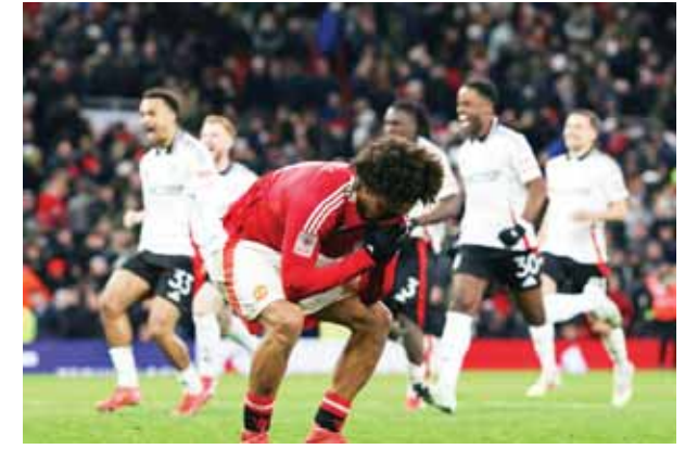
PTI ■ MANCHESTER