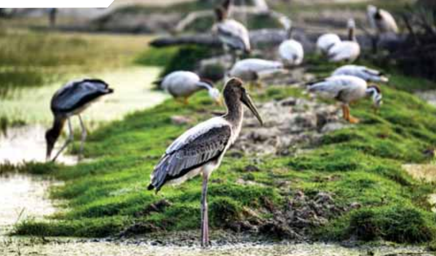
Painted storks at Keoladeo National Park, in Bharatpur