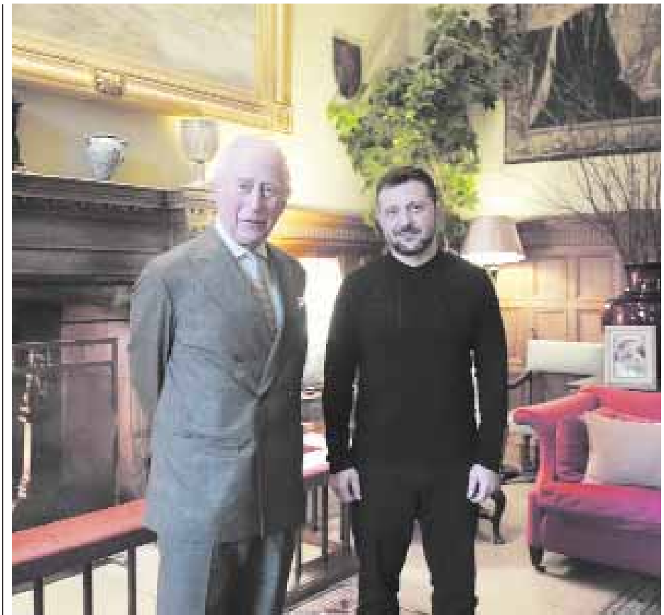
Britain's King Charles III and Ukrainian President Volodymyr Zelenskyy, right, pose for a picture during their meeting at the Sandringham Estate in Norfolk, England, on Sunday.

Within 12 hours of Starmer's return from Washington, the talk of peace seemed to collapse as Trump and Vice President JD Vance berated Zelenskyy for challenging Trump's assertions that Putin could be trusted. During his Sunday press conference, Starmer rejected the suggestion that the US was no longer a reliable ally. "There are no two countries as closely aligned as our two countries and our defence, our security and intelligence is intertwined in a way no two other countries are, so it's an important and reliable ally for us," he said. Starmer does not trust Putin: Starmer told the BBC before the summit that he does not trust Russian President Vladimir Putin but does trust Trump. Italian Premier Giorgia Meloni said she was sorry for what happened with Zelenskyy in Washington. Meloni is both a strong Ukraine supporter and — as head of a far-right party — she is a natural ally of Trump. She was the only European leader to attend his inauguration.