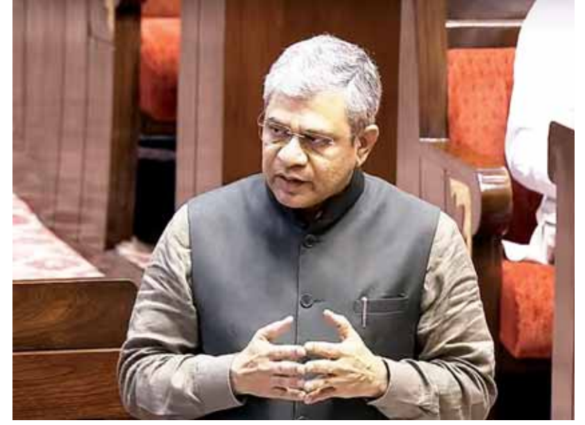
Railways Minister Ashwini Vaishnaw speaks in the Rajya Sabha during the Budget session of Parliament, in New Delhi on Monday

Alleging that under the proposed legislation there is no liberty and sovereignty of the Railway Board, he said, "The very freedom of the Railway Board is lost