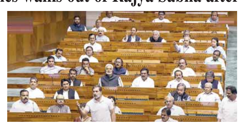
LoP in the Lok Sabha and Congress MP Rahul Gandhi speaks in the House during the Budget session of Parliament, in New Delhi, Monday

sition MPs giving notices under Rule 267 despite elaborate ruling by the chair a "vicious design to demean the institution of Parliament". "They are not interested in debate. They want to give an impression that the government does not want to answer queries or enter into a debate. "The government under Prime Minister Narendra Modi is ready to discuss anything under this roof. But there are certain rules and regulations for debates in