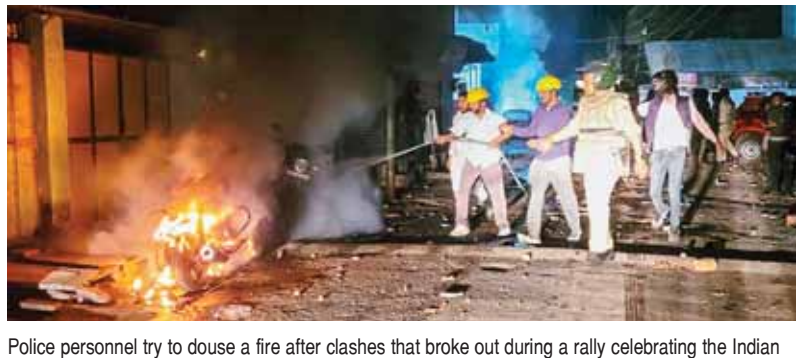
team's victory in the Champions Trophy final in Mhow in Madhya Pradesh on Sunday

taken against some of them, he said. Some more FIRs will also be registered in connection with the incidents on the basis of people's statements, the collector said, adding that some videos related to the incidents have also surfaced. "Peace is