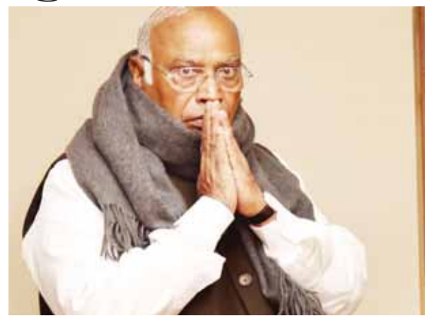
Congress President Mallikarjun Kharge

Congress President Mallikarjun Kharge on Wednesday attacked Prime Minister Narendra Modi over rise in gold loans and said his remarks during the Lok Sabha polls campaign about 'stealing of mangalsutras' have come true with women forced to mortgage their gold ornaments under his rule. Citing media reports, Kharge claimed that between 2019 and 2024, four crore women mortgaged their gold and took a loan of ₹4.7 Lakh Crore. In 2024, 38 per cent of the total loans taken by women are from gold loans, he said. In February 2025, RBI data showed that gold loans increased by a whopping 71.3 per cent in a year, the Congress chief said. "Narendra Modi ji, you had talked about 'stealing of mangalsutras'. That has now come true. In your rule, women have been forced to mortgage their gold ornaments. First you made women's 'stri-dhan' disappear by demonetisation, now due to inflation and falling household savings, they are forced to mortgage their