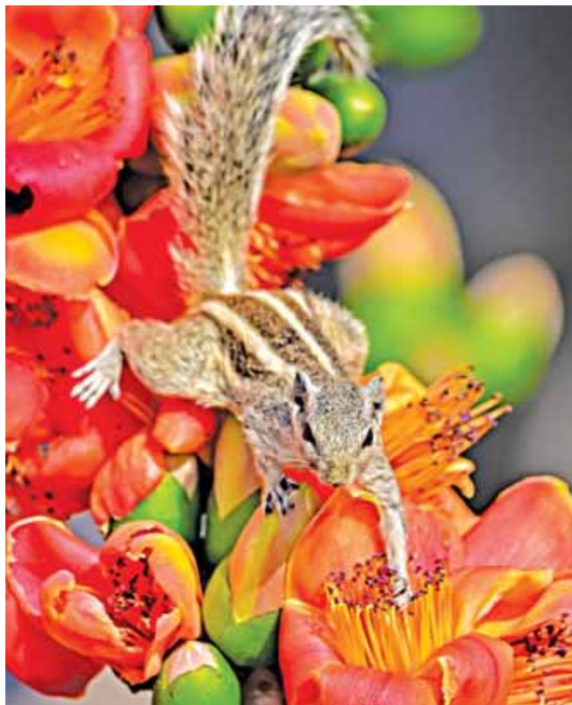
A squirrel perches on a branch of red-silk cotton tree while feeding on flowers in New Delhi