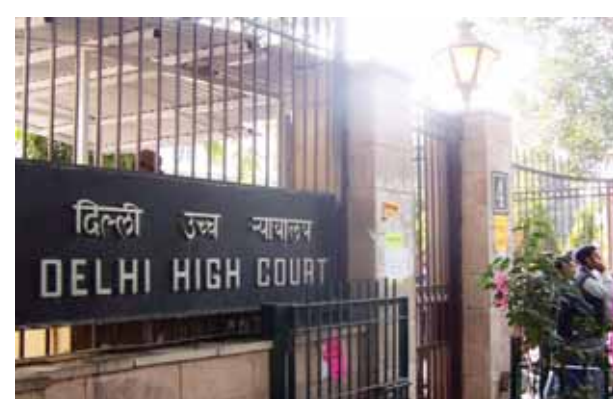
Delhi High Court

direction to the Ministry of Home Affairs to prepare rules for a centralised database of marriage registration. The Supreme Court, in February 2006, ruled that all marriages, irrespective of their religion, be compulsorily registered and directed the Centre and all states to frame and notify rules for this within three months. Pursuant to the top court's directions, the Delhi government issued an order on April 21, 2014 containing certain provisions for compulsory registration of marriage. The order is known as "Delhi (Compulsory Registration of Marriage) order, 2014. However, various deficiencies and lacunae were pointed out in the rules by the petitioner, who said the state and the Central governments were informed about it.