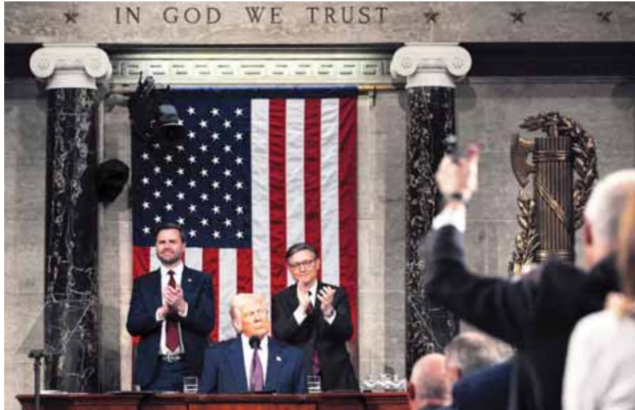
President Donald Trump addresses a joint session of Congress at the Capitol in Washington on Tuesday.

US President Donald Trump said he has received "strong signals" from Russia that it is ready for peace and that Ukrainian President Volodymyr Zelenskyy has written to him saying his country is ready to come to the negotiating table and also sign an agreement on minerals and security. Trump made these remarks Tuesday night in an address to the Joint Session of Congress, the first of his second term in the White House. "I'm also working tirelessly to end the savage conflict in Ukraine. Millions of Ukrainians and Russians have been needlessly killed or wounded in this horrific and brutal conflict with no end in sight," Trump said.