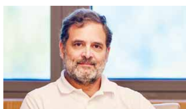
Congress leader Rahul Gandhi during a meeting in New Delhi

Drawing attention to the financial difficulties faced by railway porters, Congress leader Rahul Gandhi on Wednesday said they risked their lives to help people during the stampede at the New Delhi Railway Station last month and yet their voice was not being heard. The former Congress president, who posted on his YouTube channel a video of his recent interaction with porters at the New Delhi railway station, asserted that he would fight for their rights. Gandhi also urged people to share suggestions on the 'Awaaz Bharat Ki' portal to improve crowd management and strengthen security. "We will listen to the voice