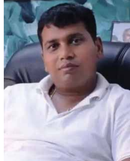
Gandhamardan Loading Agency Cooperative Society scam. The extensive raids, which