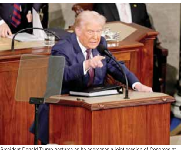
President Donald Trump gestures as he addresses a joint session of Congress at the Capitol in Washington.

product in America, however, under the Trump administration, you will pay a tariff and in some cases, a rather large one," Trump said. "Other countries have used tariffs against us for decades and now it's our turn to start using them against those other countries. On average, the European Union, China, Brazil, India, Mexico and Canada - have you heard of them? And countless other nations charge us tremendously higher tariffs than we charge them," Trump said. "It's very unfair. India charges us auto tariffs higher than 100 per cent." In February, President