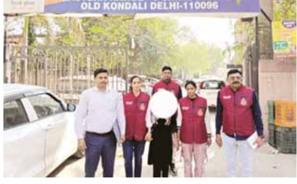
individuals, including 40-50 women, 4-5 children of her age. Her involvement in Naxal activities began when she was 10-years-old. She joined the notorious Naxalite camp Bhakpa Maovadi Ugarvadi Jeevan Kandulna. During her time there, she underwent a rigorous and intense training regimen for five years, where she was groomed as a trained Naxalite. Between 2018 and 2020, she actively participated in three encounters with the Jharkhand Police -- first in Kolhan (2018), then in Porahat (2019), and later in Sonua (2020) alongside her