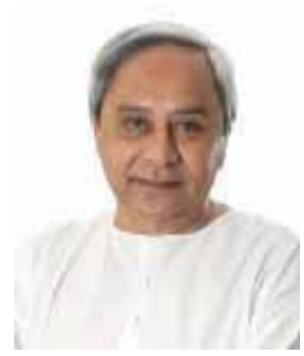
Minister Naveen Patnaik on Wednesday skipped the official Biju Jayanti celebration

PNS ■ BHUBANESWAR Biju Janata Dal (BJD) president and former Chief Minister Naveen Patnaik on Wednesday skipped the official Biju Jayanti celebration