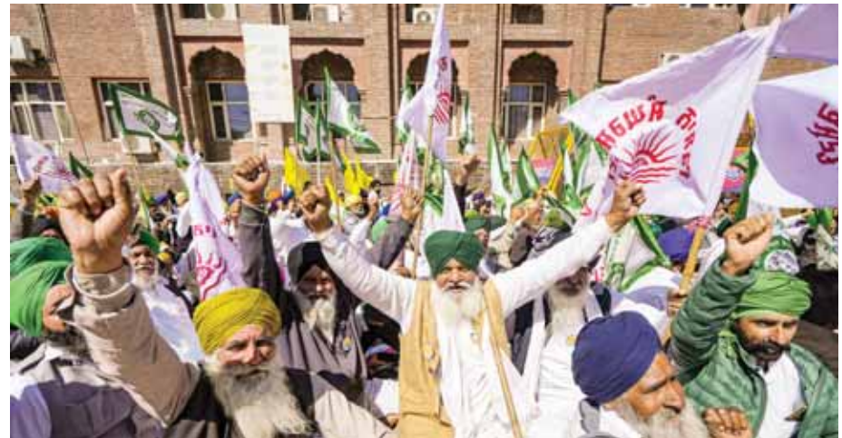
Members of Samyukta Kisan Morcha stage protest against Punjab CM Bhagwant Mann-led government in Amritsar