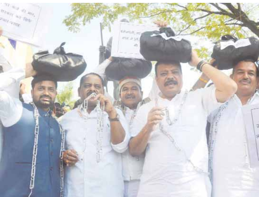
Leader of Opposition Umang Singhar with party MLAs during a demonstration against the state government over increasing debt on the state...