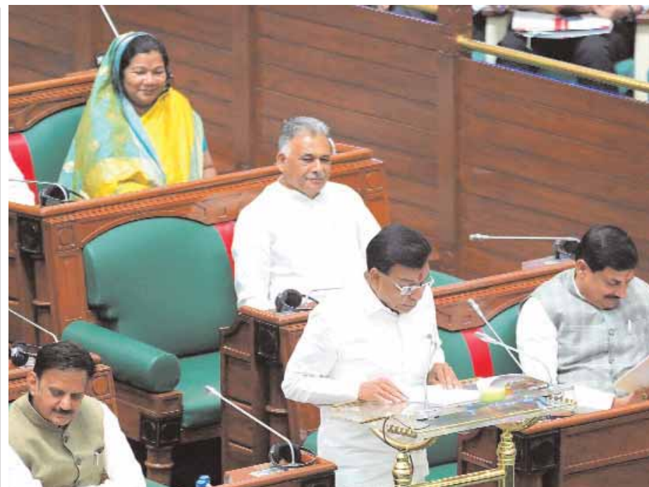
Madhya Pradesh Deputy Chief Minister and Finance Minister Jagdish Dewda presents the annual budget 2025-26 in the House during the budget session of Madhya Pradesh State Assembly, in Bhopal on Wednesday. Madhya Pradesh Chief Minister Mohan Yadav also seen in pic.

Bhavan and Vrindavan Gram Yojana, Rs 10 crore for the Shri Krishna Pathway initiative, Rs 100 crore under the Majra-Tola Road Scheme to enhance rural connectivity, and Rs 80 crore to improve transportation services across the state. In the sphere of women's empowerment and social welfare, the Madhya Pradesh government has made substantial commitments. The gender budget has doubled over the past six years, with Rs 18,669 crore allocated to the Ladli Behna Yojana, a flagship scheme for women's welfare. Additionally, ₹1,183 crore has been set aside for the Ladli Laxmi Yojana, which focuses on supporting the education and well-being of girl children, while Rs 720 crore is allocated for maternity assistance under the Mukhyamantri Shramik Seva initiative.