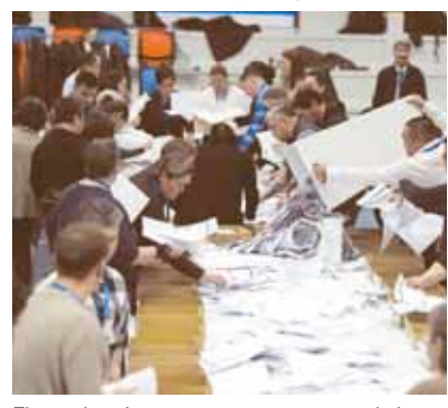
Electoral workers prepare to count votes during parliamentary elections in Nuuk, Greenland.

Greenland, a self-governing region of Denmark, straddles strategic air and sea routes in the North Atlantic and has rich deposits of the rare earth minerals needed to make everything from mobile