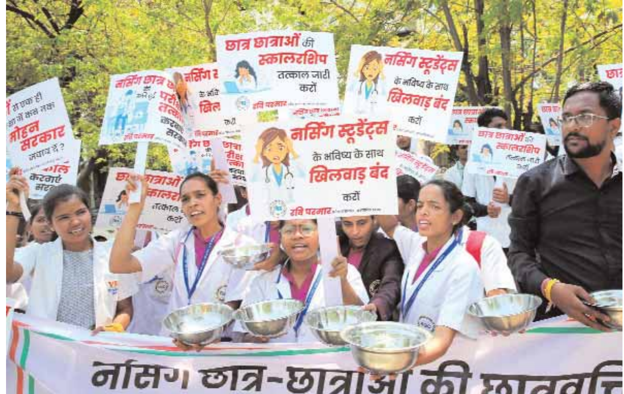
NSUI medical wing activists with nursing students march towards the state assembly during a demonstration demanding to conduct exams and scholarship for the students, including several other demands, during the budget session of the MP State Assembly in Bhopal on Wednesday.

alerted. Following the information, a Dial-100 police team arrived at the spot and took the body into their custody. The body has been sent to the mortuary at Hamidia Hospital for post-mortem examination. Initial observations suggest that the child was born one to two days ago. Police officials stated that no identification marks, hospital seals, or chits were found on the body to indicate where the child was born. To identify the person responsible for abandoning the newborn, authorities are reviewing CCTV footage from the surrounding area. "The exact cause of death will only be confirmed after the postmortem report is received. We are scanning the CCTV cameras nearby to identify those involved," a police official said.