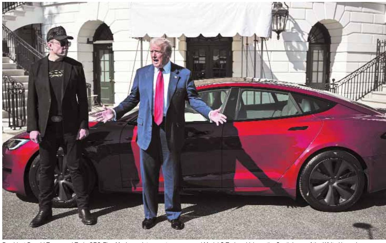
President Donald Trump and Tesla CEO Elon Musk speak to reporters near a red Model S Tesla vehicle on the South Lawn of the White House in Washington.