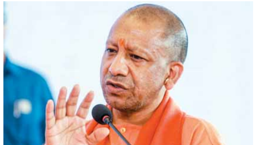
Uttar Pradesh Chief Minister Yogi Adityanath

Tensions in Sambhal have been high since last November following a court-ordered survey of a mosque believed by some to have been built over a demolished temple. The Chief Minister strongly criticised those who admire Aurangzeb, calling it a "mental distortion." Citing historical accounts, he noted that Aurangzeb imprisoned his own father, denied him water, and killed his brother. Taking a jibe at Aurangzeb's supporters, he remarked, "If you admire him so much, name your children after him and be ready to suffer his cruelty." CM Yogi also launched a scathing attack on the opposition, accusing past governments of mishandling the Kumbh