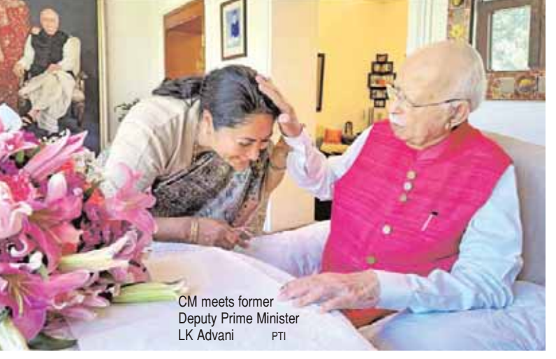
CM meets former Deputy Prime Minister LK Advani