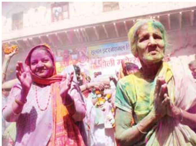
Widows in Vrindavan celebrate Holi

The transformation of Vrindavan's widows began in 2012, when the Supreme