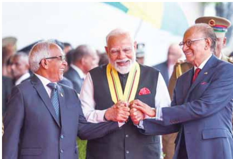
PM Modi after being conferred highest civilian award of Mauritius

The officials cited several instances of Modi being the main guest at signature events of several countries to assert that the prime minister as a "global leader is