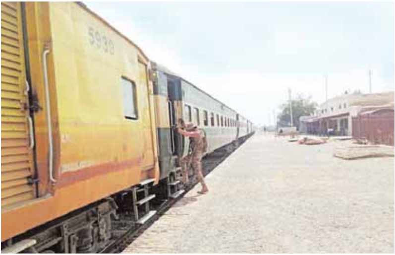
A paramilitary soldier takes position at a railway station near the attack site of a passenger train by insurgents in Mushkaf in Bolan district of Pakistan's southwestern Balochistan province

This is the first time the BLA or any insurgent group in the Balochistan province have resorted to hijacking a passenger train, although in the last year, they have stepped up their attacks on securi-