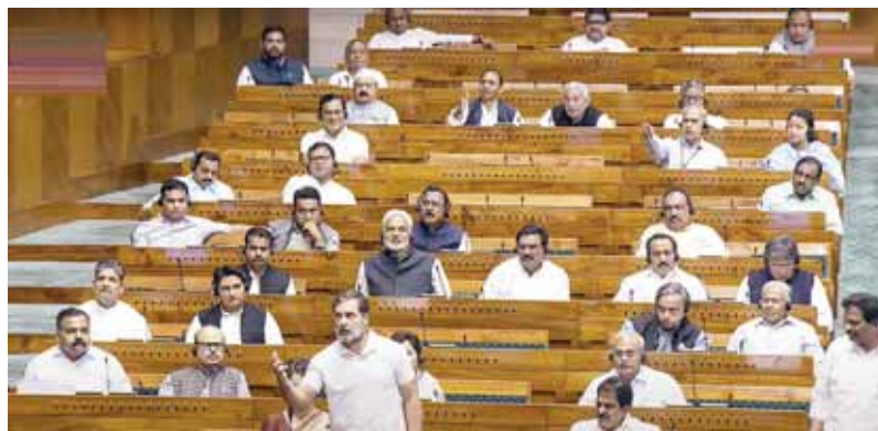
LoP in the Lok Sabha and Congress MP Rahul Gandhi speaks in the House during the Budget session of Parliament, in New Delhi, Monday