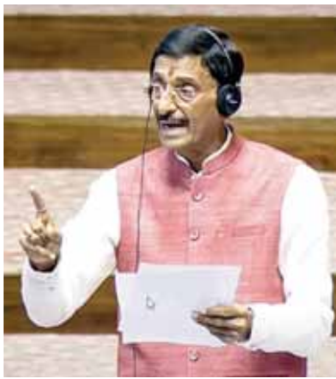
Sanjay Seth speaks in the Rajya Sabha during the Budget session of Parliament

The BJP MP said a special fast track court should be set up for speedy justice to victims. He also suggested setting