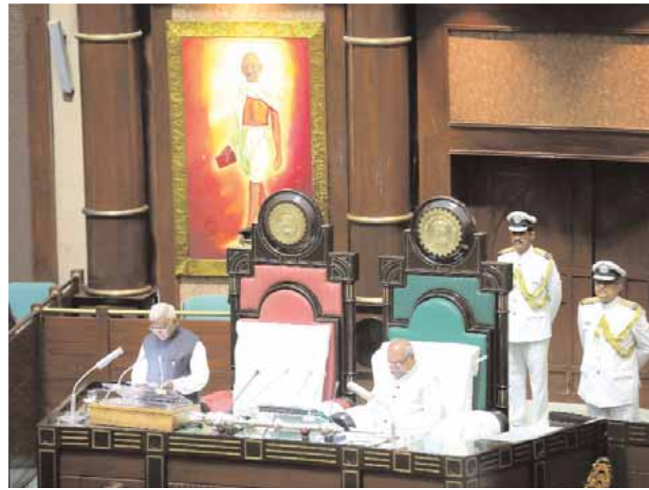
Madhya Pradesh Governor Mangubhai Patel addresses the house on the first day of the budget session of Madhya Pradesh State Assembly in Bhopal on Monday.

ment is also providing financial support for taming bovine family members. An assistance of Rs 40 per bovine family member per day is available, up from the earlier Rs 20 per member. The Governor said meritorious students received laptops and scooters. A total of 89,710 students received a combined amount of Rs 224 crore in their accounts, while 7,832 students received scooters free of cost. Referring to three medical colleges started by Prime Minister Narendra Modi, the Governor said the Madhya Pradesh government will start 12 new medical colleges on a public-private partnership model. On housing, he highlighted that 36 lakh houses had been completed, and another 13 lakh houses were under construction.