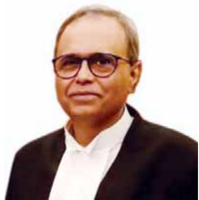
Justice Joymalya Bagchi