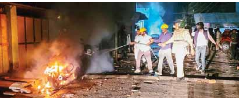
Police personnel try to douse a fire after clashes that broke out during a rally celebrating the Indian team's victory in the Champions Trophy final in Mhow in Madhya Pradesh on Sunday

Some more FIRs will also be registered in connection with the incidents on the basis of people's statements, the collector said, adding that some videos related to the incidents have also surfaced. "Peace is