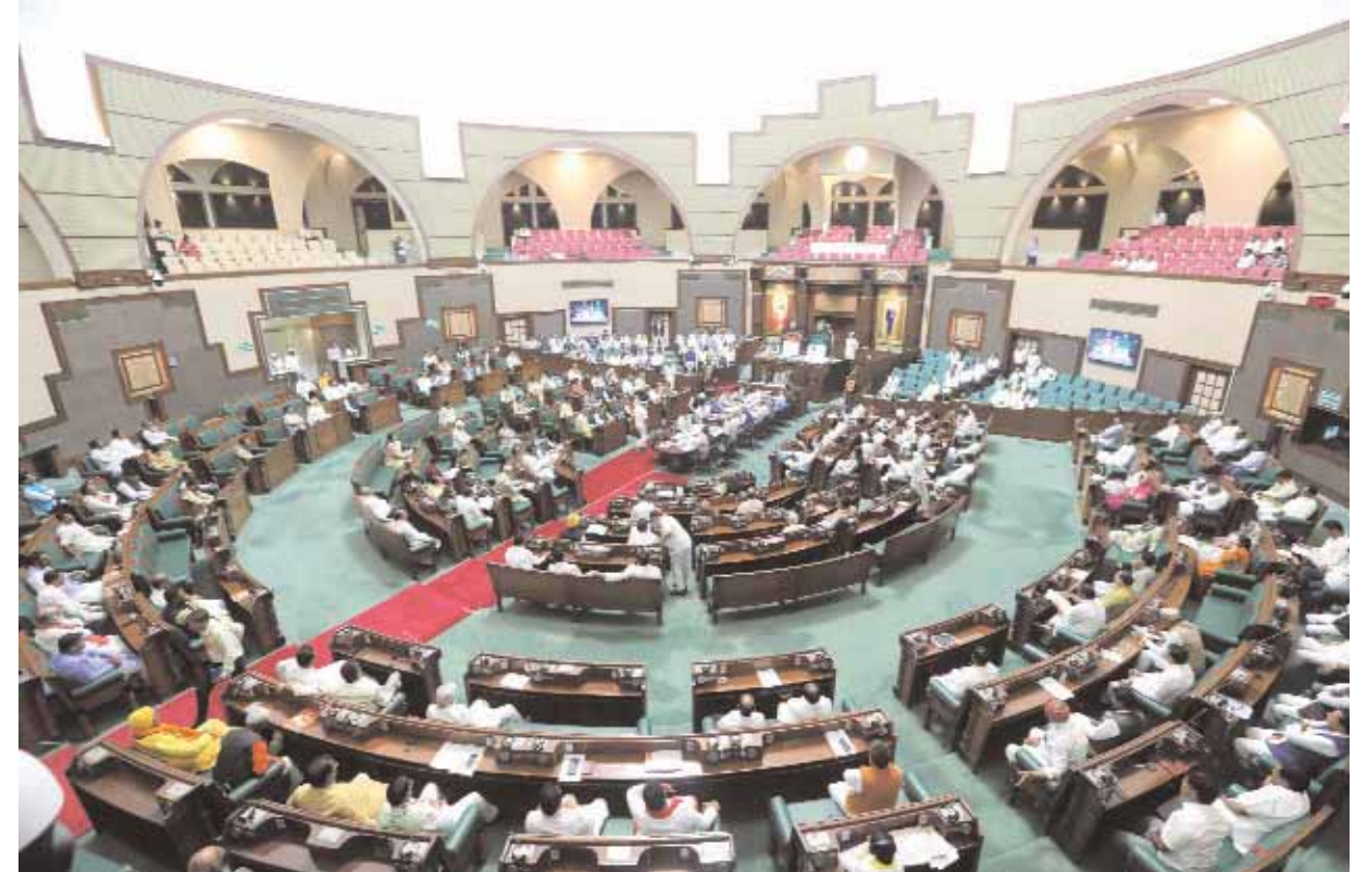
Madhya Pradesh Governor Mangubhai Patel addresses the house on the first day of the budget session of Madhya Pradesh State Assembly in Bhopal on Monday.

During his interaction with the media at the Assembly premises, Chief Minister Yadav highlighted that the success of the Global Investor Summit has propelled the state towards industrialization and other developmental activities. In this context, a new Tiger Reserve is being inaugurated in the Chambal region, boosting tourism-related activities. Additionally, he mentioned the Ken-Betwa Link Project and the Parvati-Kalisindh-Chambal Link Project, which will ensure water availability in the Sheopur, Morena, Gwalior, Shivpuri, and the entire Chambal belt. This will not only secure irrigation and drinking water supply but also provide water for industrial activities, thereby facilitating the expansion of agricultural and industrial development in the region.