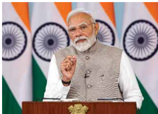
Prime Minister Narendra Modi addresses post-budget webinar on boosting job creation

Prime Minister Narendra Modi on Wednesday said that the day is not far when India will turn a $5 trillion economy as he urged all stakeholders to invest in people, economy, and innovation to create jobs and boost growth. Speaking in a post-Budget webinar on employment, Modi said the government has provided skill training to 3 crore youth since 2014 and decided to upgrade 1,000 ITIs and set up five centres of excellence. Referring to an IMF report of February 2025, Modi noted that between 2015 and 2025, India grew by 66 per cent, making the country a $ 3.8 trillion economy. Observing that the country's growth surpassed that of several major economies, he said "the day is not far when