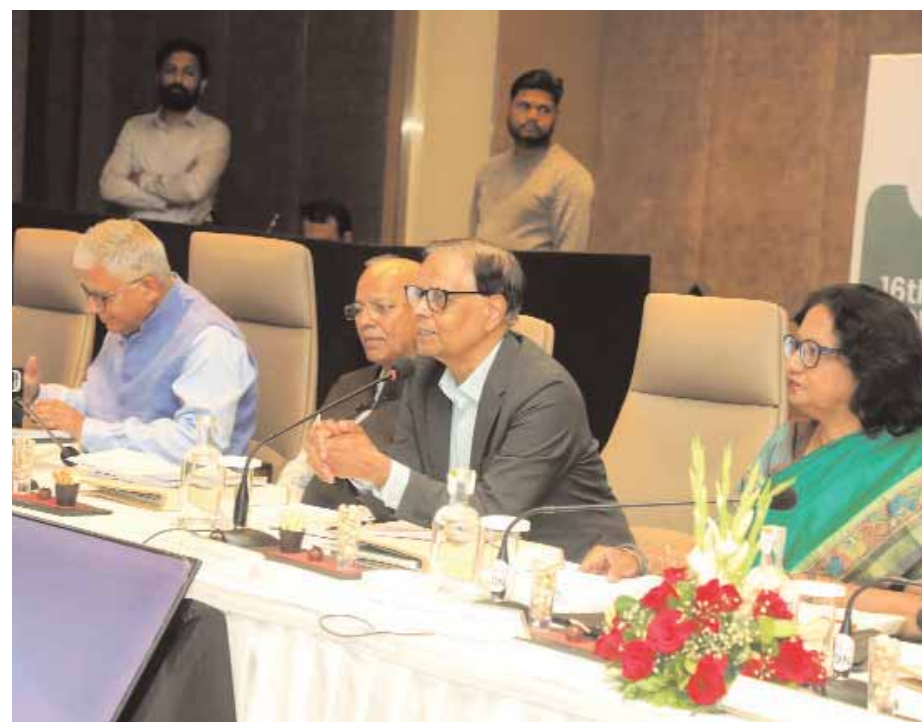
A meeting of the 16th Finance Commission with the CAG of India was held in Bhopal on Wednesday.

tributed to curating the diverse menu. Madhya Pradesh's traditional delicacies included Moti ke Dane, Dal Bafla, Ghuiyan ki Sabzi, Singhada Chaat, Morena's Gajak, Jhabua's Malpua, Ujjain's Kulfli, Hing Kachori, Rikamaj ki Sabzi, Indrahra, Mahua-based sweets, Tethra Rabdi, and Bhopali Gobhi Musallam. Popular dishes from different regions of India such as Amritsari Chole-Kulche, Bihari Litti-Chokha, South Indian Dosa-Uttapam, Meerut's Rotis and Parathas, Bengali Chom Chom, and Kesar Angoori Rasmalai were also served. The international cuisine section featured Pasta, Torte, Risotto, Gnocchi, Classic Opera, Baskin-Robbins ice cream, Indo-Chinese wok dishes, noodles, Thai curry, and dim sums, which captivated the guests.