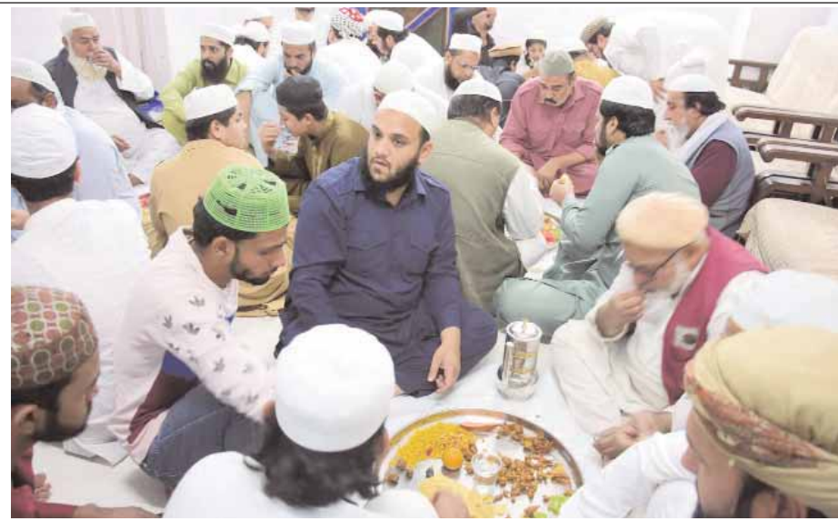
Muslim devotees participate in a community Roza Iftar during the holy month of Ramadan at Tarjuma Wali Masjid in Bhopal on Wednesday.