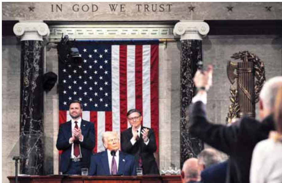
President Donald Trump addresses a joint session of Congress at the Capitol in Washington on Tuesday.

US President Donald Trump said he has received "strong signals" from Russia that it is ready for peace and that Ukrainian President Volodymyr Zelenskyy has written to him saying his country is ready to come to the negotiating table and also sign an agreement on minerals and security. Trump made these remarks Tuesday night in an address to the Joint Session of Congress, the first of his second term in the White House. "I'm also working tirelessly to end the savage conflict in Ukraine. Millions of Ukrainians and Russians have been needlessly killed or wounded in this horrific and brutal conflict with no end in sight," Trump said.