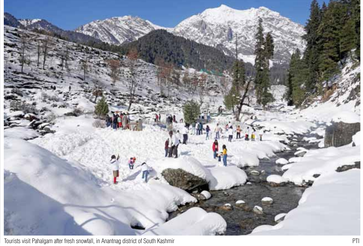
Tourists visit Pahalgam after fresh snowfall, in Anantnag district of South Kashmir.