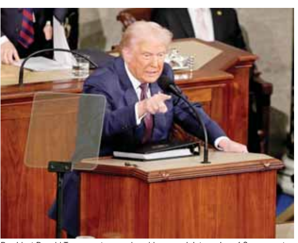
President Donald Trump gestures as he addresses a joint session of Congress at the Capitol in Washington.

product in America, however, under the Trump administration, you will pay a tariff and in some cases, a rather large one," Trump said. "Other countries have used tariffs against us for decades and now it's our turn to start using them against those other countries. On average, the European Union, China, Brazil, India, Mexico and Canada - have you heard of them? And countless other nations charge us tremendously higher tariffs than we charge them," Trump said. "It's very unfair. India charges us auto tariffs higher than 100 per cent." In February, President