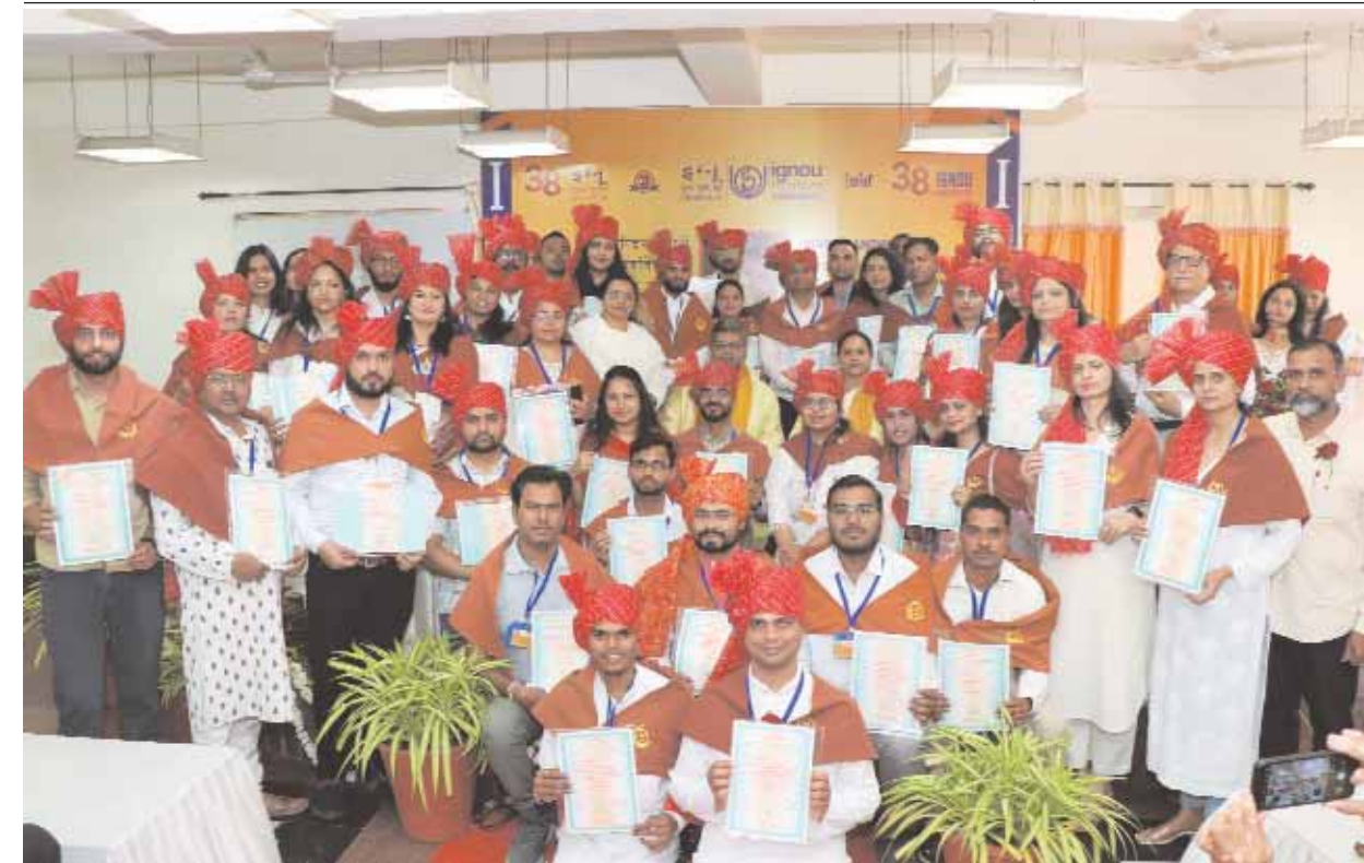
Scholars pose for a group photograph after receiving their degrees during 38th convocation ceremony of Indira Gandhi National Open University in Bhopal on Wednesday.