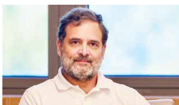
Congress leader Rahul Gandhi during a meeting in New Delhi

Drawing attention to the financial difficulties faced by railway porters, Congress leader Rahul Gandhi on Wednesday said they risked their lives to help people during the stampede at the New Delhi Railway Station last month and yet their voice was not being heard. The former Congress president, who posted on his YouTube channel a video of his recent interaction with porters at the New Delhi railway station, asserted that he would fight for their rights. Gandhi also urged people to share suggestions on the 'Awaaz Bharat Ki' portal to improve crowd management and strengthen security. "We will listen to the voice