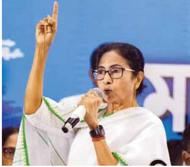
West Bengal CM Mamata Banerjee during a TMC's workers meeting