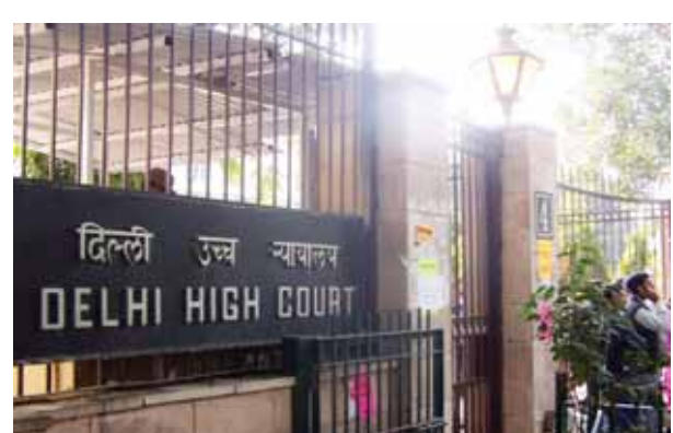
Delhi High Court

direction to the Ministry of Home Affairs to prepare rules for a centralised database of marriage registration. The Supreme Court, in February 2006, ruled that all marriages, irrespective of their religion, be compulsorily registered and directed the Centre and all states to frame and notify rules for this within three months. Pursuant to the top court's directions, the Delhi government issued an order on April 21, 2014 containing certain provisions for compulsory registration of marriage. The order is known as "Delhi (Compulsory Registration of Marriage) order, 2014. However, various deficiencies and lacunae were pointed out in the rules by the petitioner, who said the state and the Central governments were informed about it.