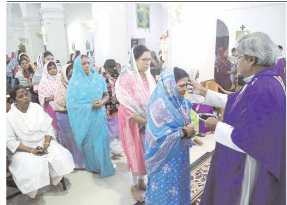
Christian devotees participate in a special prayer on Ash Wednesday, marking the beginning of 40 days of fasting, at St Francis Assisi Cathedral Church in Bhopal on Wednesday.