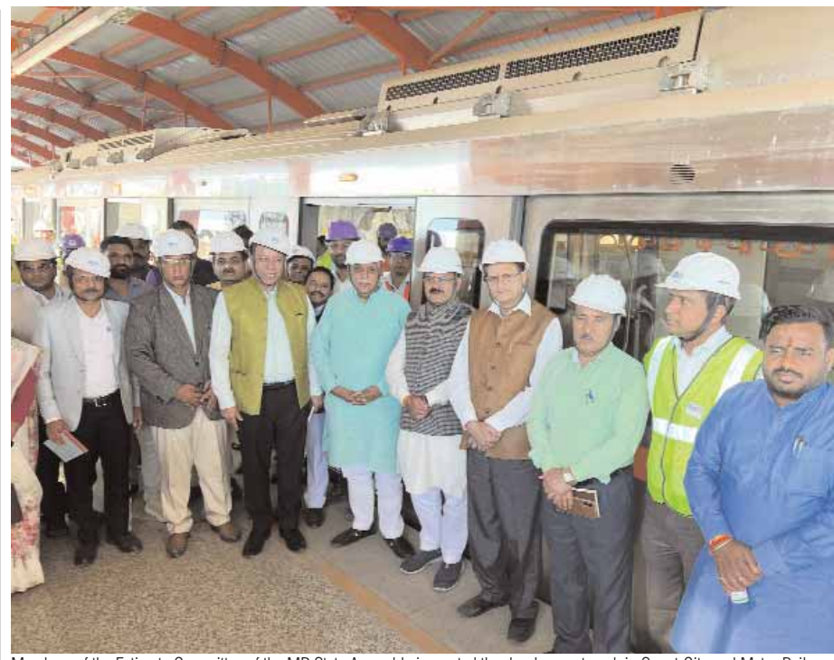
Members of the Estimate Committee of the MP State Assembly inspected the development work in Smart City and Metro Rail projects in Bhopal on Wednesday.

Over 4,900 startups are operating in Madhya Pradesh currently, with around 44% led by women entrepreneurs. Chief Minister Dr. Yadav emphasized the state's goal to double the number of registered startups under 'Startup India' and increase agriculture and food sector startups by 200%. To achieve this, 72 incubators are operational in the state, focusing on product-based startups. Under the State Startup Policy and Implementation Plan, financial support, infrastructure assistance, and policy support are being provided. The new startup policy offers financial grants covering 18% of total investment (up to Rs 18 lakh) and includes incentives for financial assistance, infrastructure support, and capacity-building programs.