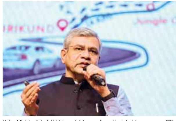
Union Minister Ashwini Vaishnav briefs on union cabinet decisions PTI

The Cabinet on Wednesday approved changes to the ₹3,880 Crore Livestock Health and Disease Control Programme (LHDC) to include the distribution of high-quality and affordable generic veterinary medicines to farmers. The total budget provided for the Livestock Health and Disease Control Programme (LHDCP) was ₹3,880 Crore for 2024-25 and 2025-26. A decision related to livestock health has been taken in the Cabinet. High-quality medicines will be provided under the Pashu Aushadhi component of the scheme," I and B Minister Ashwini Vaishnav said after the Union Cabinet meeting chaired by Prime Minister Narendra Modi in New Delhi.