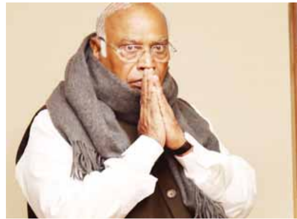
Congress President Mallikarjun Kharge

Congress President Mallikarjun Kharge on Wednesday attacked Prime Minister Narendra Modi over rise in gold loans and said his remarks during the Lok Sabha polls campaign about 'stealing of mangalsutras' have come true with women forced to mortgage their gold ornaments under his rule. Citing media reports, Kharge claimed that between 2019 and 2024, four crore women mortgaged their gold and took a loan of ₹4.7 Lakh Crore. In 2024, 38 per cent of the total loans taken by women are from gold loans, he said. In February 2025, RBI data showed that gold loans increased by a whopping 71.3 per cent in a year, the Congress chief said. "Narendra Modi ji, you had talked about 'stealing of mangalsutras'. That has now come true. In your rule, women have been forced to mortgage their gold ornaments. First you made women's 'stri-dhan' disappear by demonetisation, now due to inflation and falling household savings, they are forced to mortgage their