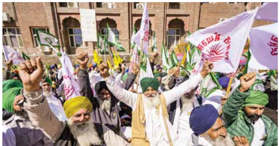
Members of Samyukta Kisan Morcha stage protest against Punjab CM Bhagwant Mann-led government in Amritsar