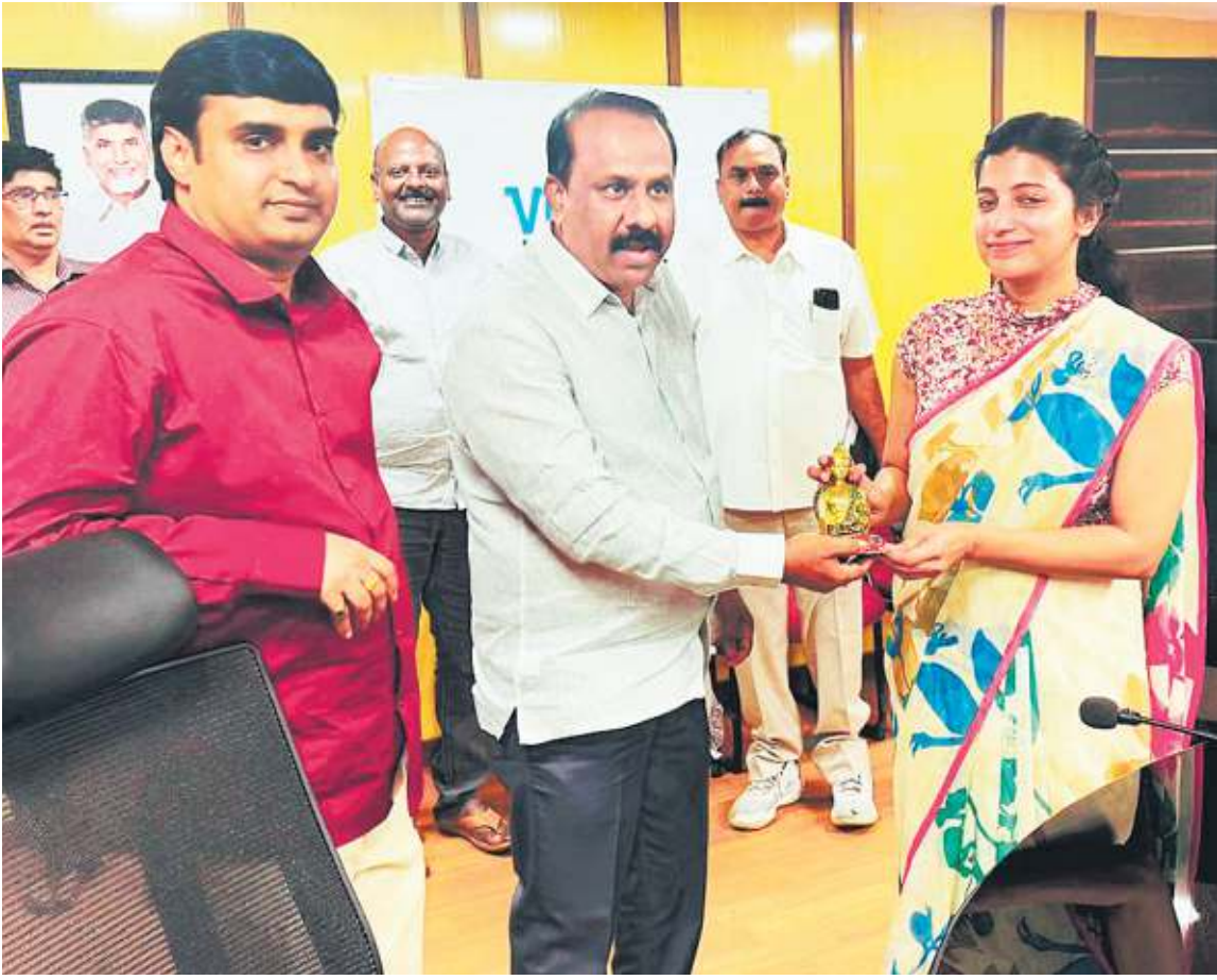
PNS ■ VISAKHAPATNAM

● Proposal to create digital library showcasing tourism sites across State