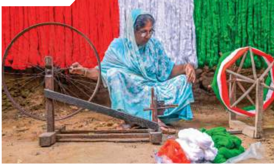
A woman prepares yarn to make the tricolour ahead of Republic Day 2025, in Nadia