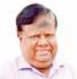
C K NAYAK

A historic event captivated the world as a herd of 15 wild elephants embarked on a 500-km journey from Xishuangbanna to the bustling city of Kunming