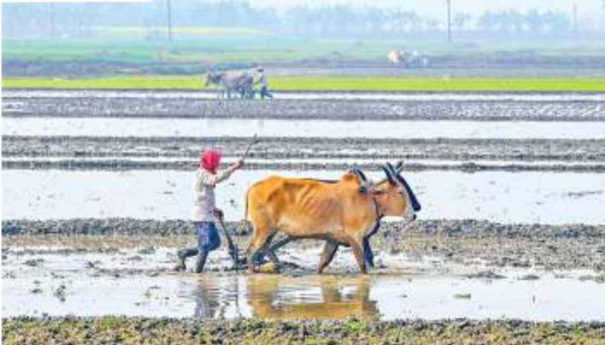
A farmer prepares an agricultural land for paddy cultivation, in Nadia