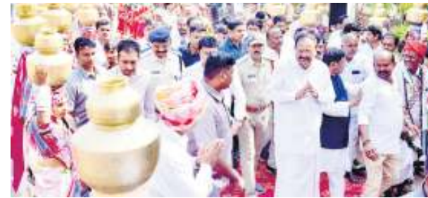
Former Vice-President M Venkaiah Naidu participates in the Adivasi Sammelanam organised by Girijana Praja Samakhyia (GPS) and Girijana Vidyarthi Samakhyia (GVS) in Vijayawada on Sunday.

He also encouraged tribal communities to cultivate leadership qualities through unity. The Girijana Praja Samakhyia (GPS) and Girijana Vidyarthi Samakhyia (GVS) national committees organised the "Tribal-Aboriginal Sammelanam" at the Tummalapalli Kalakshetram in Vijayawada on Sunday. The event witnessed active participation from tribal representatives and dignitaries, with traditional cul-