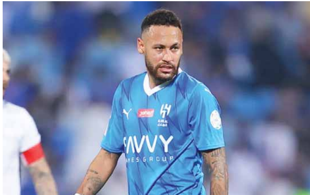
Neymar's comeback is largely expected by Santos fans. Since last week, they featured a video of a man with the voice of legendary three-time World Cup winner Pelé, who died in 2022, asking Neymar to return and wear his historic No. 10 shirt. Neymar won six titles at Santos, including the Brazilian Cup in 2010 and the prestigious Copa Libertadores in 2011. In June, during a visit to one of his social projects in Brazil, the striker denied he was eyeing a return to the club. "No (chance to return to Santos). This is a total lie, there's no plans.