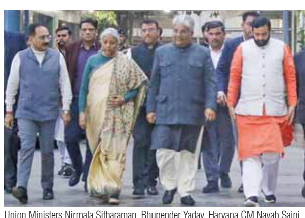
Union Ministers Nirmala Sitharaman, Bhupender Yadav, Haryana CM Nayab Saini and other BJP leaders after meeting the Election Commission of India.

Yamuna river. A BJP delegation, comprising Union ministers Nirmala Sitharaman, Bhupender Yadav and Haryana Chief Minister Nayab Singh met all three members of the EC, and requested them to ask the AAP leader to retract his charge and apologise for creating "panic" among people. BJP leaders also urged the Commission to bar him from campaigning for his allegation that Haryana was poisoning the water of Yamuna. Meanwhile, Congress leader Sandeep Dikshit raised the issue with Delhi Lt Governor Vinai Kumar Saxena, demanding action against Kejriwal and Chief Minister Atishi over the issue.