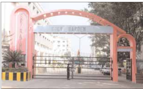
guards," said one of the residents.

This incident comes just a day after four flats were robbed in Dayal City, another housing complex in Govindpur. The thieves have clearly challenged the authorities, striking again before the police could solve the previous case. Panic has gripped the residents of Govindpur as they fear further thefts and question the effectiveness of