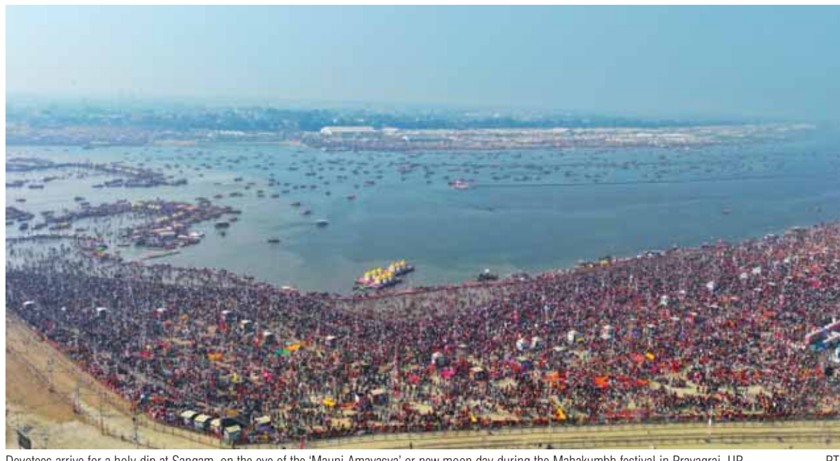
Devotees arrive for a holy dip at Sangam, on the eve of the 'Mauni Amavasya' or new moon day during the Mahakumbh festival in Prayagraj, UP