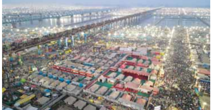
Devotees gather at the Sangam on the eve of 'Mauni Amavasya' during the Maha Kumbh Mela 2025, in Prayagraj, Uttar Pradesh.

accommodate the influx of devotees. To prevent overcrowding, the administration has encouraged pilgrims to bathe at the ghat nearest to their entry points. Devotees entering from different zones will be directed to designated ghats based on their location, ensuring a smooth flow of pilgrims. Special arrangements have been made for different groups of devotees. The Airavat Sangam Ghat will host pilgrims from eastern Uttar Pradesh, Bihar, Odisha, West Bengal, and northeastern states. Devotees from Madhya Pradesh, Gujarat, Rajasthan, Maharashtra, and southern states will bathe at specially developed ghats in Aarail while pilgrims from Delhi, western Uttar Pradesh, Haryana, Punjab, and Uttarakhand will be accommodated at ghats extending from Sangam to Nagvasuki. Separate ghats have been reserved for saints, seers, and their disciples from various Akharas, ensuring