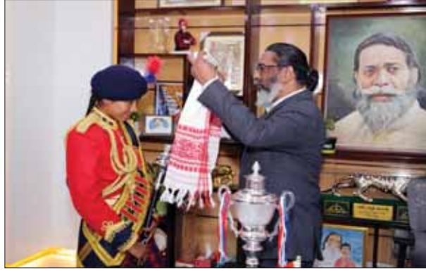
CM Hemant Soren felicitates students who won the national level band competition in New Delhi on January 25.

The Chief Minister said that there is no dearth of talent among the students of the state. They are constantly performing better in different fields. Our government is committed to bring out the