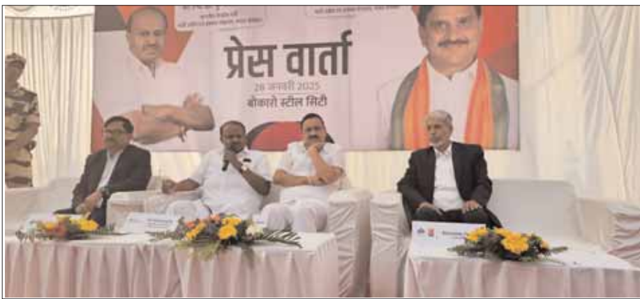
PNS : BOKARO Union Minister for Steel and Heavy Industries, H.D. Kumaraswamy, along with Minister of State for Steel, Bhupathi Raju Srinivasa Varma, addressed the media during their departure from Bokaro. They summarized the key outcomes of their two-day visit, reaffirming the government's commitment to transforming Bokaro into a hub of industrial excellence through significant investments, improved infrastructure, and sustainable practices.