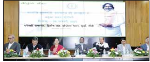
Chief Minister Hemant Soren, Finance Minister Radha Krishna Kishore along with senior officials during a meeting at Project Bhawan in Ranchi on Tuesday.