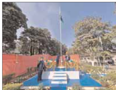
management members, employees, their families, and workers from the shop floor, attended the event. The parade, performed by over 500 security personnel, was met with applause for its precision and dedication, reflecting the discipline and commitment of the team. Approximately 10 employees were honored for their exceptional efforts in areas

such as housekeeping, safety initiatives, and in-house construction projects.