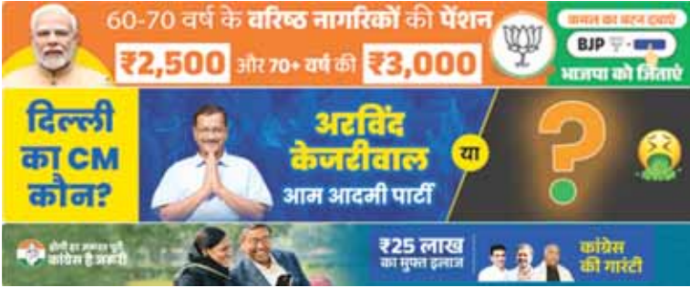
In the last 30 days: BJP spent ₹2.5Cr, followed by the AAP (₹77 Lakhs) and the Congress (₹23 Lakh)

In the intense race to wrest power from Aam Admi Party (AAP), the Congress which ruled 15 years and BJP which has not been in Delhi politics for about three decades now and incumbent AAP looking forward to retain itself have gone for an aggressive campaign by making optimum use of the available social media platforms. Digital platform has become the primary battleground for political messaging, overshadowing traditional forms of campaigning for the February 5 Delhi assembly poll. An analysis conducted by The Pioneer highlights the increasing reliance on digital reach by these political parties, with the BJP leading the charge in terms of spending on platforms like Facebook,