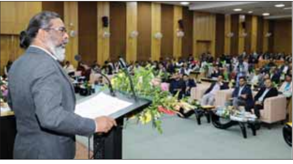
Chief Minister Hemant Soren addresses a gathering during the pre-budget seminar at Project Bhawan in Ranchi on Tuesday.

PNS : RANCHI Chief Minister Hemant Soren today said that such a document should be prepared through the budget, so that the state can move forward on the path of all-round development with the solution of the basic problems here. For this, it is necessary that the resources are used in the best possible