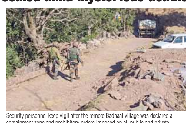
containment zone and prohibitory orders imposed on all public and private gatherings in Jammu and Kashmir's Rajouri district

According to the order issued by the office of the District Magistrate, Rajouri on January 21, 2025, "In view of the recent health situation in the Badhaal area and to curb the spread of infection the following orders are issued under section 163 of BNSS". Meanwhile, four villagers including three sisters have been admitted to the hospital in the last 24 hours.