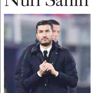
DORTMUND

{ m B}^{ m orussia} Dortmund fired coach Nuri Sahin on Wednesday, a day after its 2-1 loss to Bologna in the Champions League.