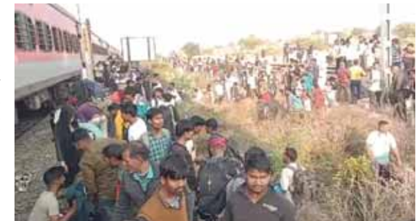
People gather at the site following the death of several passengers after they stepped down due to a rumour of fire and were run over by another train passing on the adjacent tracks, in North Maharashtra's Jalgaon district

Pushpak Express departed from the spot in just 15 minutes, while the Karnataka Express was removed within 20 minutes after the accident.