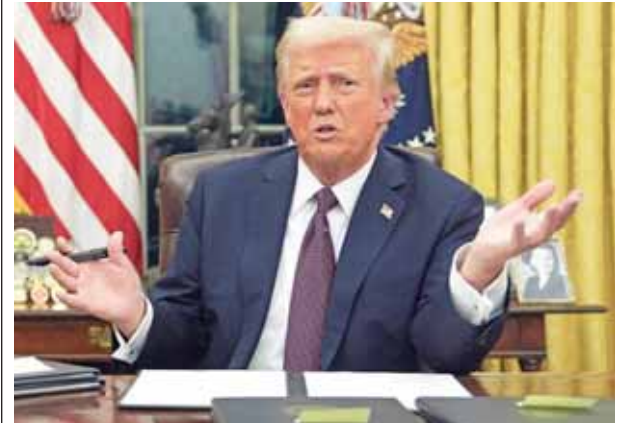
President Donald Trump talks to reporters as he signs executive orders in the Oval Office of the White House.