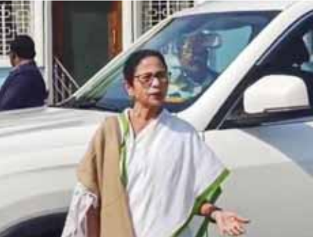
West Bengal Chief Minister Mamata Banerjee addresses the media in Howrah.