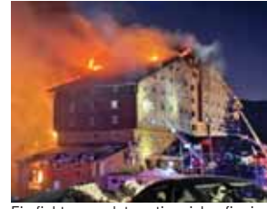
Firefighters work to extinguish a fire in a hotel at a ski resort of Kartalkaya in Bolu province, in northwest Turkey.

rifle, were recovered from the encounter site. A fresh exchange of firing took place late Monday night and it continued till early hours of Tuesday in a forest under the Mainpur police station areas (Chhattisgarh) along the Chhattisgarh-Odisha border, in which 12 more Naxalites were gunned down. With this, the total number of Maoists killed in the operation went up to 14, police said. Intermittent exchange of firing in the area was underway on Tuesday too and the number of Maoist casualties may increase, they said. A joint team of security personnel from the District Reserve Guard (DRG) of the Chhattisgarh Police, CoBRA commandos of the Central Reserve Police Force (CRPF) and Special Operation Group (SOG) personnel from the Odisha Police were involved in the operation. The operation was launched on the night of January 19 based on intelligence inputs about the presence of Maoists in the Kularighat reserve forest of Chhattisgarh, just 5 km from the border of Odisha’s Nuapada district. Hailing the security forces, Chhattisgarh Chief Minister Vishnu Deo Sai said under the BJP-led double-engine government at the Centre and the state, Chhattisgarh will get rid of the menace by March 2026. He said strengthening the resolve of Prime Minister Modi and the union home minister to end Naxalism in the country by March 2026, the security forces have been continuously achieving success and moving rapidly towards fulfilling the target.