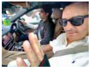
Bollywood actor Saif Ali Khan on his way to home after he was discharged from Lilavati Hospital, in Mumbai.

Six days after he survived a Smurderous attack at his Bandra residence, Bollywood actor Saif Ali Khan was discharged from the Lilavati Hospital here on Tuesday evening. Fifty-four-year-old Saif — dressed in a white shirt and a pair of denims — looked hale, hearty and cheerful, as he walked out of the hospital and briefly raised his arm to wave at his fans and media persons, before heading in a car towards his home. A few close aides and private security personnel accompanied him. Saif was seen with friends and neighbours, as he walked into his ‘Satguru Sharan’ building. Minutes later, the actor returned to his 12th floor apartment where he had sustained six stab injuries, including the one in his spine, in a knife attack on