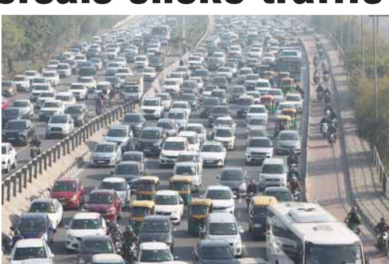
Traffic jam near the Ring Road owing to rehearsal for the Republic Day Parade.

Massive traffic congestion was seen in central Delhi due to the Republic Day parade rehearsals on Tuesday, leaving hundreds of commuters stranded on the road. Commuters also complained of long queues at metro stations due to heightened security checks ahead of Republic Day. Routes leading to Bahadur Shah Zafar Marg near the ITO, arterial roads of the Ring Road, between Ashram and IP Estate flyover, Man Singh Road, Rafi Marg, Janpath Road, Shahjahan Road, Akbar Road, Ashoka Road and other routes around the Kartavya Path were severely hit. A traveller shared videos and pictures of a traffic jam in Mundka following which the Delhi Traffic Police said the traffic control room has been informed and the needful is being done. “Don’t feel like going out for work. The traffic in Delhi is horrible,” another user on X said. Motorists blamed traffic personnel for not regulating traffic properly and said