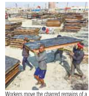
tent site, a day after a fire broke out at the Maha Kumbh Mela due to a cylinder blast, in Prayagraj

fire broke out near the AKinnar Akhara camp in Sector 16 of the Maha Kumbh Monday morning, triggering panic among devotees and camp residents. This is the second fire incident at the Kumbh in two days, raising concerns about fire safety measures at the massive religious gathering.