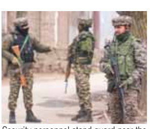
Security personnel stand guard near the site of the encounter, at Gujjarpati area in Sopore, Baramulla district of Jammu

'The government has set separate fees for expedited registration under the Tatkal service. The registration and termination process for live-in relationships has also been simplified. Termination applications by one partner will require confirmation from the other partner. In testamentary succession, wills can be uploaded the portal for online registration, modification, revalidation, or revival," a statement from the state government read.