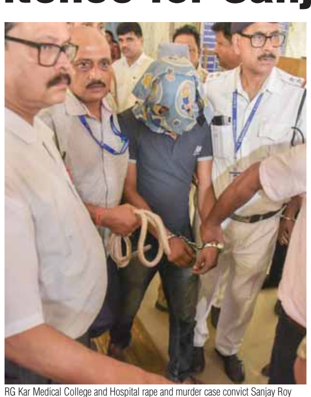
being take to the CBI office at CGO Complex, in Kolkata

However, the mother of the victim, who broke down in tears immediately after the judgment was pronounced, said, "We cannot discard the