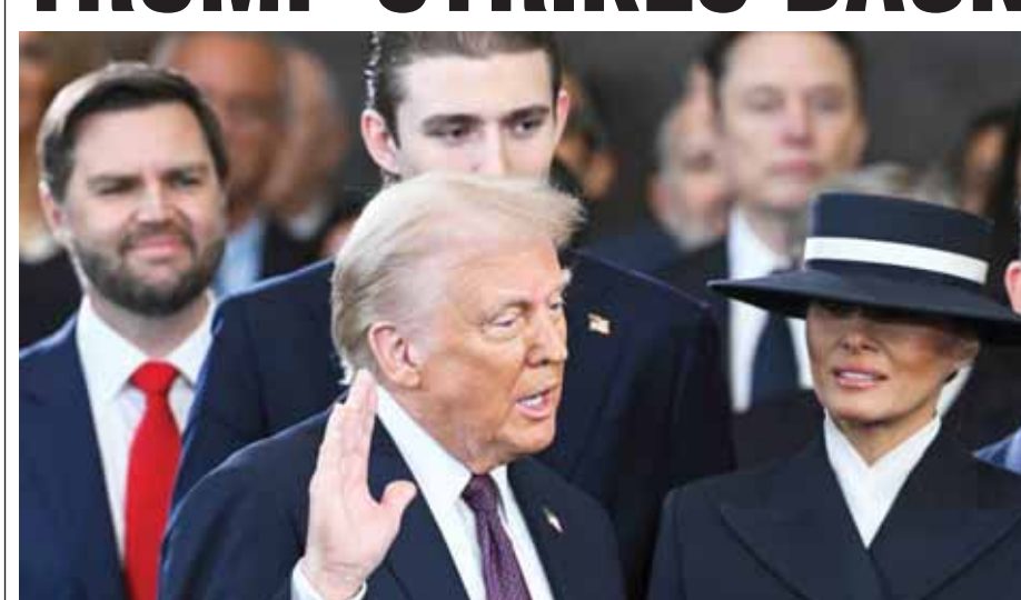
President-elect Donald Trump takes the oath of office during the 60th Presidential Inauguration in the Rotunda of the US Capitol in Washington