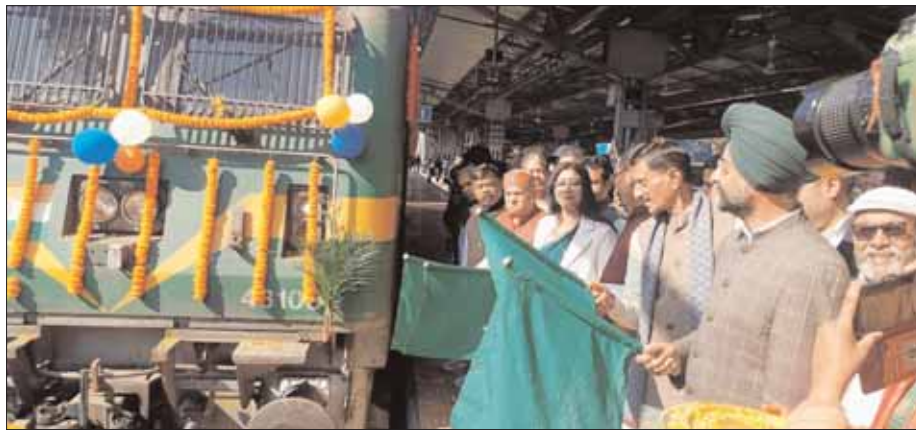
Ranchi for Kumbh, Minister of State for Defence and Ranchi MP Sanjay Seth met Union Railway Minister Ashwini Vaishnav and discussed with him. He was

the division and a large number of public representatives, representatives of Railway Consumer Advisory Committee, media representatives, railway employees, passengers and others were present at Ranchi Railway Station. A total of 10 trains will be operated from Ranchi Railway Division from January 16 to March 1 for the Maha Kumbh Mela organized in Prayagraj, Uttar Pradesh. Coming from different areas, these trains will pass through Ranchi Railway Station, where a large number of people of Ranchi will be able to visit Kumbh. For the purpose of running as many trains as possible from Ranchi or via