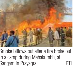
Smoke billows out after a fire broke out in a camp during Mahakumbh, at Sangam in Prayagraj

BISWAJEET BANERJEE ■ MAHAKUMBH NAGAR Prayagraj witnessed a massive fire on Sunday during the ongoing Mahakumbh, as pandals in Sector 19, near the Shastri Bridge, were consumed by flames. Approximately 200 tents were impacted, with approximately 20 of them completely reduced to ashes. Although no casualties were reported, the fire resulted in substantial damage to valuables, and several LPG cylinders exploded, worsening the situation. Initial reports indicate that the fire started from the tent belonging to Gita Press. Prime Minister Narendra Modi spoke to Uttar Pradesh Chief Minister Yogi Adityanath to inquire about the fire incident.