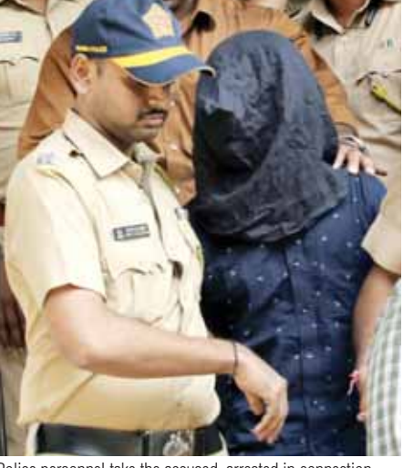
Police personnel take the accused, arrested in connection with the alleged attack on Bollywood actor Saif Ali Khan, to a hospital for medical examination before producing him at a court, in Mumbai