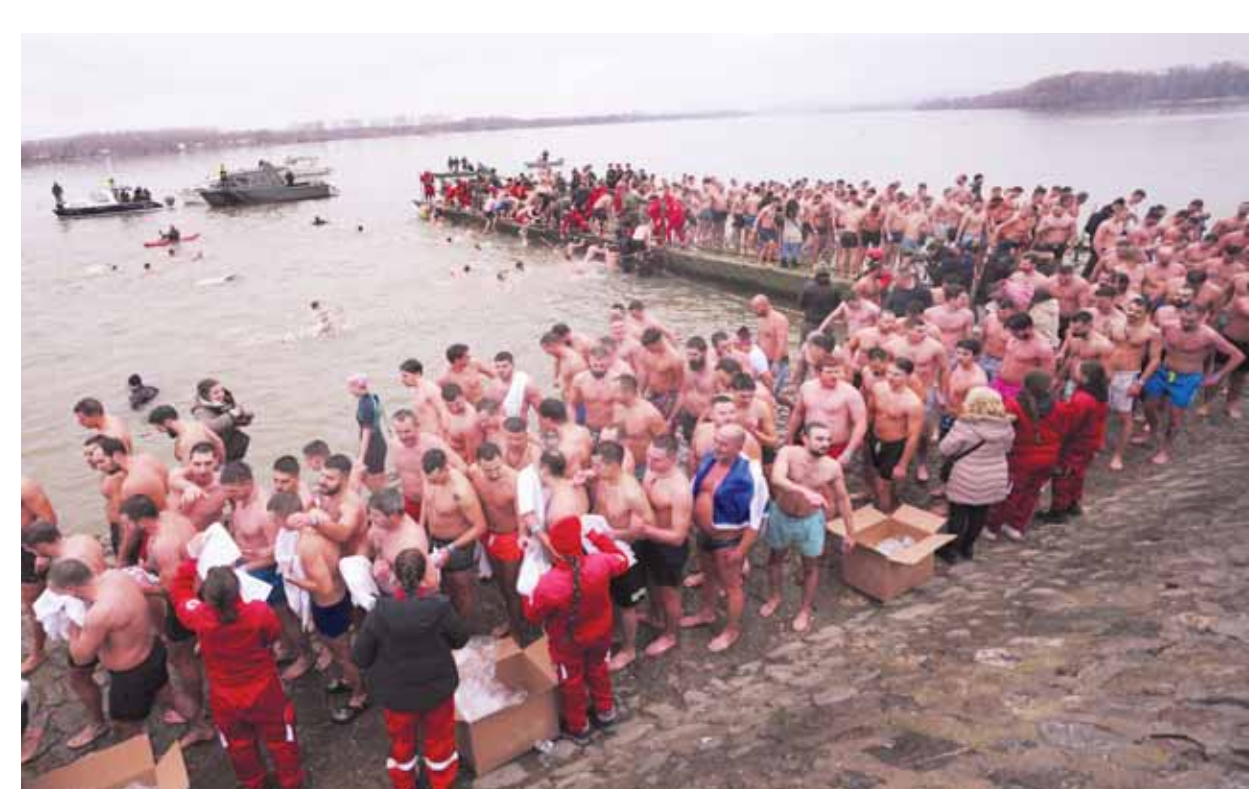
Christian Orthodox believers walk after a swim in the icy water of the Danube river in Belgrade, Serbia, on Sunday