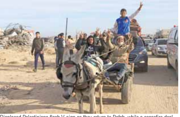
Displaced Palestinians flash V-sign as they return to Rafah, while a ceasefire deal between Israel and Hamas went into effect, in Rafah, Gaza Strip