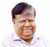
C K NAYAK

A historic event captivated the world as a herd of 15 wild elephants embarked on a 500-km journey from Xishuangbanna to the bustling city of Kunming