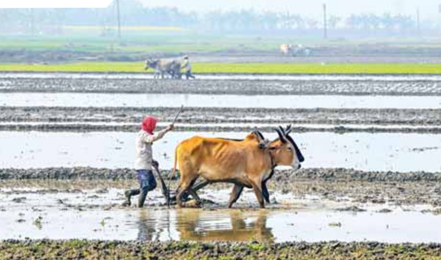
A farmer prepares an agricultural land for paddy cultivation, in Nadia