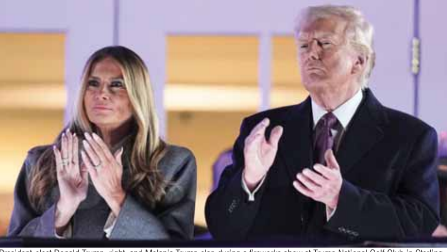
President-elect Donald Trump, right, and Melania Trump clap during a fireworks show at Trump National Golf Club in Sterling, Va., ahead of the 60th Presidential Inauguration