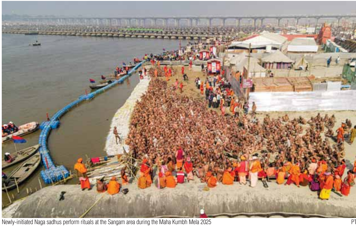
Newly-initiated Naga sadhus perform rituals at the Sangam area during the Maha Kumbh Mela 2025

a powerful blend of faith, humility, and joy." The Mahakumbh, one of the largest religious gatherings on Earth, has transformed Prayagraj into a vibrant tapestry of colors, sounds, and spiritual experiences. From the chanting of mantras to the rhythmic beats of devotional music, the atmosphere is charged with an undeniable sense of collective upliftment. "I have traveled from the southernmost tip of India to experience the sanctity of the Sangam," shared an elderly woman, her eyes glistening with tears of joy. "This is a once-in-a-lifetime opportunity to cleanse my soul and connect with the divine." Beyond the religious significance, the Mahakumbh also serves as a powerful testament to the unifying force of faith. People from all walks of life, irrespective of caste, creed, or social standing, come