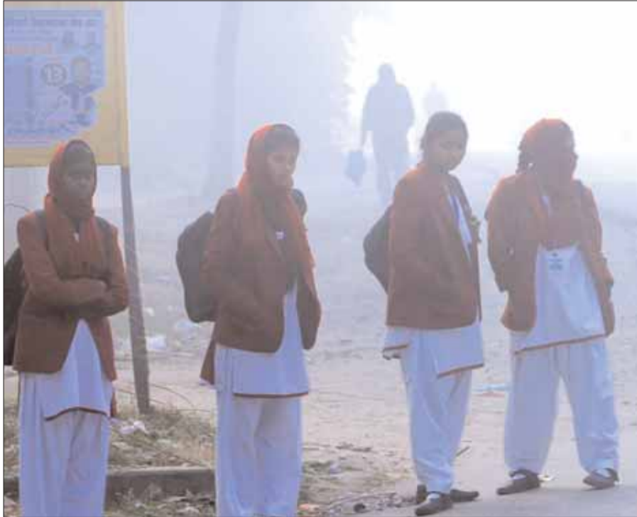
School girls wearing warm uniform on a cold winter morning in Ranchi on Saturday.

The cold wave has prompted residents in the affected areas to bundle up and prepare for chilly nights. Authorities have advised people, particularly in rural regions, to take precautions to stay warm as the winter conditions persist.