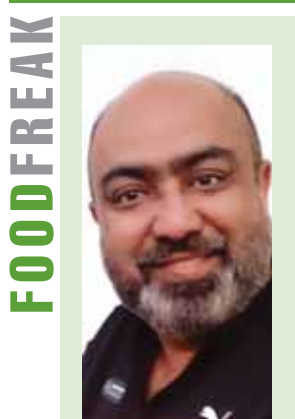
Pawan Soni Food critic and founder of the Big F Awards

Japonico: Discover the joy of great food and creative flavours