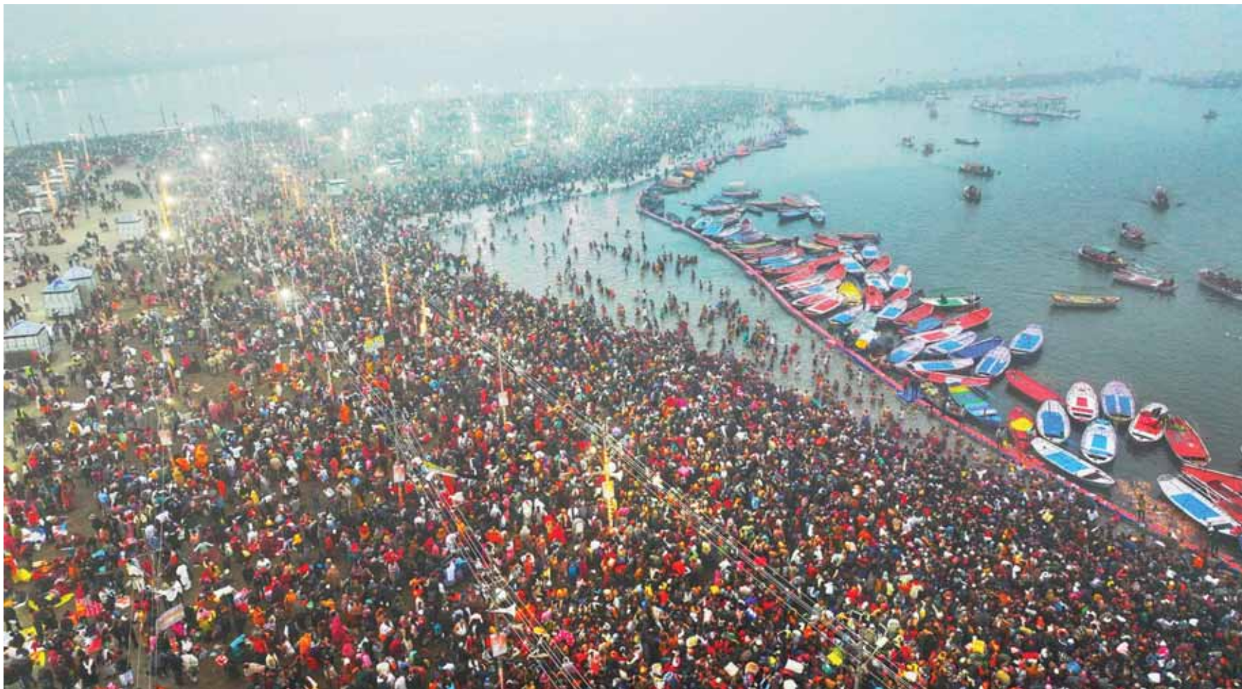
Devotees take a holy dip at Sangam during Maha Kumbh Mela 2025, in Prayagraj, Uttar Pradesh