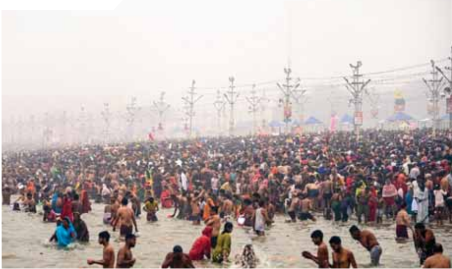
Devotees take a holy dip at Sangam on the first day of Maha Kumbh Mela 2025, in Prayagraj