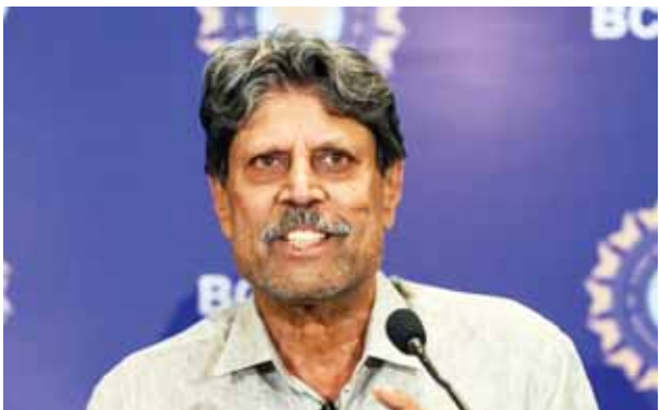
more than 150 overs and emerged the highest wicket-taker on both sides with 32 scalps. "Please don't compare. You cannot compare one generation with another. That is not required. Today, players are scoring 300 runs in a day. It didn't happen during our time. So don't compare the two (generations)," said Kapil during an event hosted by the Professional Golf Tour of India (PGTI) of which he is the president. The 1983 World Cup-winning skipper also added that one should not question the judgement of the selectors as they would have arrived at the decision to not play Jaiswal and Pant after giving it a thought. The two cricketers played all five Tests during the gruelling Australia series, with Jaiswal (391) emerging the second-highest run-getter, second only to Travis Head (448).

PTI ■ NEW DELHI It is needless to compare two generations of players and pass a judgement on who was better, legendary cricketer Kapil Dev said on Monday and refused to get into a debate if BCCI selectors were right in excluding Yashasvi Jaiswal and Rishabh Pant from the T20I squad for the five-match series against England. Kapil bowled nearly 300 overs during the 1991-92 Test series against Australia and in the same rubber he became the first Indian to take 400 wickets in the traditional format apart from contributing with the bat in the team's cause. India pace spearhead Jasprit Bumrah could not bowl in the second innings of the fifth Border-Gavaskar Test recently because of back spasms. India lost the five-match series 1-3. The 31-year-old Bumrah bowled