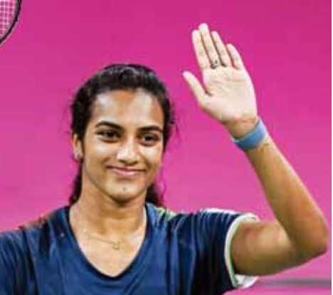
You have to wait for the right time to do the right thing," Sindhu said self-belief is something an athlete can't do without, indicating that she is trying to overcome the ongoing tough phase with the same virtue. "It hits you when you are actually not able to win or not able to get that success or when you are actually at your lows.

were days where I was injured and I didn't know if I can come back and I can be my 100 per cent, which happened in 2015, when I had an injury, but then I bounced back, and I got a silver at Rio." "My life has changed a lot since the time I started and till now I have had a lot of awards, rewards which has given me a lot of confidence. I am very grateful for whatever I have achieved and when I look back, I can tell that yes I have done whatever I could." Wins and losses are part of the learning curves. So what has been the biggest learning for Sindhu? "Being patient. That has taught me a lot in life, being patient and wait for the right time because sometimes game teaches you to be patient no matter what." "You have to keep waiting till you get whether it is success or whether it is the right time or whether it is the right shot..."