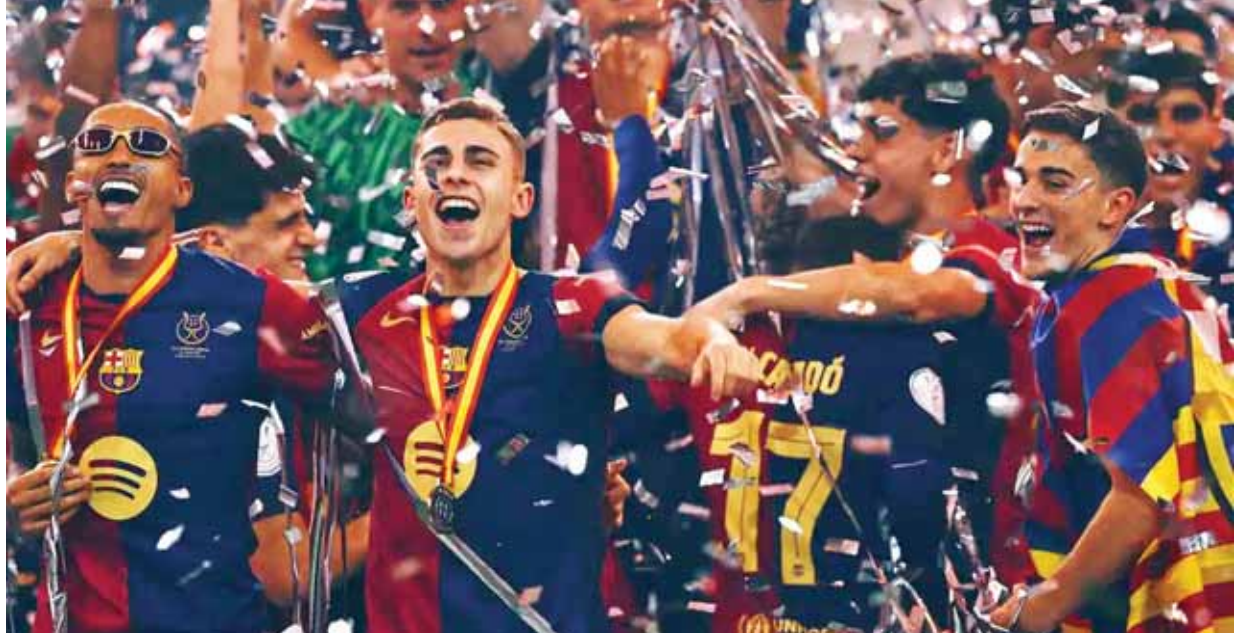
a nice run in the 22nd and Lewandowski, who scored twice in the earlier clasico, put the Catalans ahead in the 36th. Raphinha added goals in the 39th and 48th minutes, while Balde scored in first-half stoppage time. Rodrygo scored from a free kick in the 60th after Szczesny was sent off for a

lost two games in a row to end last year. "The Christmas break helped us reflect on what we had done wrong," Lewandowski said. "Now we can look forward to the run of games that we have until the end of the season." Madrid lost for the first time after a run of five consecutive victories. "It was a bad night," Madrid coach Carlo Ancelotti said. "It's a disappointment, we won't hide it, but it's soccer... You have to try to learn from the losses. We have to look forward to what's ahead." Mbappé had been contained when the rivals met in October but scored a superb goal five minutes into the match at King Abdullah Sports City stadium after picking up the ball just inside Madrid's half, running at the defense and then finding the net with a clever finish. But Yamal evened the match with