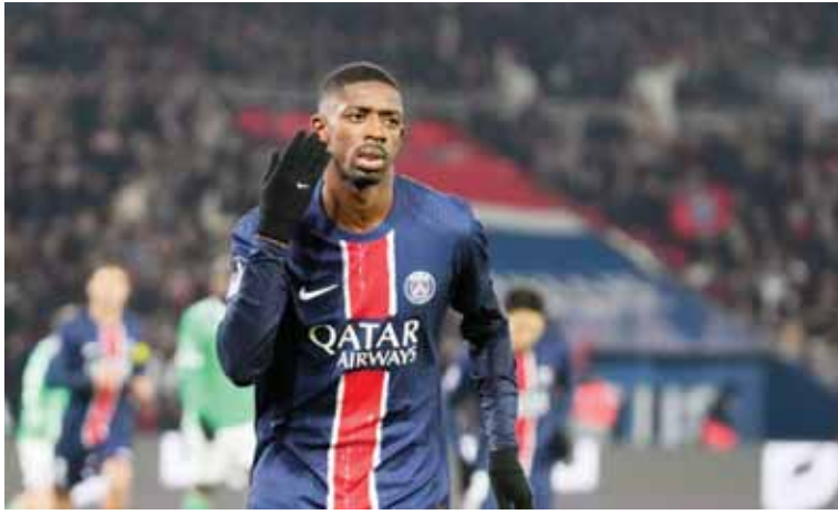
close to conceding an equalizer. Earlier, Deiver Machado scored late as seventh-place Lens won 2-1 at struggling Le Havre to move one point behind Lyon in sixth. The Colombia defender headed powerfully home from Poland winger Przemyslaw Frankowski's cross in the 77th minute. Central defender Abdukodir Khusanov was left out of the Lens squad amid reports of an imminent big-money transfer to Premier League defending champion Manchester City reportedly worth 50 million euros ($51 million). The 20-year-old joined Lens on a four-year contract last season, becoming the

PTI ■ PARIS Paris Saint-Germain remained unbeaten and seven points clear at the top of the French league — halfway through the season — after Ousmane Dembélé scored twice in a 2-1 win over Saint-Etienne. Marseille is in second place after 17 rounds, with third-place Monaco 12 points adrift of defending champion PSG, which has beaten both sides. Dembélé scored in the 13th minute and the France winger netted from the penalty spot 10 minutes later after a video review spotted a handball from Léo Pétrot on Achraf Hakimi's cross. The decision seemed harsh as the ball grazed Pétrot's hand without him knowing. Dembélé moved to 10 league goals, level with teammate Bradley Barcola and one behind co-top scorers Jonathan David (Lille) and Mason Greenwood (Marseille). Barcola thought he had his 11th goal of the season close to halftime but, on a day of video reviews, the goal was ruled out for a foul by the player himself. PSG has been linked with a move for Georgia winger Khvicha Kvaratskhelia from Napoli, but it was another Georgian who scored for 16th-place Saint-Etienne as Zuriko Davitashvili neatly curled in a free kick midway through the second half. Despite its unbeaten league record, PSG again looked nervous and came