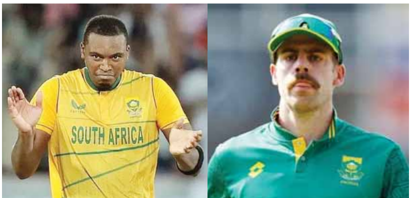
rubber against Pakistan. Pacer Nandre Burger, who suffered a lumbar stress reaction, ahead of the ODI series against Ireland in early October too was not considered for selection. However, the Proteas trusted the improving fitness of all-rounder Wiaan Mulder, who broke his middle finger in the series against Sri Lanka, but he played in the second Test against Pakistan after the physios gave the green signal. Keshav Maharaj and Tabraiz Shamsi are the specialist spinners, who will be assisted by Aiden Markram's part-time off-spin. South Africa squad: Temba Bavuma (captain), Tony de Zorzi, Marco Jansen, Heinrich Klaasen, Keshav Maharaj, Aiden Markram, David Miller, Wiaan Mulder, Lungi Ngidi, Anrich Nortje, Kagiso Rabada, Ryan Rickelton, Tabraiz Shamsi, Tristan Stubbs, Rassie van der Dussen.

PTI ■ JOHANNESBURG South Africa on Monday included Lungi Ngidi and Anrich Nortje in the Temba Bavuma-led squad for next month's Champions Trophy after the pacers recovered sufficiently from their respective injuries. Nortje sustained an injury on his big toe last month which ruled him out of the series against Pakistan while a groin strain in November forced Ngidi to miss the series against Sri Lanka and Pakistan. South Africa, the semifinalists of the 2023 ODI World Cup, are placed in group B of the Champions Trophy. They will start their campaign against Afghanistan in Karachi on February 21 before meeting Australia in Rawalpindi on February 25 and their final group game is against England on March 1. However, frontline pacer Gerald Coetzee was not picked because of the groin injury that he suffered during the first Test against Sri Lanka in Durban last year. Subsequently, he missed the second Test at Gqeberha and the entire home