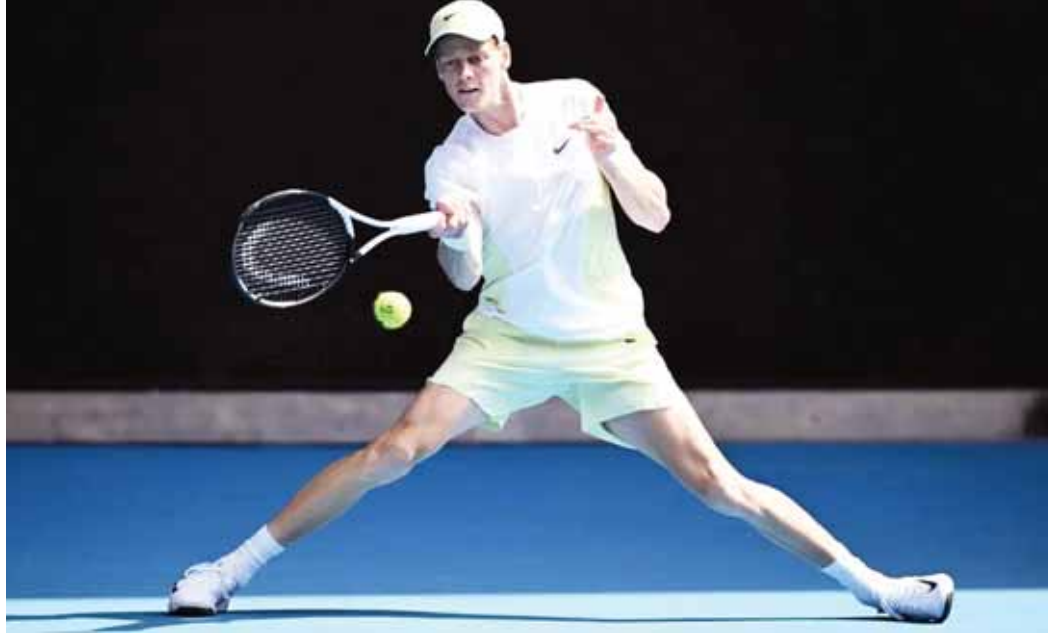
first marquee match and dropped a 6-3, 6-3 win over 2020 champion Sofia Kenin. Third-seeded Gauff beat Swiatek to win the title at the WTA Finals last November and started this season by helping the U.S. To

for two long, tiebreak sets against No. 35-ranked Jarry, a 29-year-old from Chile, before finding his touch. "It was a very close one because the first sets, they can go both ways," Sinner said. "In the third set when I broke it the first time, that gave me a little bit of room to breathe." "I'm happy how I handled the very tough situation." Sinner has got a good record at Melbourne Park in that department. He rallied from two sets down in last year's final to beat Daniil Medvedev for his first Grand Slam title, coming off a semifinal upset of 10-time champion Novak Djokovic. While Sinner was deep into his match against Jarry, Swiatek, a five-time major winner from Poland, fended off top-ranked doubles player Katerina Siniakova 6-3, 6-4 on John Cain Arena. Coco Gauff had a little difficulty adjusting to the sun at one end of Rod Laver Arena in Monday's