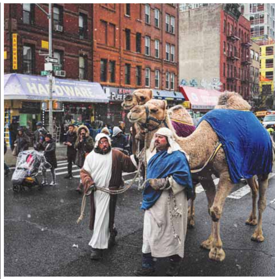
Camels walk through snow during El Museo del Barrio's 47th annual Three Kings Day parade on Monday, in New York.