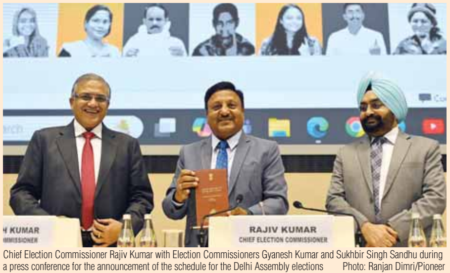
Chief Election Commissioner Rajiv Kumar with Election Commissioners Gyanesh Kumar and Sukhbir Singh Sandhu during a press conference for the announcement of the schedule for the Delhi Assembly elections.

RAJESH KUMAR ■ NEW DELHI With an announcement of the 70 assembly seats in Delhi in a single phase on February 5 and the votes will be counted on February 8 by the Election Commission (EC), the stage is set for a fierce triangular contest between the incumbent Aam Aadmi Party (AAP), the Bharatiya Janata Party (BJP), and the Congress. The battle lines are drawn between Prime Minister Narendra Modi's developmental model versus the 'freebies' model touted by the AAP chief and former Chief Minister Arvind Kejriwal, who is eyeing a hat-trick, having swept the 2015 and 2020 elections with 67 and 62 seats, respectively. The AAP faces anti-incumbency, corruption allegations and an aggressive BJP in its bid to assume power for a third successive term. The Congress will be keen to regain the national Capital. Although the Congress and the AAP contested the 2024 Lok Sabha elections together as part of the INDIA bloc, they will be competing separately in the upcoming Assembly polls. Announcing the dates for the Assembly polls in Delhi, Chief Election Commissioner Rajiv Kumar said "It is a single-phase election... We have deliberately kept polling on a Wednesday so more people come out to vote... like we did in Maharashtra. The entire election process will be completed by February 10." With the EC's announcement of the election schedule, the