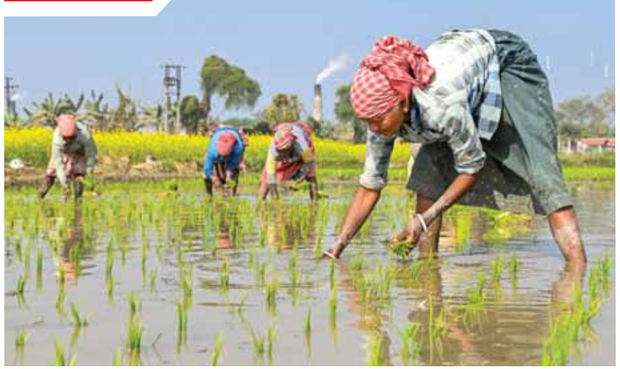
Farmers plant paddy saplings in a field, in Nadia