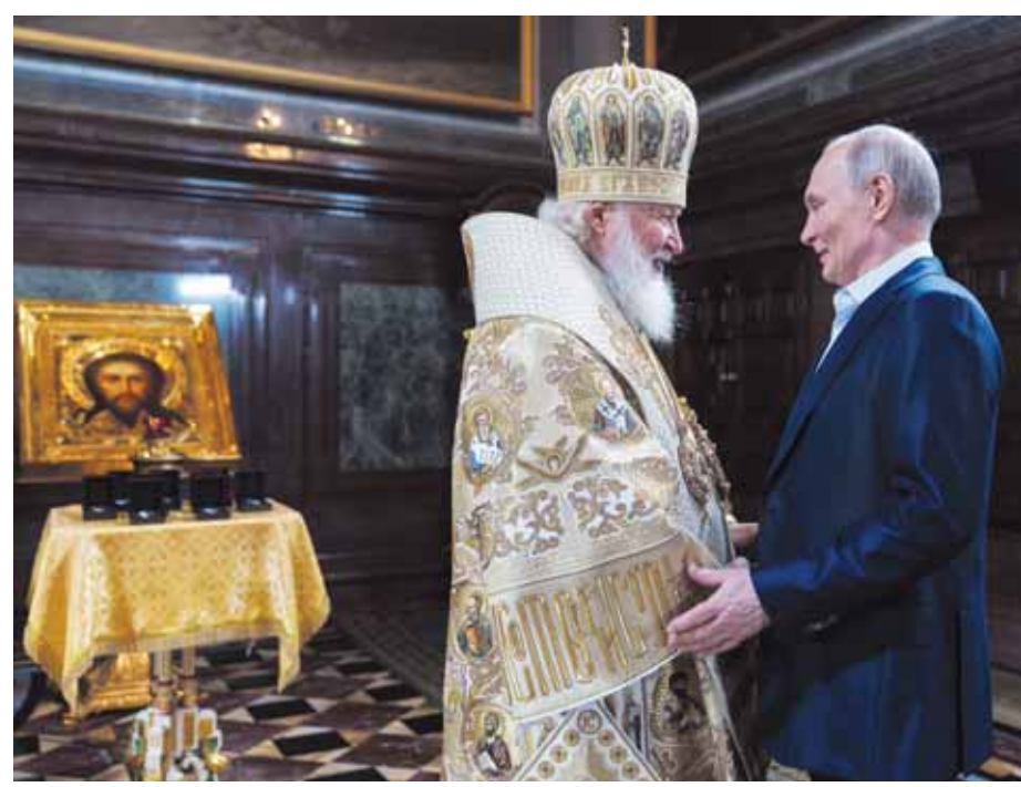
In this photo released by Russian Orthodox Church Press Service, Russian Orthodox Patriarch Kirill (left) and Russian President Vladimir Putin speak after the Christmas service in the Christ the Saviour Cathedral in Moscow, on Tuesday.

reported in the US, but previous illnesses have been mild and most have been detected among farmworkers exposed to sick poultry or dairy cows. In two cases — and adult in Missouri and a child in California — health officials have not determined how they caught it. The origin of the Louisiana person's infection was not considered a mystery. But it was the first human case in the US linked to exposure to backyard birds, according to the Centers for Disease Control and Prevention. Louisiana officials say they are not aware of any other cases in their state, and US officials have said they do not have any evidence that the virus is spreading from person to person.