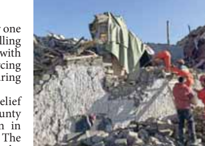
Rescue workers search for survivors in the aftermath of an earthquake in Changsuo Township of Dingri in Xigaze, southwestern China's Tibet Autonomous Region. PTI

PTI ■ BEIJING A 6.8-magnitude earthquake struck near one of Tibet's holiest cities on Tuesday, killing at least 95 people and injuring 130 others with tremors also shaking buildings and forcing people to run to the streets in neighbouring Nepal. According to regional disaster relief headquarters, the quake jolted Dingri County in Xigaze, Tibet Autonomous Region in China at 9:05 am Tuesday (Beijing Time). The US Geological Service, however, put the quake's magnitude at 7.1. At least 95 people have been confirmed dead and 130 others injured as of 3 p.m. Tuesday (local time), state-run Xinhua news agency reported. Chinese President Xi Jinping has ordered all-out rescue efforts to carry out relief and rescue operations in the affected areas. Xi ordered utmost efforts to treat the injured and urged efforts to prevent secondary