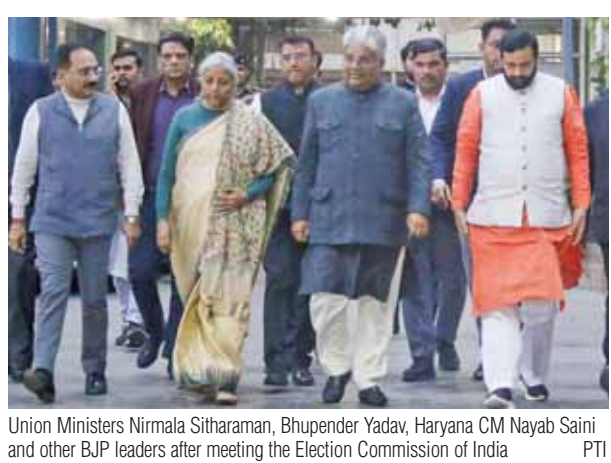
Union Ministers Nirmala Sitharaman, Bhupender Yadav, Haryana CM Nayab Saini and other BJP leaders after meeting the Election Commission of India.