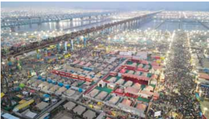
Devotees gather at the Sangam on the eve of 'Mauni Amavasya' during the Maha Kumbh Mela 2025, in Prayagraj, Uttar Pradesh.

accommodate the influx of devotees. To prevent overcrowding, the administration has encouraged pilgrims to bathe at the ghat nearest to their entry points. Devotees entering from different zones will be directed to designated ghats based on their location, ensuring a smooth flow of pilgrims. Special arrangements have been made for different groups of devotees. The Airavat Sangam Ghat will host pilgrims from eastern Uttar Pradesh, Bihar, Odisha, West Bengal, and northeastern states. Devotees from Madhya Pradesh, Gujarat, Rajasthan, Maharashtra, and southern states will bathe at specially developed ghats in Aarail while pilgrims from Delhi, western Uttar Pradesh, Haryana, Punjab, and Uttarakhand will be accommodated at ghats extending from Sangam to Nagvasuki. Separate ghats have been reserved for saints, seers, and their disciples from various Akharas, ensuring