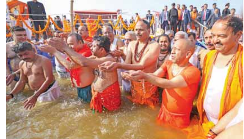
Uttar Pradesh Chief Minister Yogi Adityanath with his Cabinet colleagues takes a holy dip at the Sangam during the Maha Kumbh Mela 2025, in Prayagraj

Prime Minister Narendra Modi is scheduled to visit the ongoing Maha Kumbh Mela in Prayagraj on February 5, according to sources. The grand spiritual event has already seen an influx of millions of devotees, and the Prime Minister's visit is expected to draw further attention to the historic gathering. Union Home Minister Amit Shah is slated to attend the Maha Kumbh Mela on January 27. During his visit, Shah is expected to take a holy dip at the Sangam, perform the Ganga Puja, and hold discussions with officials overseeing the event. Vice President Jagdeep Dhankhar is also scheduled to visit the Mela on February 1. Uttar Pradesh Chief Minister Yogi Adityanath previously confirmed the participation of top dignitaries, including President Droupadi Murmu, Vice President Jagdeep Dhankhar, Prime Minister Narendra Modi, and Union Home Minister Amit Shah. "Their presence underscores the cultural and spiritual significance of the Maha