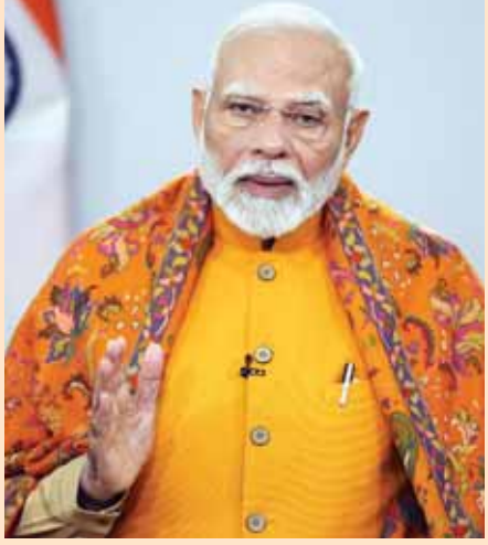
SAUMYA SHUKLA ■ NEW DELHI

Turning the heat up ahead of the Delhi Assembly elections, Prime Minister Narendra Modi on Wednesday slammed the ruling Aam Aadmi Party (AAP) for failing to provide basic needs such as water to the people of the national Capital while taking a jibe at the party on the money laundering linked excise policy scam, stating that 'liquor is available but water is not'. Prime Minister made these remarks during his interaction with the booth level workers in the 'Mera booth, sabse mazboot' programme while urging the members of the Bharatiya Janata Party (BJP) in the Capital to target winning over 50 per cent booths in the Assembly polls. Assuring a landslide victory in the Assembly polls, he asked booth workers to set two goals- breaking all voting records and ensure that the BJP gets more than 50 per cent at each booth. He said that the AAP is making new announcements daily because they are getting the new news of defeat every day. "These AAP-da people are now making a new announcement every day. This means that they are getting new news of defeat every day."