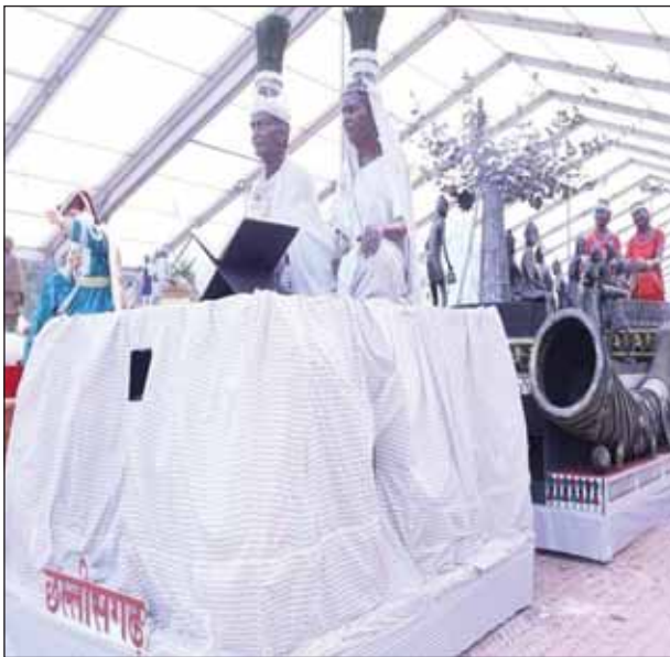
held at National Stadium in Delhi on Wednesday, is presenting the unique cultural identity of the state by depicting the folklife, customs and traditions of Chhattisgarh, he said.

The tableau, which got appreciation from national media in the press preview