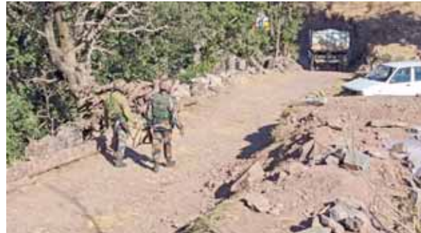
Security personnel keep vigil after the remote Badhaal village was declared a containment zone and prohibitory orders imposed on all public and private gatherings in Jammu and Kashmir's Rajouri district

Raising a 'red flag,' the District Magistrate Rajouri has declared Badhaal village, which has so far witnessed 17 deaths due to 'mysterious illness' since December 7, 2024, a 'containment zone' under section 163 of Bharatiya Nagarik Suraksha Sanhita (BNSS) with immediate effect. Section 163 of the BNSS gives magistrates the power to issue written orders in urgent situations. According to the order issued by the office of the District Magistrate, Rajouri on January 21, 2025, "In view of the recent health situation in the Badhaal area and to curb the spread of infection the following orders are issued under section 163 of BNSS". Meanwhile, four villagers including three sisters have been admitted to the hospital in the last 24 hours.