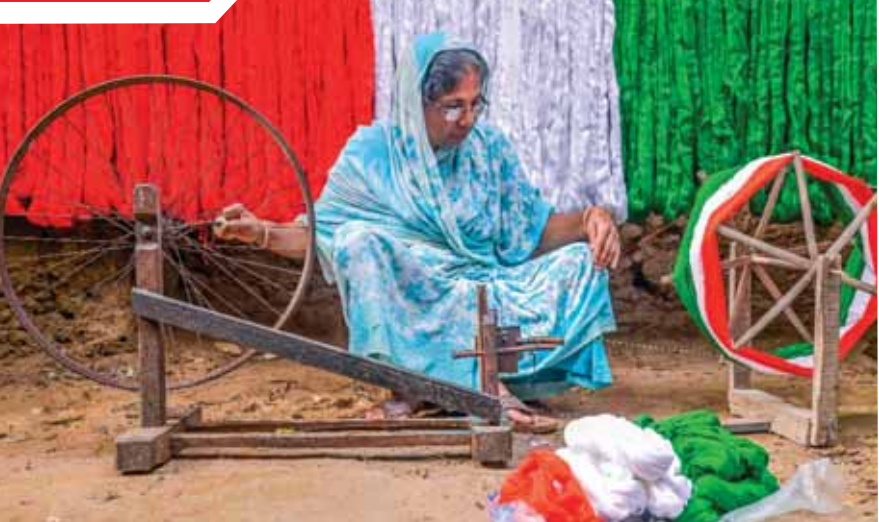
A woman prepares yarn to make the tricolour ahead of Republic Day 2025, in Nadia