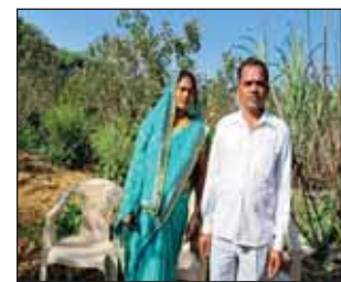
protection. The Agriculture Department taught them the ways of natural farming as part of welfare schemes, the communiqué said.

They cultivate paddy, organic fruits, and vegetables. Their yields are not only healthy but promote soil fertility and environmental