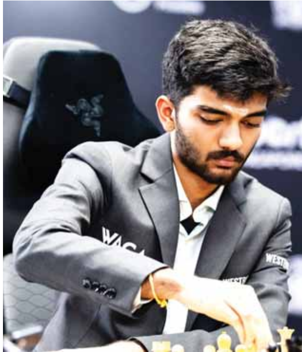
who is perceived as a strong opponent at all levels. With black, Gukesh was

was necessary to put up resistance and Praggnanandhaa made the most of it to emerge victorious. Erigaisi pressed hard against local hero Anish Giri, who was almost winning against Gukesh in the opening round. The battle took a steep turn with both players fighting for advantage in the rook and knight endgame but as it turned out, the draw was a result that most experts expected. Fabiano Caruana was the player of the day as he gradually crushed second best Dutchman Jorden van Foreest right from the early middle game. It was an innocuous London system that Caruana started with and then capitalised on an unforced error to win a pawn which proved decisive. Earlier, after a tension filled game against Giri, Gukesh relaxed with his black pieces and was never in any problem against Fedoseev,