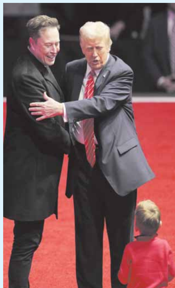
Elon Musk, left, and President-elect Donald Trump embrace as they look at Musk's son X vJ A-Xii, at a rally ahead of the 60th Presidential Inauguration, Sunday, in Washington.

"Since the election, the stock market has surged, while small business optimism has soared a record 41 points to a 39-year high. Bitcoin has shattered one record after another. Major investment company DMACC Properties has announced that it will invest between USD 20 billion and USD 40 billion in the US.